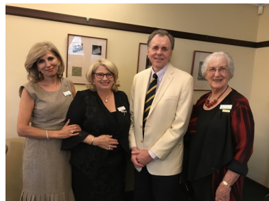
Members with Nobel Laureate Professor Barry Marshall

In addition to these stimulating and informative programs, frequent, special events and speakers can be enjoyed during Friday lunches. Musical and other entertainment on Thursdays, Book Club, Bridge and Mahjong and Art Focus Groups cater for all interests.