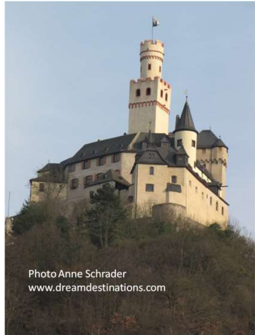
Marksburg Castle, Germany