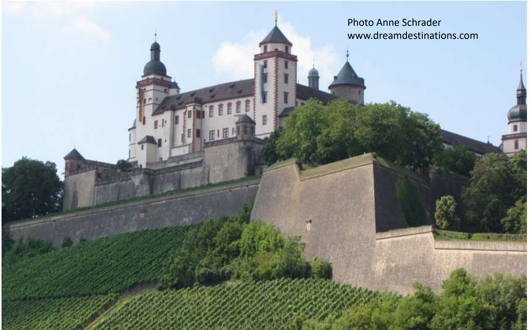
www.dreamdestinations.com