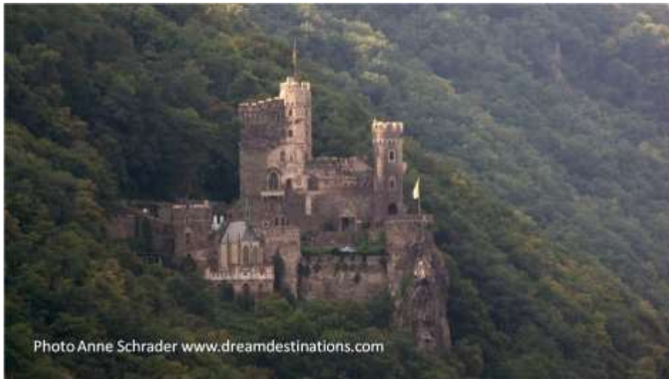
Rheinstein Castle, Rhine River Castles