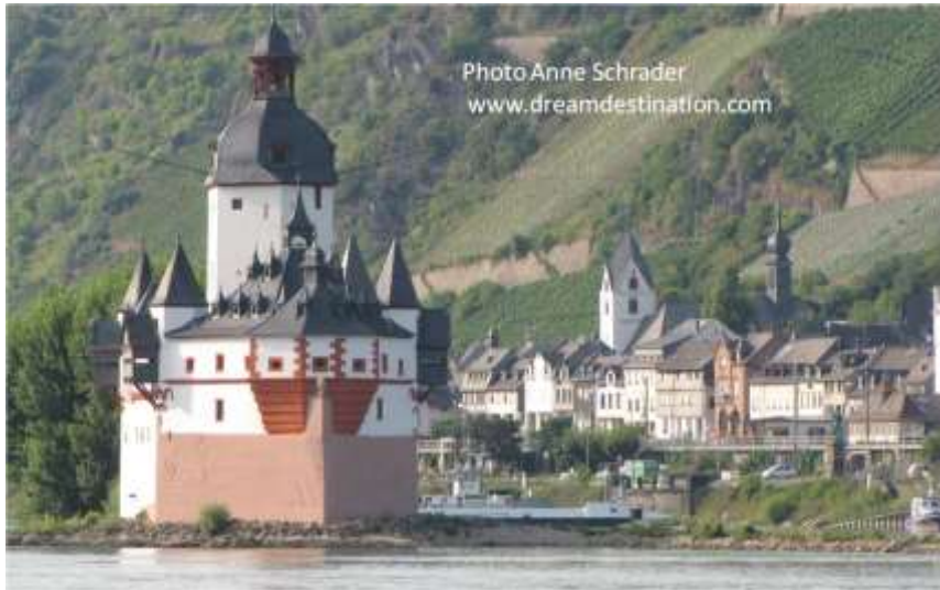
Pfalzgrafenstein Toll Station, Germany