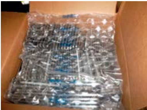
Box overpacked. Devices not individually wrapped in protective packaging.