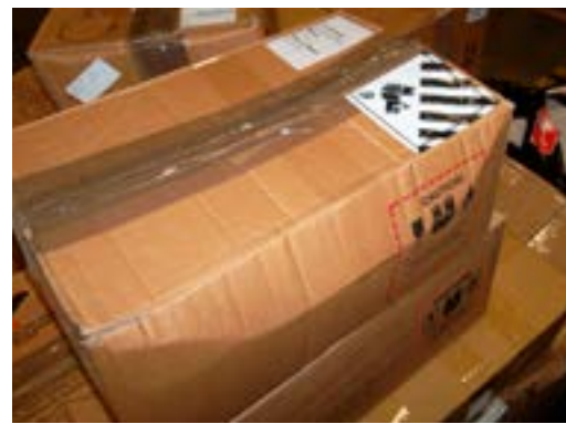
Box overpacked. Incorrect labelling.