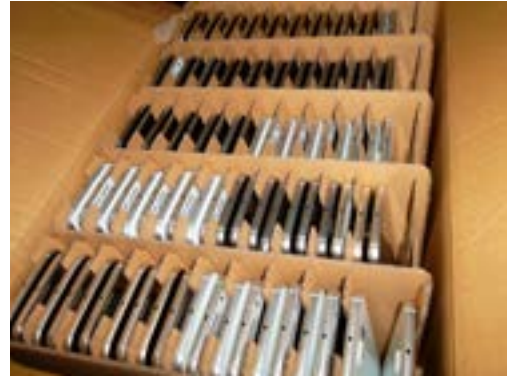
No protective packaging results in metal on metal.