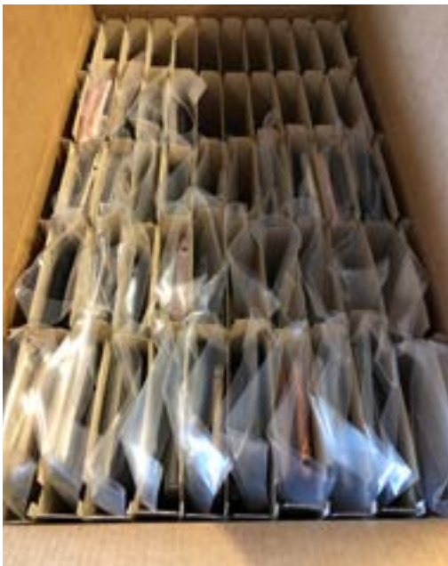
fig 1. Dividers separating devices where available. Plastic sleeves used to protect devices avoiding metal on metal.