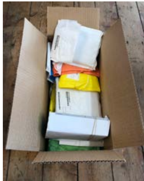
fig 2. Where no dividers available the devices are individually packed in suitable protective packaging: original boxes, jiffy bag, bubble wrap.