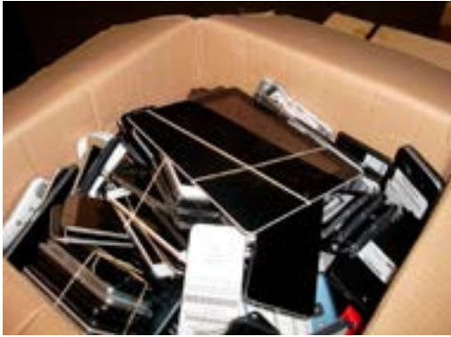
No plastic dividers separating devices.