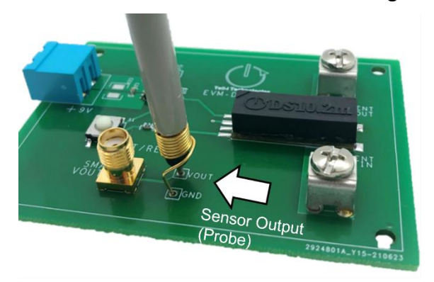
Figure 3. Example of Regular Probing Location