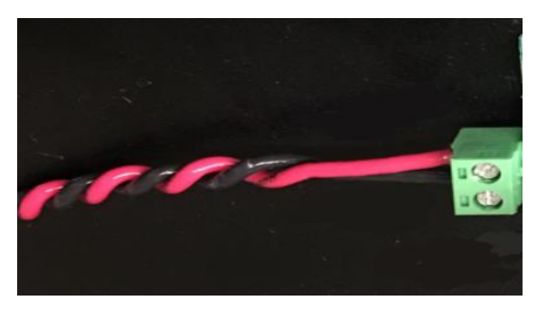
Figure 2. Example of Twisted Leads for Voltage Supply