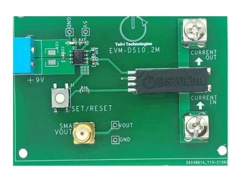
Figure 4. Regular Probing Location and Polarity

Once the +9V supply has been connected and turned ON, the output on these sensors should show 2.5V. This is the default offset of the current sensor. To confirm the sensor is working correctly, please refer to Figure 1 for sensor output and use a multimeter to check for correct voltage.