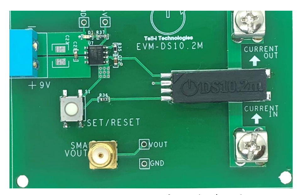
Figure 5. Demonstration of Reset (Set/Reset)

If for any reason the sensor output is not 2.5V, the evaluation board has a manual reset for the current sensor. Simply use the button located by the 9V input called Set/Reset and hold the button for at least 2 seconds, as shown in Figure 5. This will reset the current sensor and should make the sensor output 2.5V. If the sensor output is still not 2.5V, please contact Tell-i for further assistance.