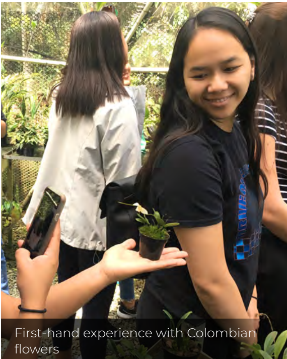
First-hand experience with Colombian flowers

Program fee is usually in the range of $1,400 - $2,200 per student, depending on the number of students, the number of free seats for faculty, and the nature of the itinerary.