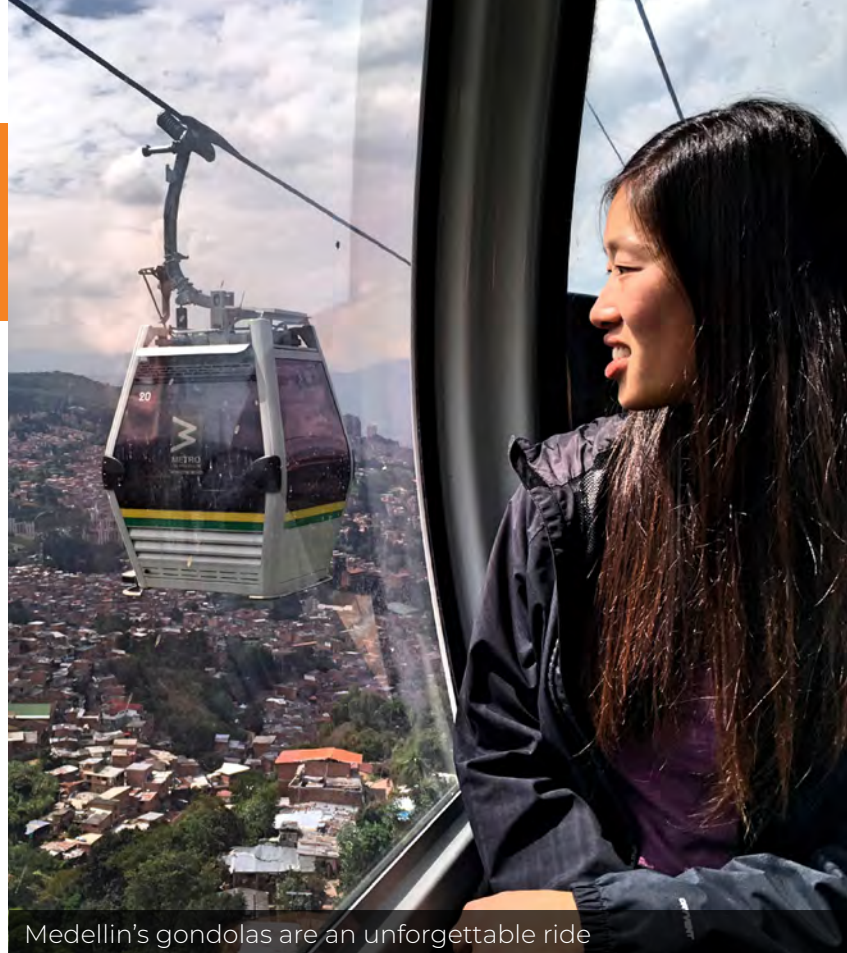
Medellin's gondolas are an unforgettable ride

Day 5: Presentation at US Embassy from US Agricultural Attaché and the President of the