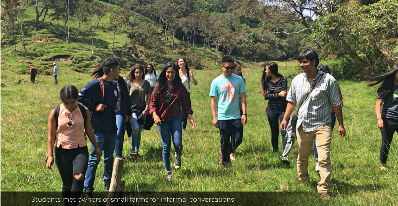
Students met owners of small farms for informal conversations