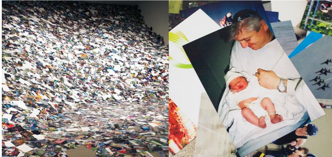
Figs 1a and 1b. Erik Kessels, general view and detail of 24 Hrs in Photos , 2013. At the Secondhand exhibition (1 Aug 2014--31 May 2015), Pier 24 Photography.