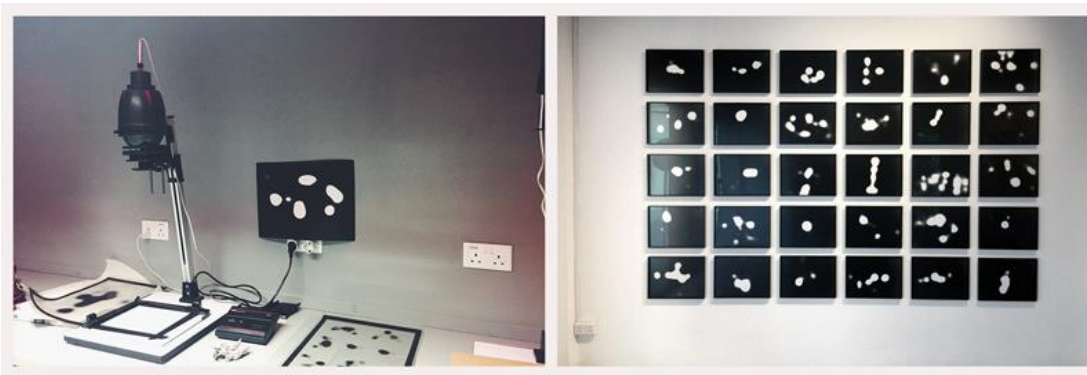
Figs 3a and 3b: Focus maps printed in the darkroom and photo from the exhibition titled Phenomenological Lightworks . (© Theopisti Stylianou-Lambert & Omiros Panayides, 2018)

For the first part of the work--- Tracking the Loving Gaze: Focus Maps ---we printed the participants' focus maps on film and then developed these in the photographic darkroom on gelatin silver print paper (see Figs 3a and 3b). Effectively, we started with the mainly digital photographs that the participants had provided, tracked the participants' loving gaze with the help of a technological device, and fixed that gaze on photographic paper in the traditional darkroom. As the eye tracking process required a unique photograph and a few seconds to register the participants' gaze, so did the darkroom process: it required a few seconds for the print to register and develop and the final result was a unique photograph. The 30 prints, each measuring 12x14.5 inches, are 1 of 1 prints. In a sense, we produced a unique registration of a unique loving gaze.