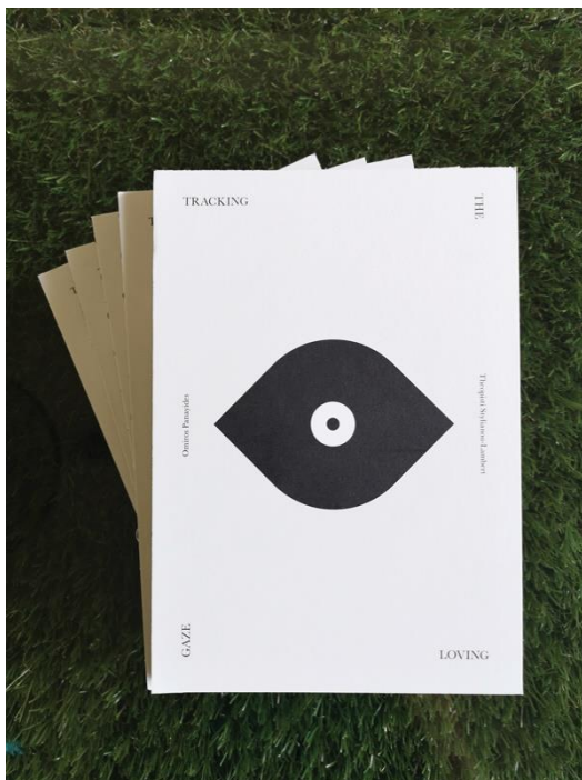
Fig. 7. Tracking the Loving Gaze artist book, 2019. Book design: Philippus Vasiliades (© Omiros Panayides & Theopisti Stylianou-Lambert, 2019).

In 2019, we produced the final part of our project: a limited-edition book in 100 numbered copies (Fig. 6) that includes at the back an original darkroom print (4x6 inch) of a focus map. The book, as a medium, was an intended outcome from the beginning and as such, renegotiates the work that was produced in previous steps, attempting an alternative, more intimate viewing experience of the project.