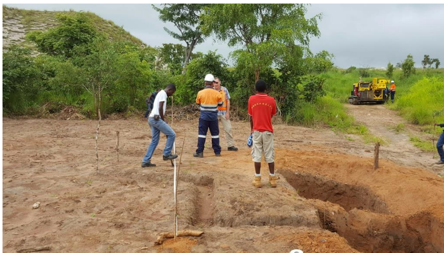
Image 2. Drill rig arriving at the proposed drill hole site as prepared.