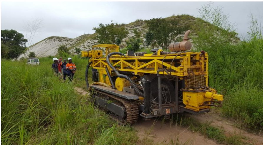
Image 1. Drill rig walking to the drill pad at Manono after unloading.

AVZ Minerals Limited (“AVZ” or the “Company”) is pleased to announce that it has commenced a 20,000m drilling program at the Manono Lithium Project in the Democratic Republic of Congo (“DRC”). Equator Drilling’s (“Equator”) drill rig and associated drilling equipment has arrived at site and all preliminary preparation was completed over the past week with sumps being excavated, drill pipe being offloaded and site inductions completed for all personnel, see Images 1 and 2.