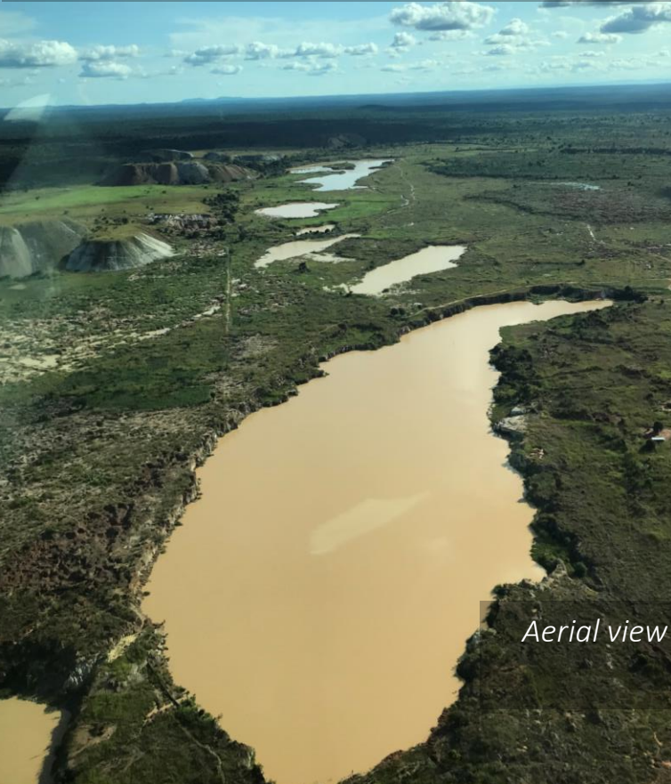
Aerial view of the Manono Lithium and Tin Project looking South towards Roche Dure (April 2019)