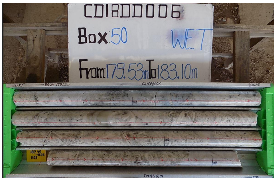
Figure 2: CD18DD006. 181 – 182m 4.65% contained \text{Li}_2\text{O}

The exciting near surface, high-grade zones of this flat dipping deposit, coupled with strong surface spodumene mineralisation noted from mapping and these new drill results, have extended the strike of the deposit to at least 1.5 kilometers long and there is no evidence to suggest it does not continue under cover towards the Tempête pegmatite some 2 kilometers to the southwest.