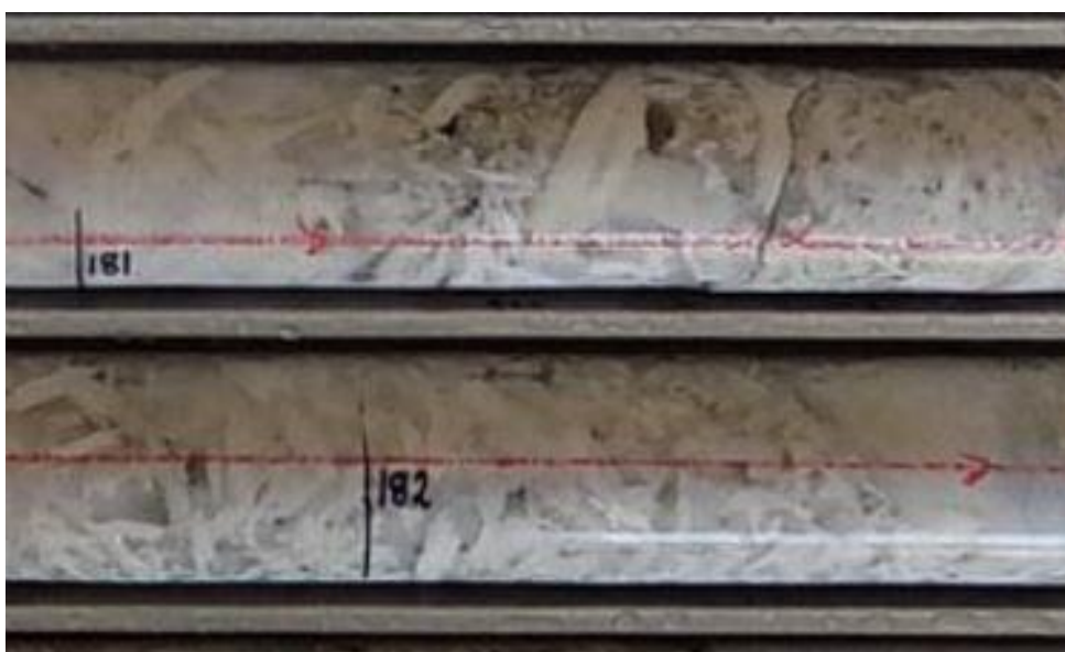
Figure 3: Close up of core from 181 to 182 metres in drill hole CD18DD006 with very coarse spodumene throughout the interval