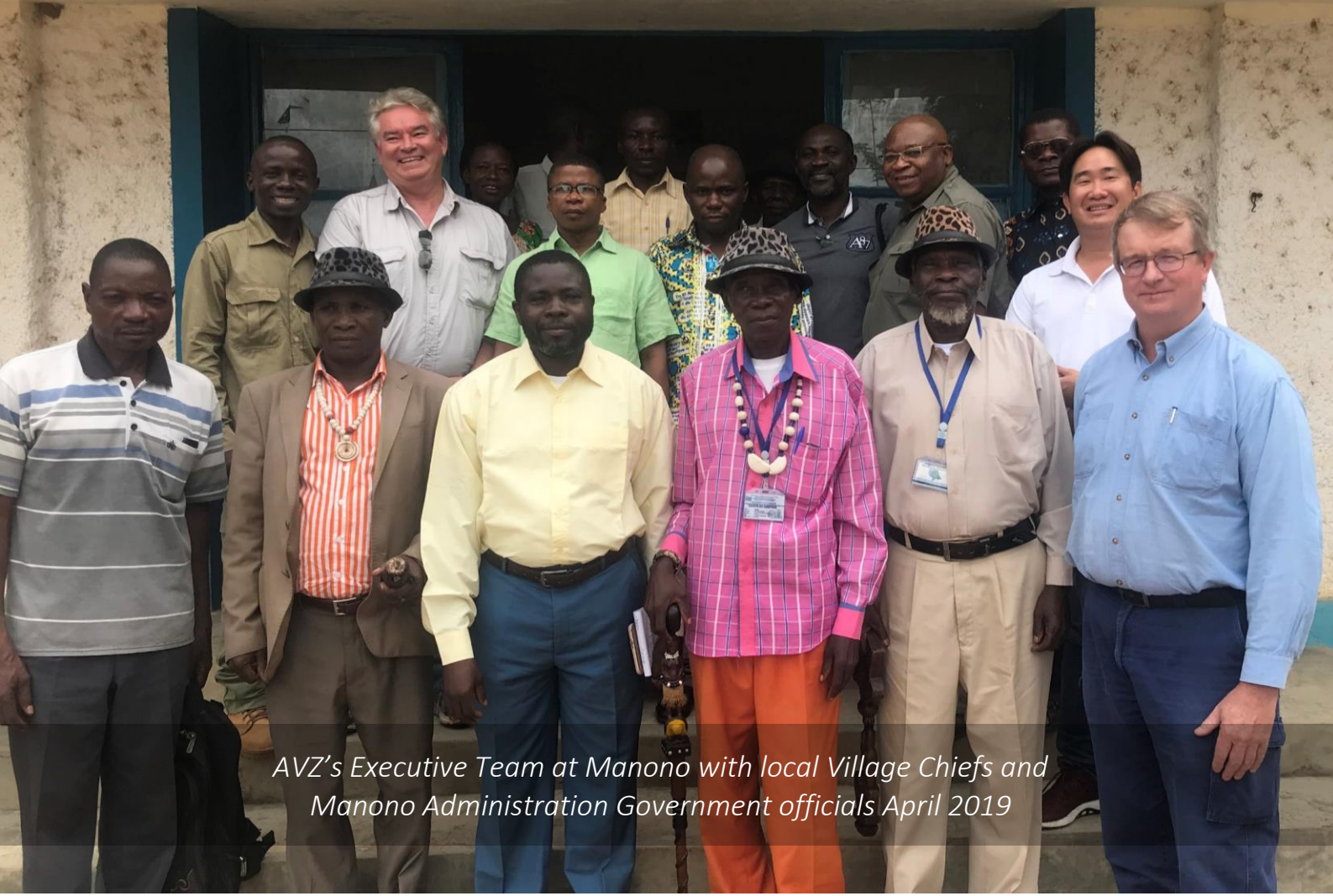
AVZ's Executive Team at Manono with local Village Chiefs and Manono Administration Government officials April 2019