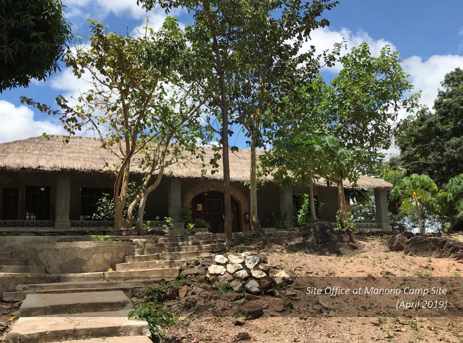
Site Office at Manono Camp Site (April 2019)