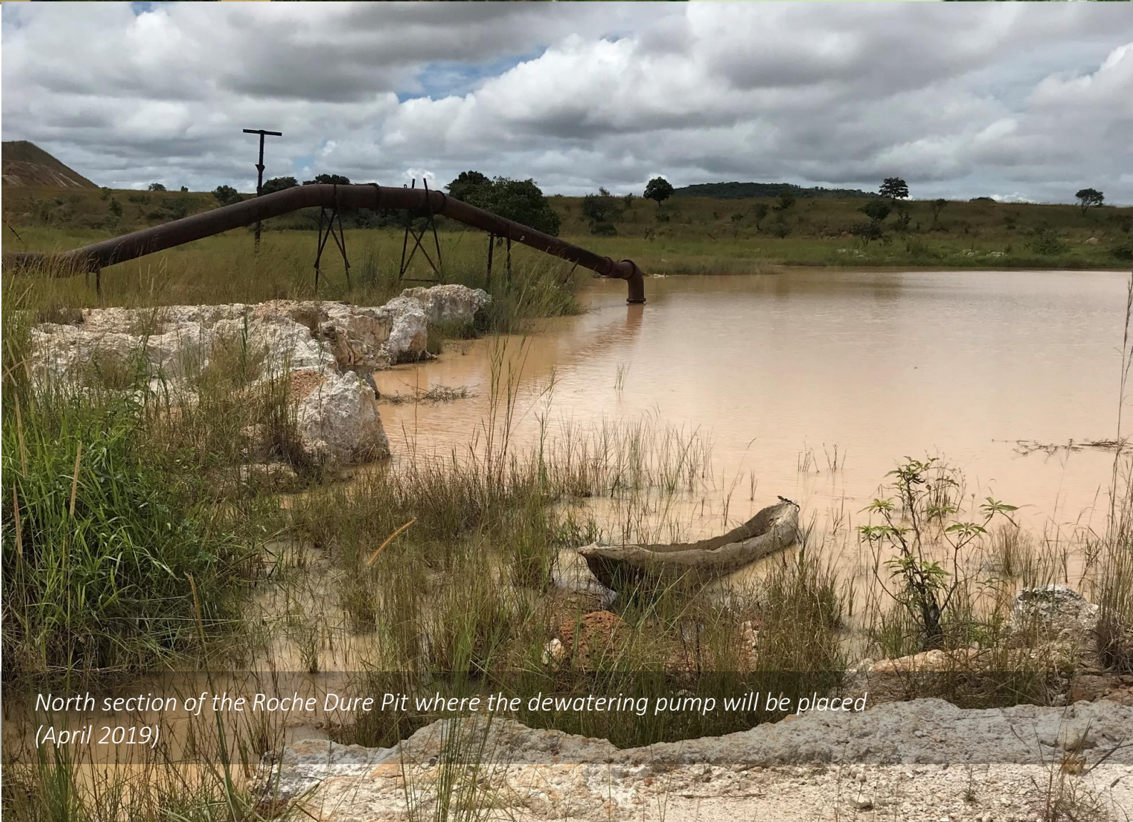
North section of the Roche Dure Pit where the dewatering pump will be placed (April 2019)