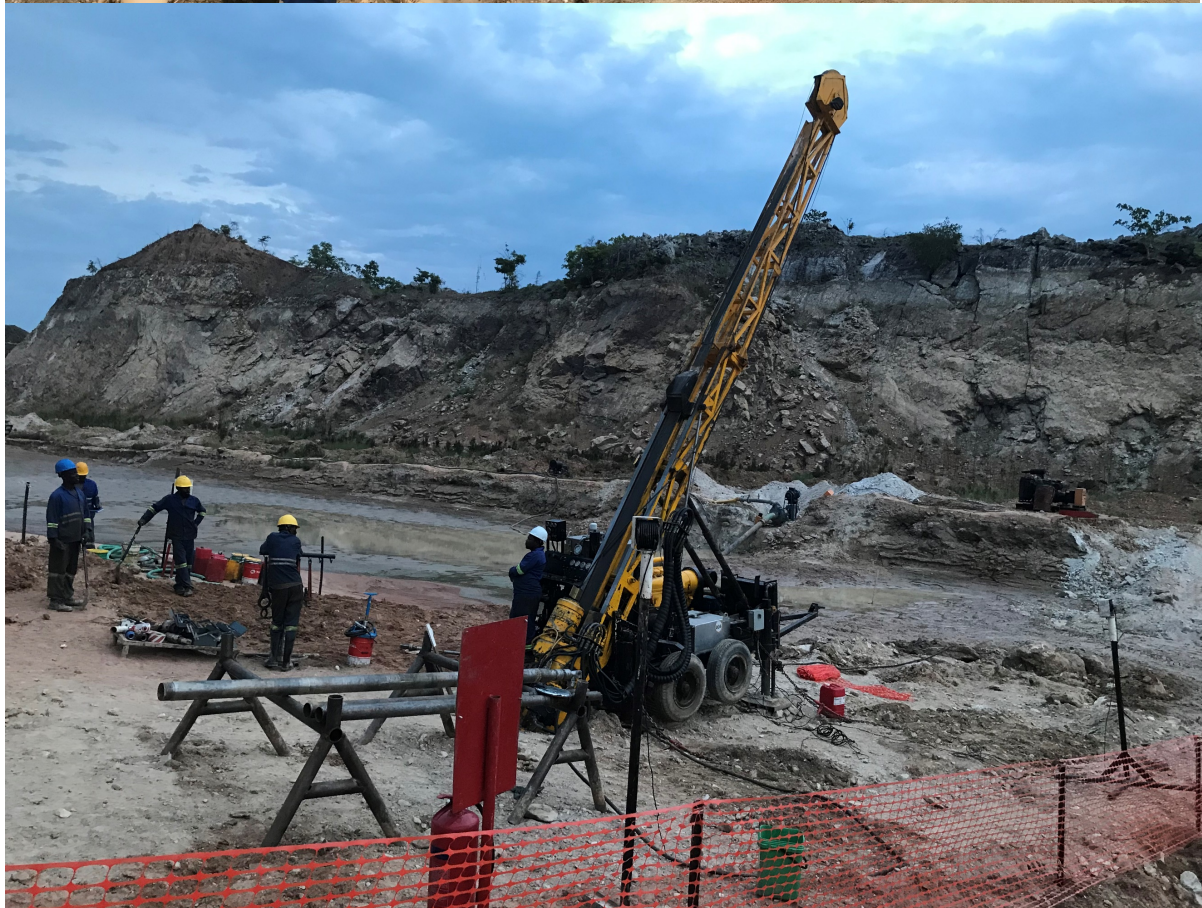
Figures 1-3: Drilling within the Roche Dure 'wedge' confirmed further high-grade lithium and tin mineralisation directly beneath the historic pit floor