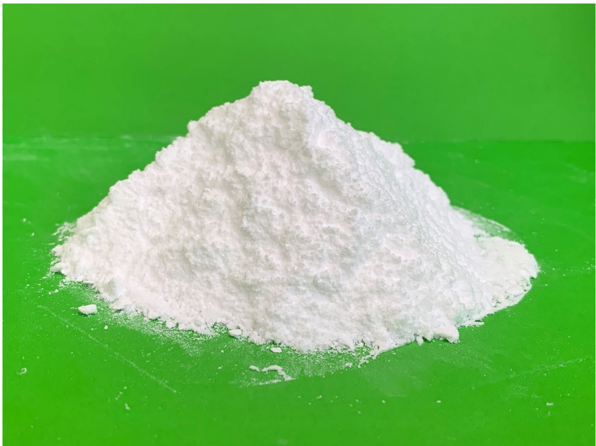
Figure 5: Primary Lithium Sulphate produced under metallurgical testing for AVZ's planned Manono Lithium Sulphate Plant

KPM found the Primary Lithium Sulphate product produced by the metallurgical testing would make a highly suitable feedstock for the electrolytic production of Lithium Hydroxide Monohydrate.