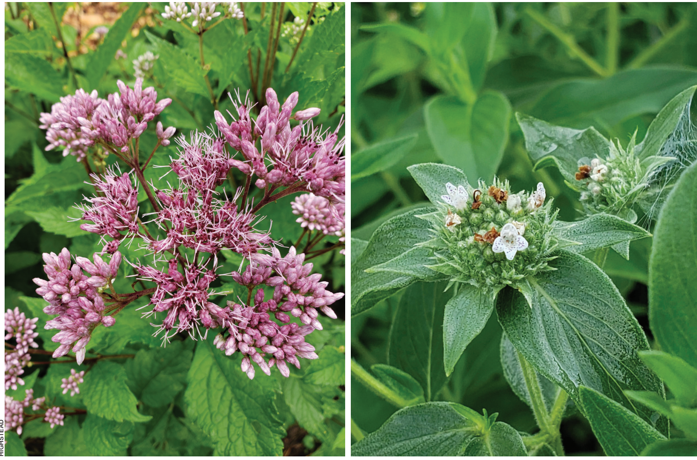
Joe-Pye weed (left) and mountain mint (right) are two of the plants grown at Highstead, a nonprofit education and conservation organization.