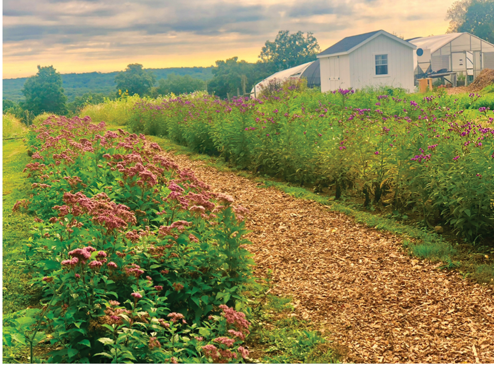
The Hickories, a diversified organic farm in Ridgefield, Connecticut, is one of eight farms collaborating with the Ecoytpe Project to grow native plants to support efforts to boost pollinator habitat in the region.

Preserve, working with Massachusetts-based Landscape Interactions. A bee ecologist catalogued pollinators before changes to the landscape were made, and will return in three years to conduct another survey. This study will show whether integrating ecotype plants into the landscape has brought back more bees. When pollinators and other insects return, birds and other wildlife in the food chain will follow, healing the landscape.