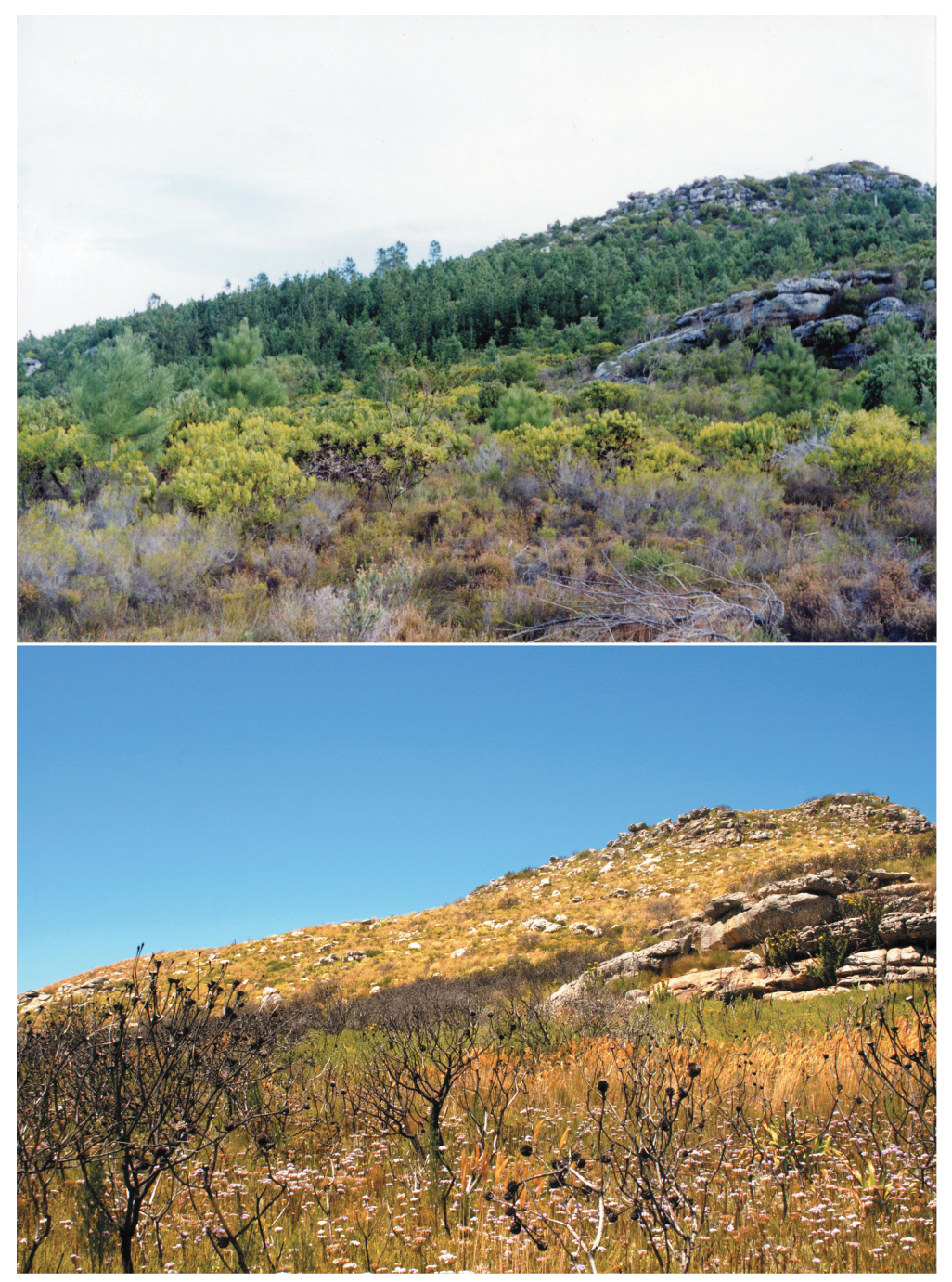
Silvermine_92_5264: Encroaching pines, Silvermine/Noordhoek border. Original: Cowen 1995. Repeat: Watermeyer 2016. Images copyright of rePhotoSA (http://rephotosa.adu.org.za/) under a CC BY-NC 4.0 Creative Commons license.