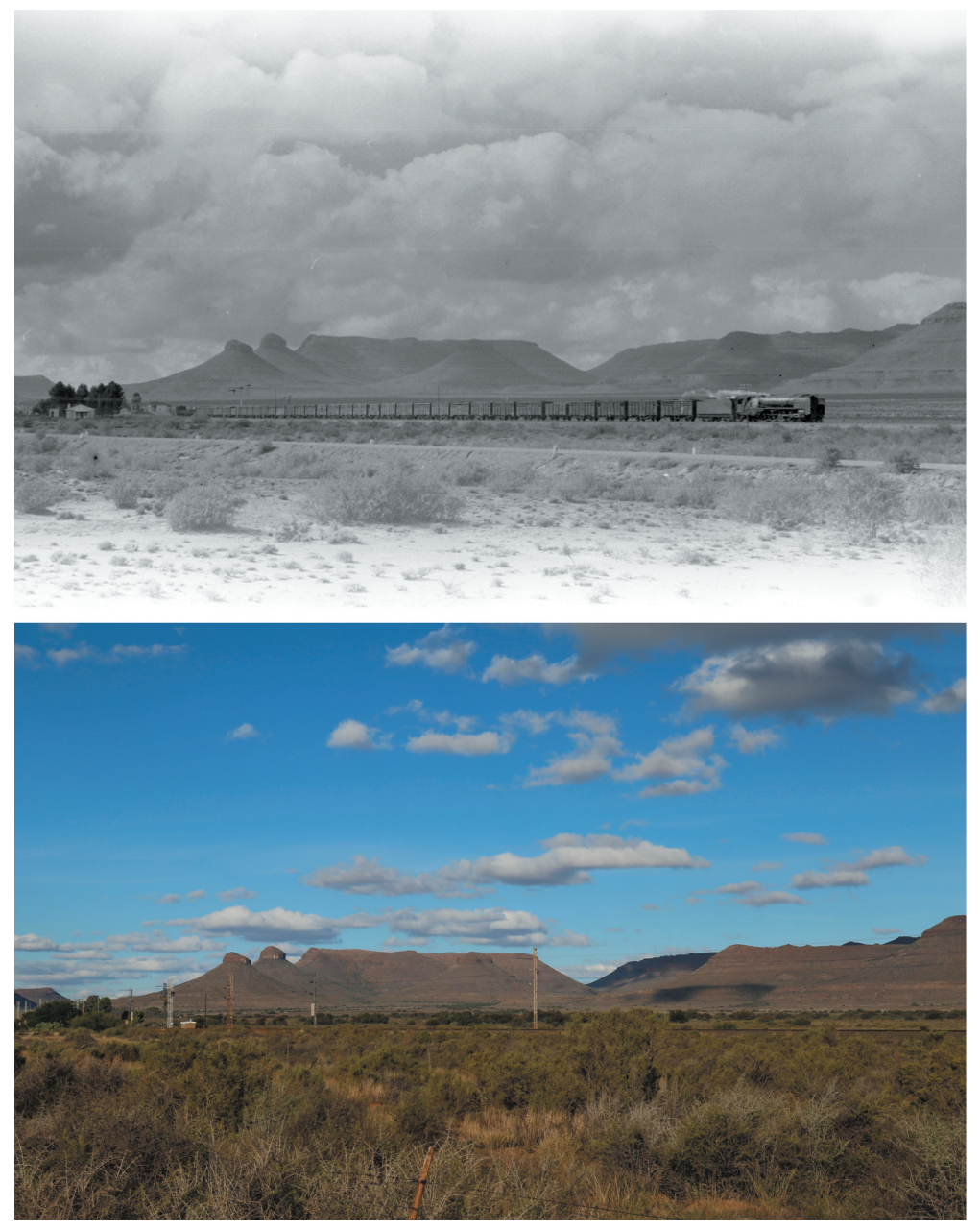
Three Sisters_49_4797 : The Three Sisters. Original: Acocks 1948. Repeat: du Toit 2016.