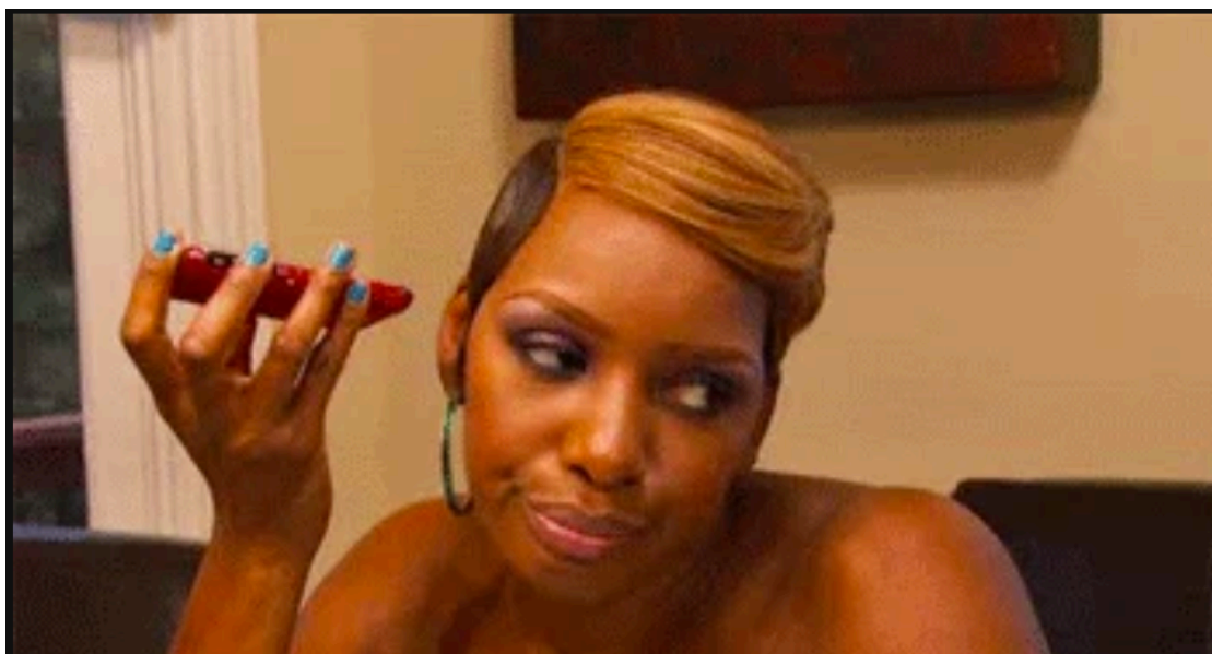
Figure 2: NeNe Leakes Reaction GIF from The Real Housewives of Atlanta