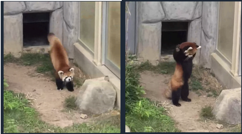
Figure 5: Red panda surprised by rock

with the panda's sudden reaction remaining entertaining—and even intensifying in hilarity— several loops later.