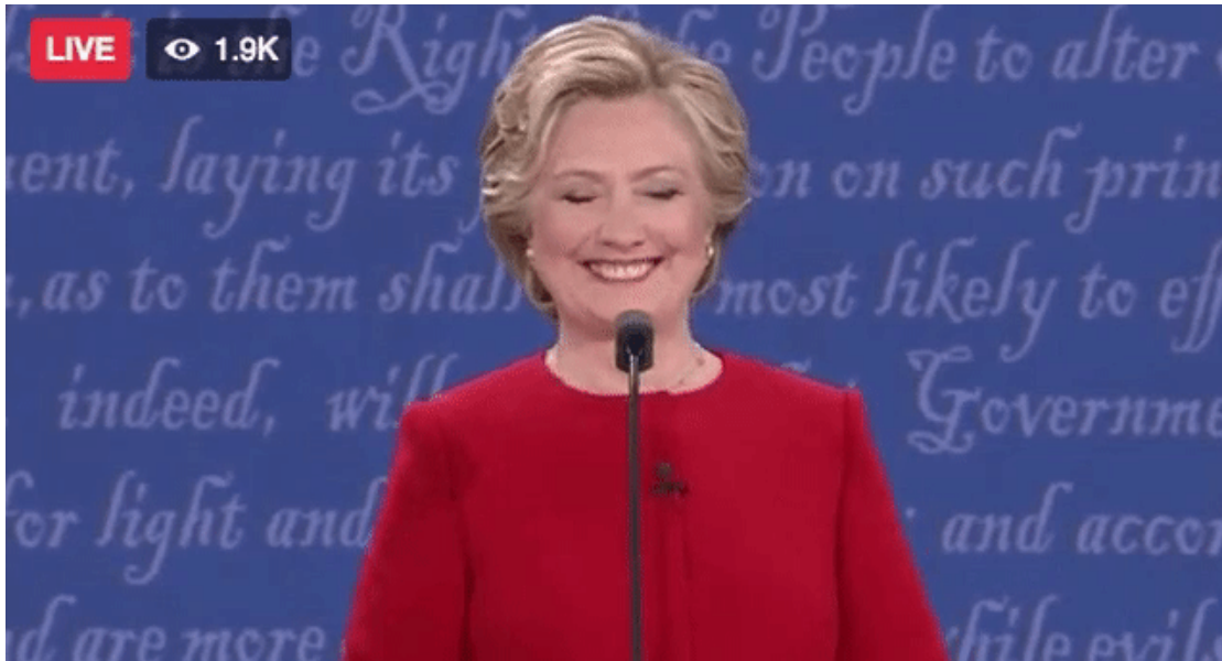
Figure 1: the 'Hillary Shimmy' GIF (screenshot)

appreciation for Hillary Clinton herself. Friends of this person (or people within the same community) would likely understand most of the meanings intended by the GIFs use; however, strangers or people from different communities would likely miss many, if not all, of the intended meanings—or misunderstand its use entirely.