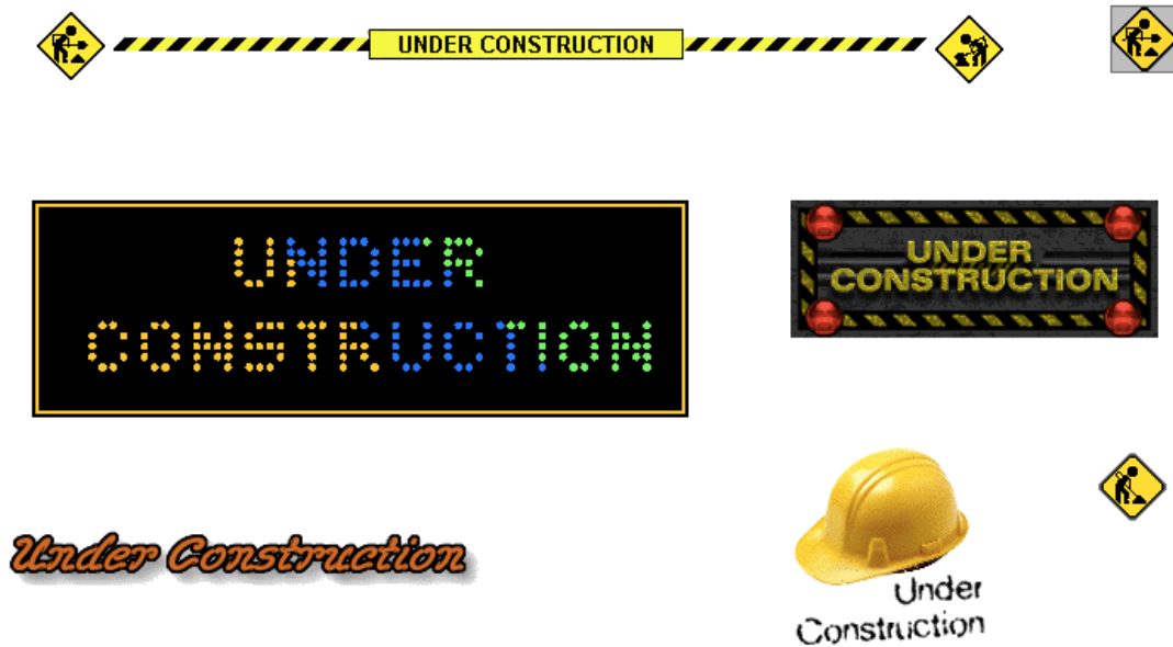
Figure 4: examples of Under Construction GIFs (from GIFcities)

Created in 1987 by CompuServe engineer Steve Wilhite, the Graphics Interchange Format is an image file format that used lossless data compression. What set the GIF apart from other static image formats such as the JPEG or PNG was its additional support for looping sequences. The GIF can display frames on repeat within the same image file without being the size (or resolution) of a video. For the early web, the GIF was an ideal way of adding visual content and movement to a website at a time when bandwidth was limited and video and image-editing software were less advanced. Most typical of the era is the 'Under Construction' imagery (see Figure 4), where unfinished websites would feature a GIF (or GIFs) which variously included construction signage, flashing lights, and hard hats, as rotating banners, heavily pixelated iconography, and more (Ulanoff, 2016).