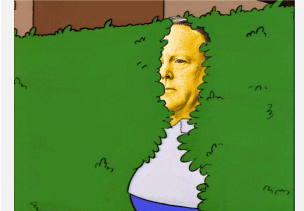
Figure 3: Sean Spicer as Homer Simpson disappearing into bushes

In this paper, we examine the GIF as cultural text and device. This is distinct from a specific focus on the .gif file format – a minor distinction, perhaps, but one that has become important to note in response to how different social media platforms and apps treat the GIF, where not all GIFs presented are .gif files. While the GIF has certain technical affordances that make it highly versatile, this is not the sole reason for its ubiquity. Instead, GIFs have become a key communication tool in contemporary digital cultures thanks to a combination of their features, constraints, and affordances. GIFs are polysemic, largely because they are isolated snippets of larger texts. This, combined with their endless, looping repetition, allows them to relay multiple levels of meaning in a single GIF. This symbolic complexity makes them an ideal tool for enhancing two core aspects of digital communication: the performance of affect and the demonstration of cultural knowledge. The combined impact of these capabilities imbues the GIF with resistant potential, but it has also made it ripe for commodification. In the pages that follow, we outline and articulate the GIF’s features and affordances, investigate their implications, and discuss their broader significance for digital culture and communication.