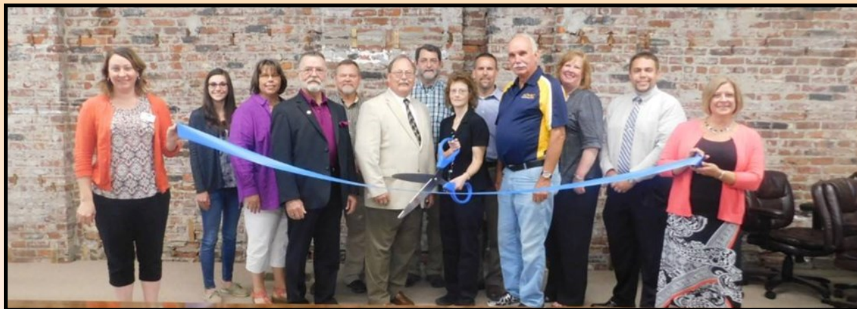
Various staff and board members pictured