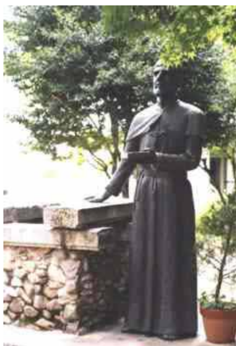
2. Xavier preaching

Francis was born in Holy Week in 1506 in the family castle of Javier in the Basque kingdom of Navarre, now part of Spain. He was the fifth and youngest child of pious parents who instructed him well in the faith and gave him excellent example in the living of it. When he went to study at the University of Paris at the age of 19, he was undoubtedly a committed Christian determined to live a genuinely Christian life. But Francis also had worldly ambitions. After completing his study in Paris, he hoped to return to his homeland and, as a scholar-priest of noble blood with influential connections, find a well-paying position that would help to relieve the failing finances of his family. He was a Christian, but Christ was not yet at the center of his life.