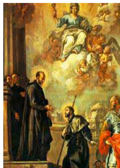
3. Ignatius missions Xavier