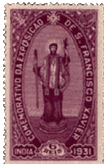
7. Stamp honoring Xavier

In addition to all the sufferings he underwent in the natural course of his missionary labors, Francis imposed additional penances upon himself. He lived the life of a poor man: he chose to live in the poorest of quarters; he ate and dressed like a poor man. He fasted and scourged himself. The few hours of sleep he allowed himself he spent on bare boards or on the bare ground. In everything he wished to be like the suffering Christ with whom he was so greatly in love.