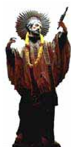
4. Xavier with a crucifix

Francis spent ten years as a missionary, years full of adventure and rich in anecdote. But the scope of this pamphlet does not allow us to go into great detail. Here we will merely give a summary of the activity of those ten years as a background for what we want to say about