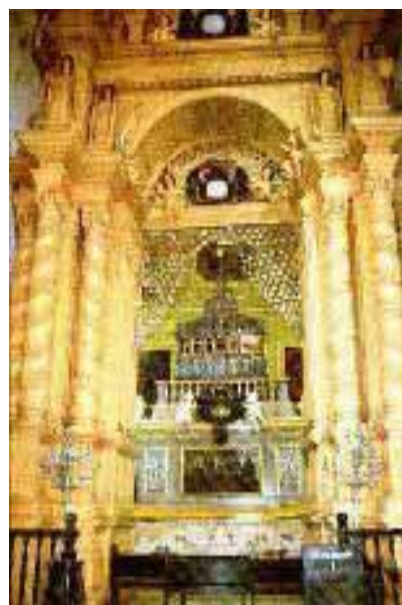
5. Xavier mausoleum in Goa

Abundant spiritual consolations . . . are to be found on these islands; for all the toils and dangers that are willingly encountered here for the love and service of God our Lord alone are treasures abounding in great spiritual consolations, so