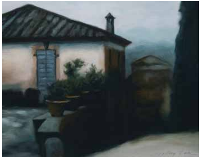
Twilight, Cetinale | 9.25 x 12" | LK741