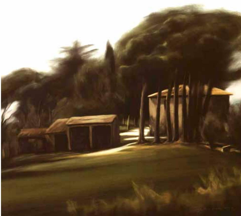
Petignano, Tuscany | 16 x 18" | LK447