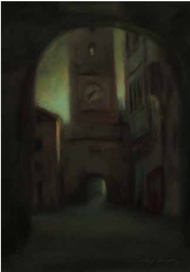
Castelfranco, Veneto | 14 x 10" | LK771