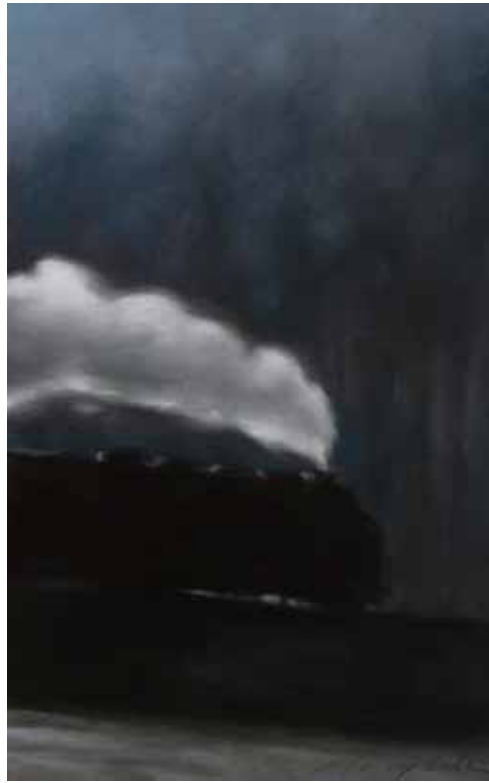
In the Light of the Moon | 12.5 x 7" | LK775