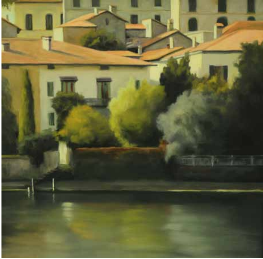
Colonna, Lake Como | 20 x 20" | LK731