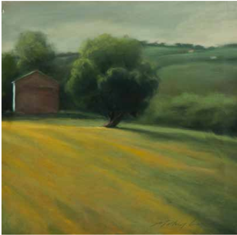
Villa Avellana | 11 x 11" | LK770