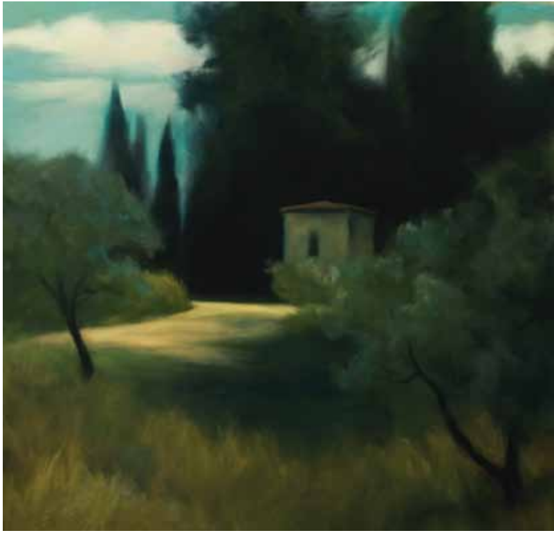
San Lazzaro, Tuscany | 16 x 16" | LK698