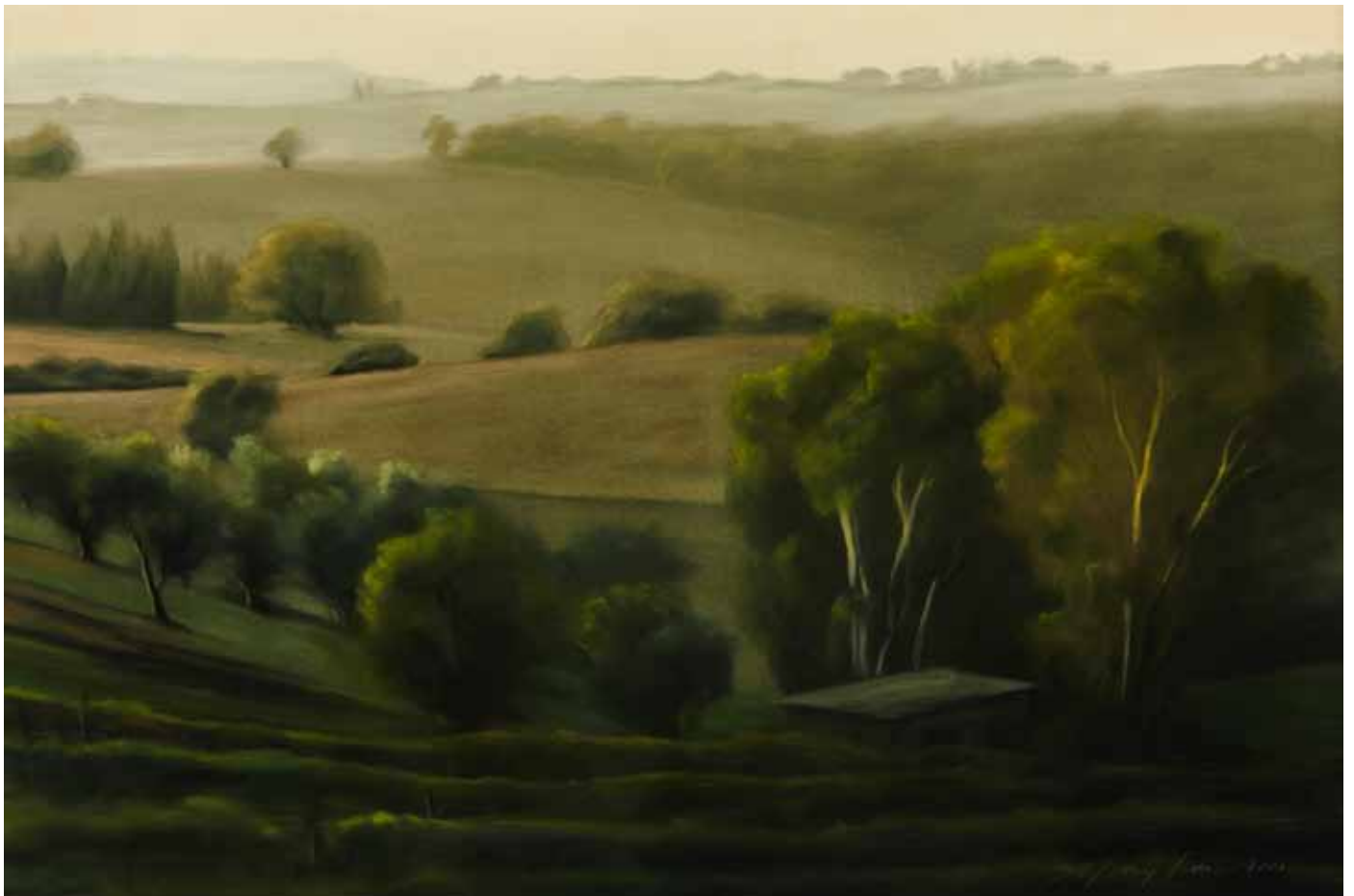
Sunrise, San Ambrogio | 16 x 23" | LK740