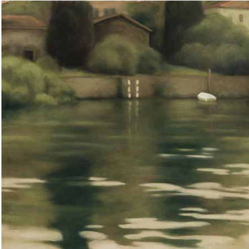
Lake Como | 18 x 18" | LK777