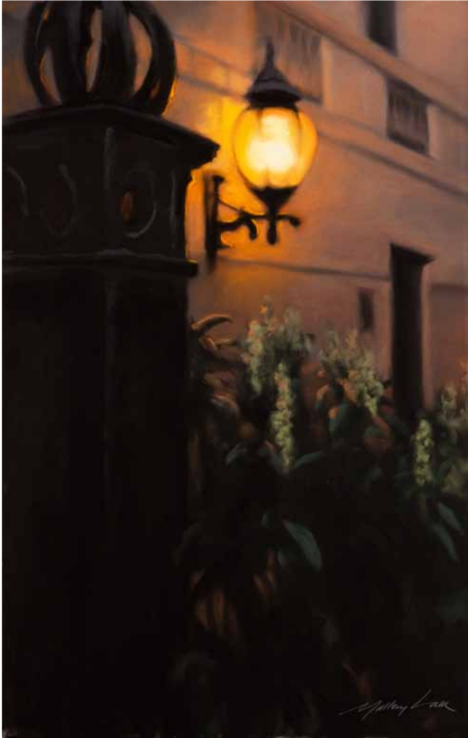
Evening's Beacon | 24 x 15" | LK710