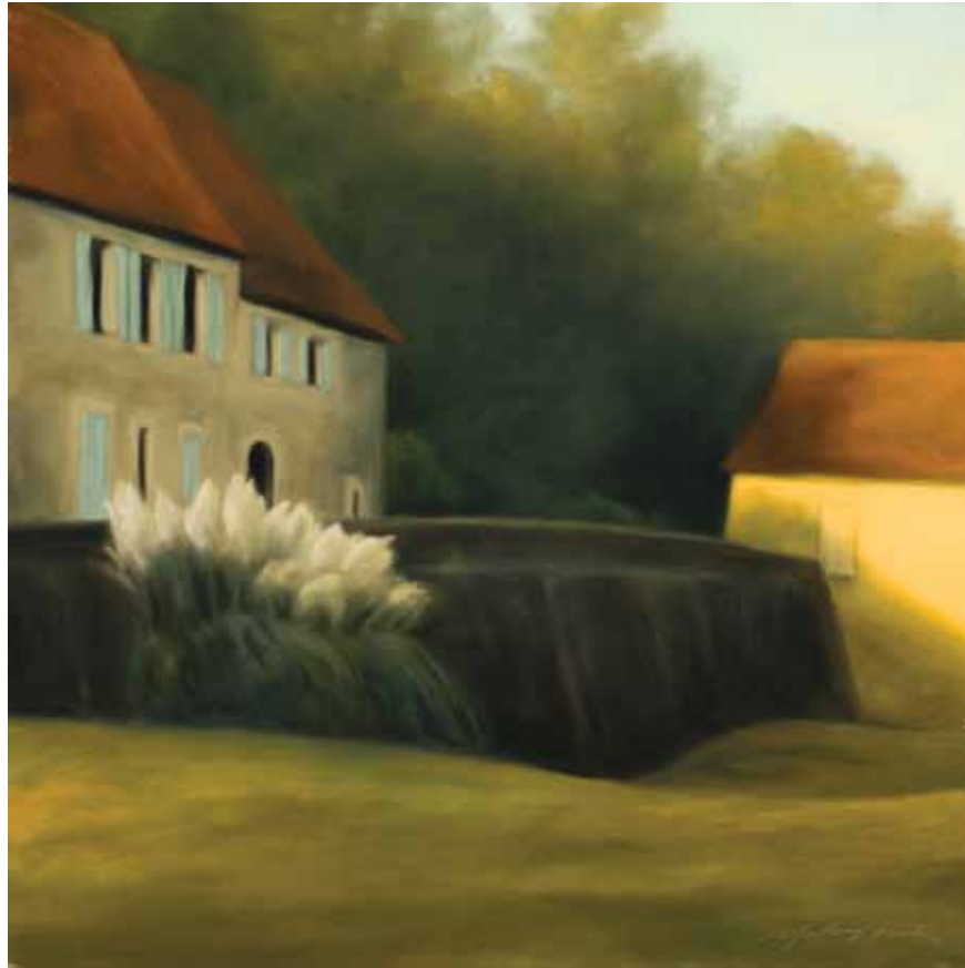
Les Eyzies-de-Tayac-Sireuil (Yellow Building and Grasses) | 18 x 18" | LK669