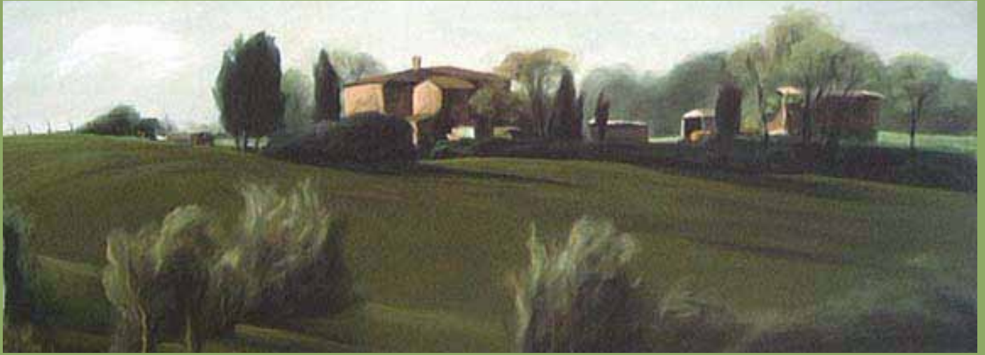
S. Ambrogio, Tuscany | 10 x 26" | LK443