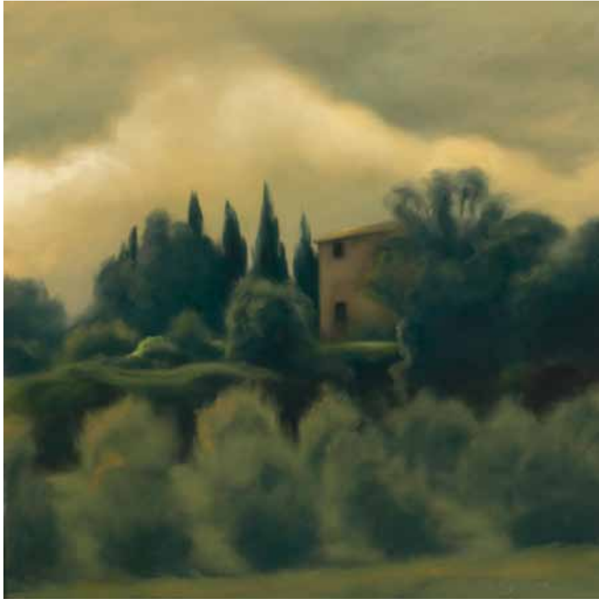
Strove, Tuscany | 18 x 18" | LK627