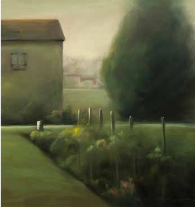
Argine | 16.5 x 16" | LK765