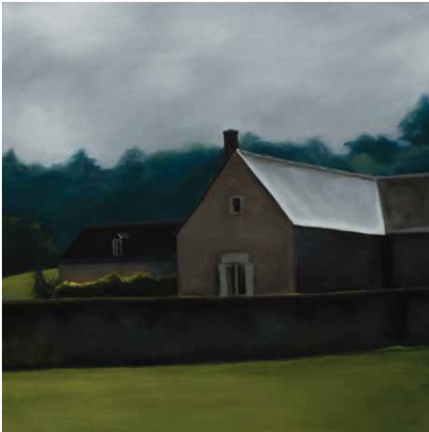
Villandry | 18 x 18" | LK665