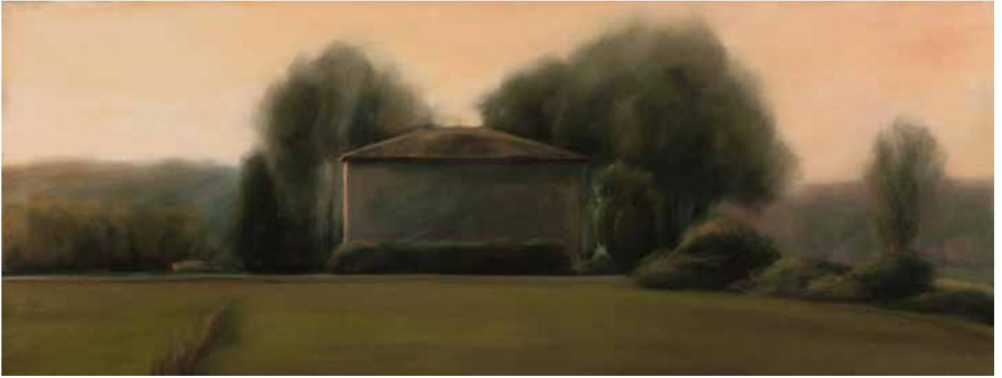
San Giovanni alla Vena | 10 x 26" | LK764