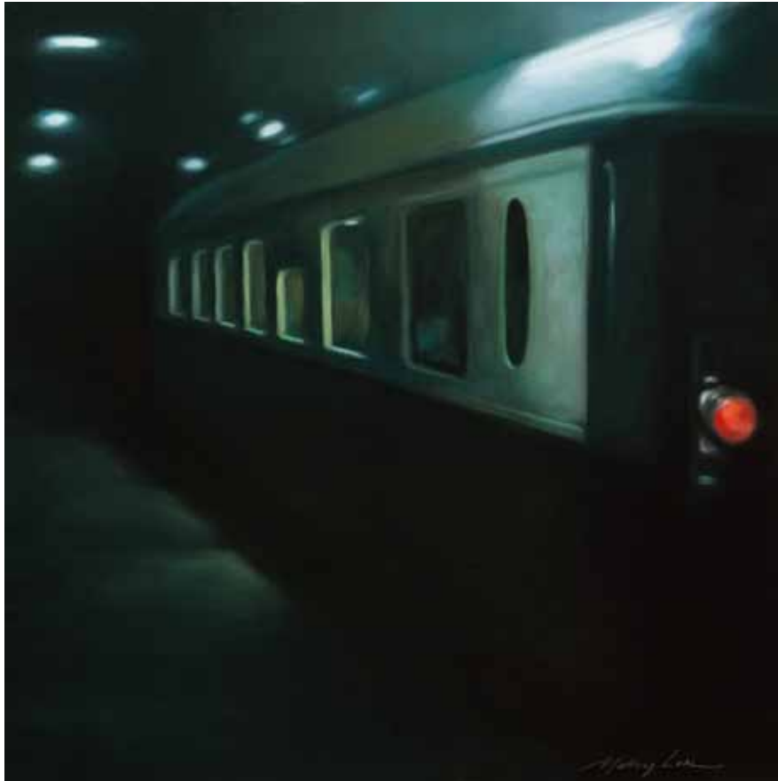
The Last Stop | 18 x 18" | LK703