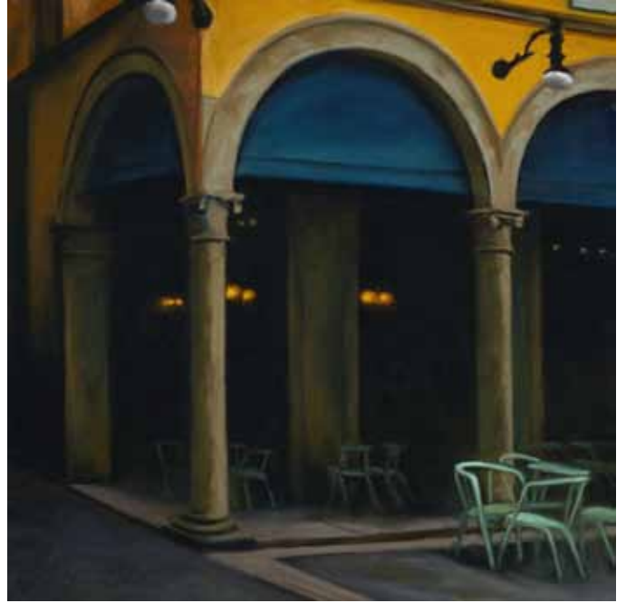
Caffè Meletti | 16 x 16" | LK756