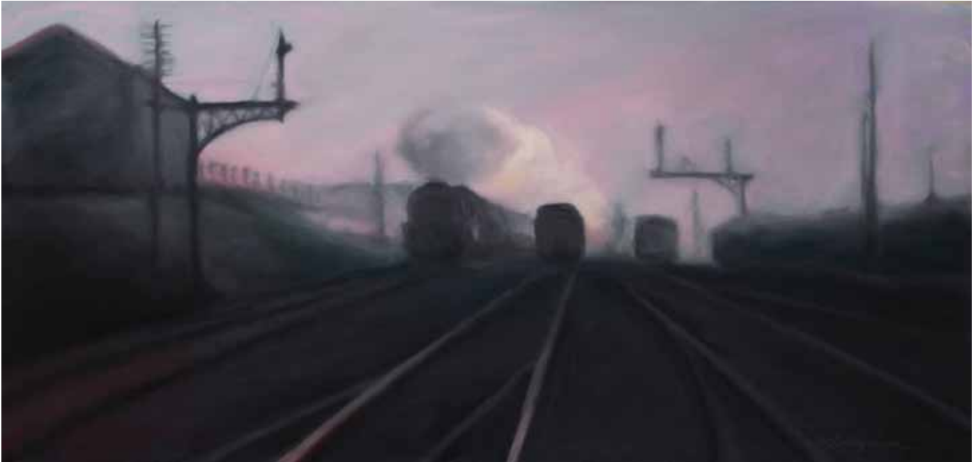
The 7:55 | 14 x 30" | LK688