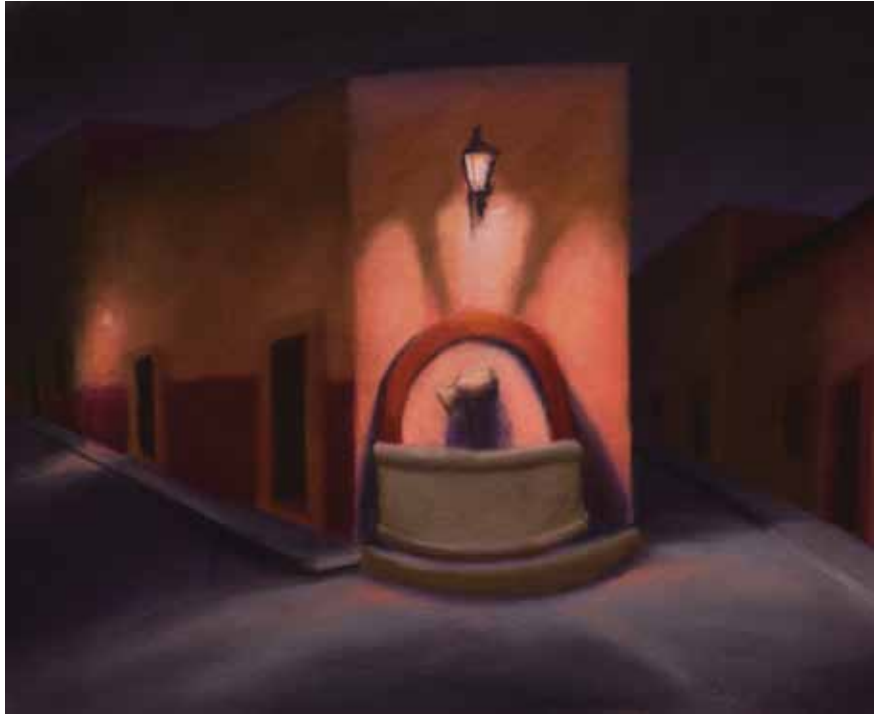
La Fuente | 18.5 x 14.75" | LK77