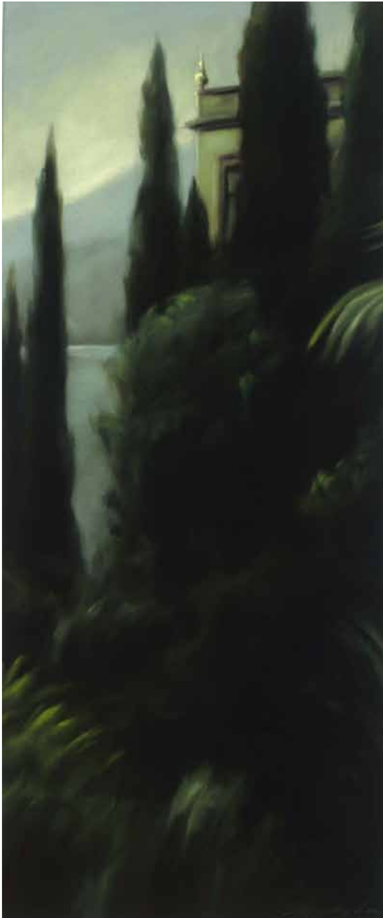
Twilight, Villa Cipressi | 28 x 12.5" | LK527