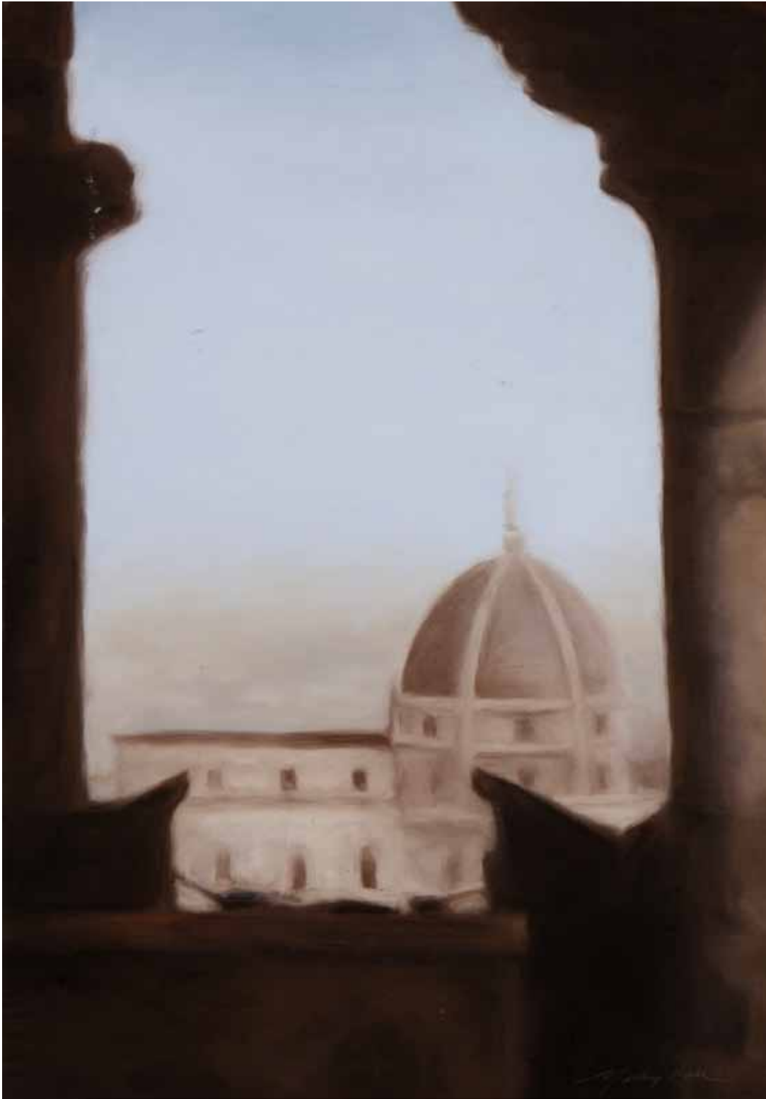
Il Duomo di Firenze | 24 x 17" | LK768