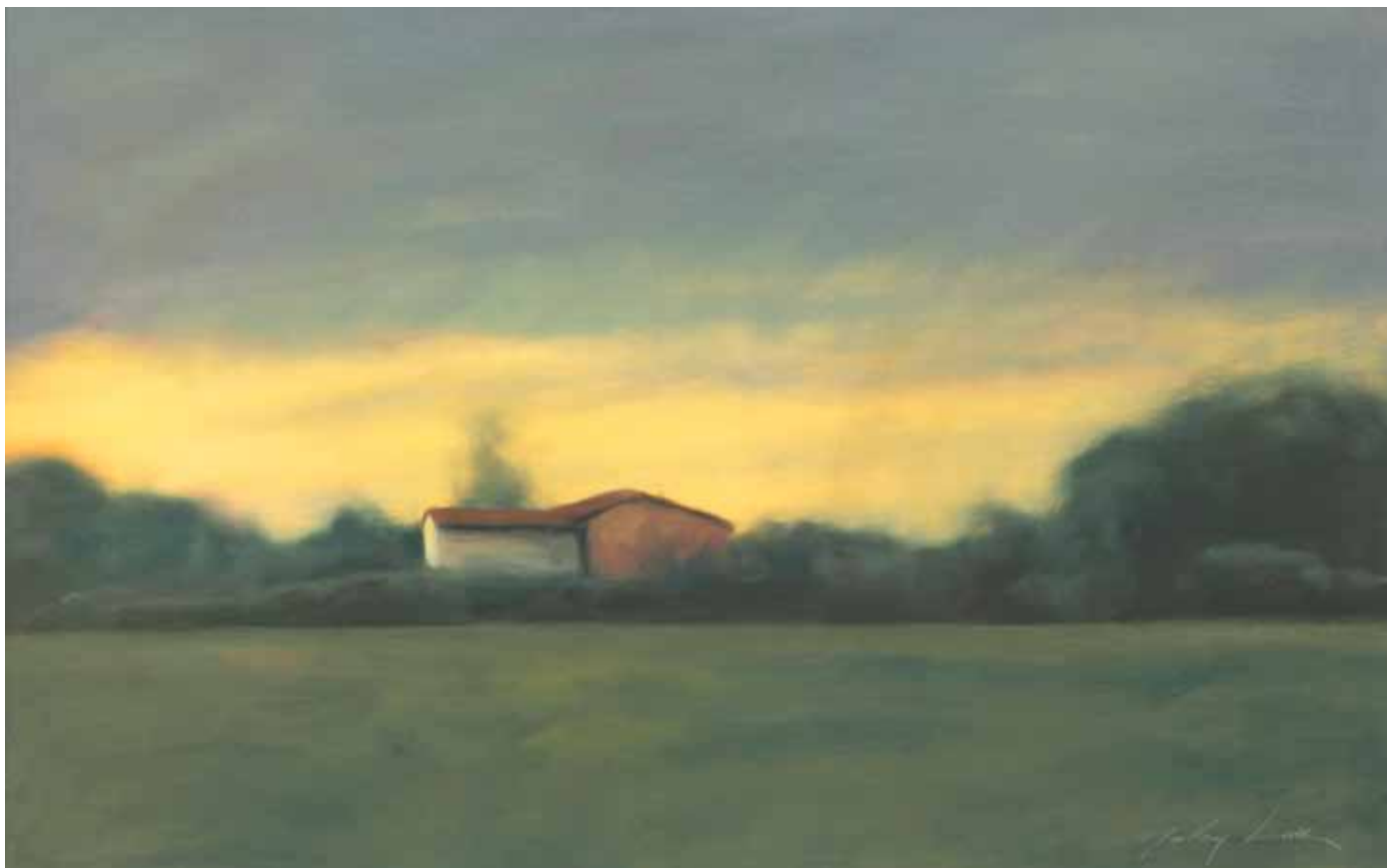
Storm Clouds, Colombaro | 15 x 24" | LK646