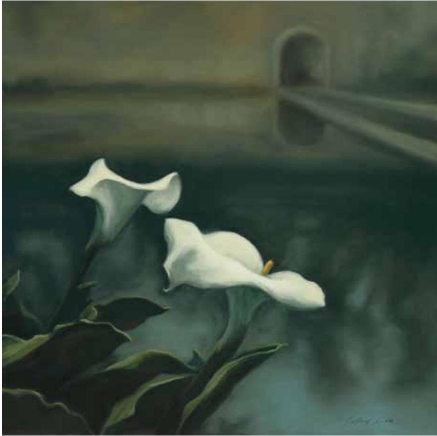
The Reservoir | 18 x 18" | LK670