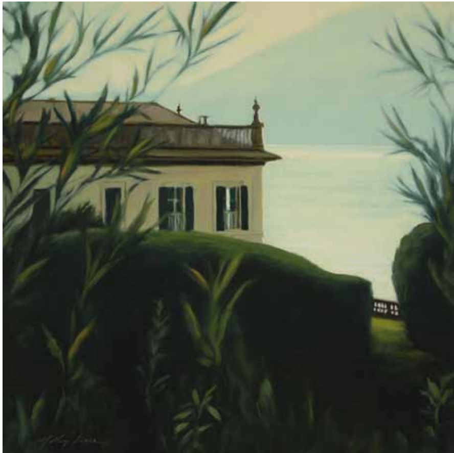
Summer Afternoon, Lake Como | 20 x 20" | LK732