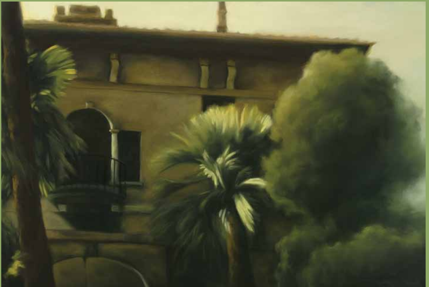
Villa Cipressi | 20 x 30" | LK673

ALTHOUGH MALLORY LAKE LIVED IN VERMONT, THE ROLLING hills, tall cypress trees, stuccoed buildings and incomparable light of Tuscany were her inspiration. The artist took frequent sojourns to Europe and then returned to her studio, with photographs in hand, to bring her handsome and luxuriously textured pastels to life. Each piece captures the dimension and shadow, the spirit and mood of its place. Her work has been the subject of various articles and exhibitions and is included in several New England and Canadian collections. Mallory Lake passed away in the summer of 2017.