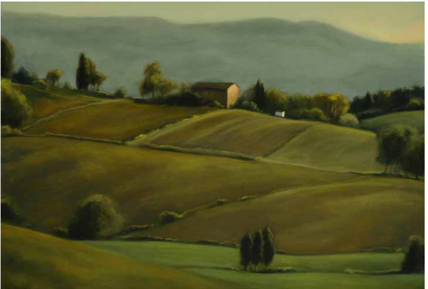
Aliano, Tuscany | 20 x 30" | LK738