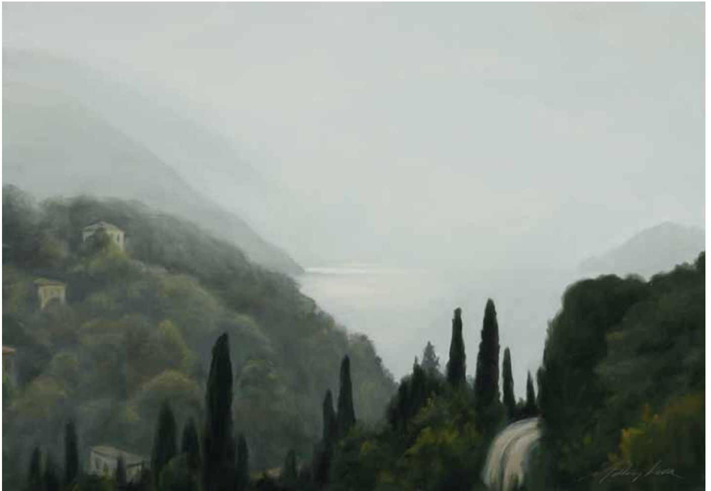
Lake Como in the Mist | 16 x 24.5" | LK762