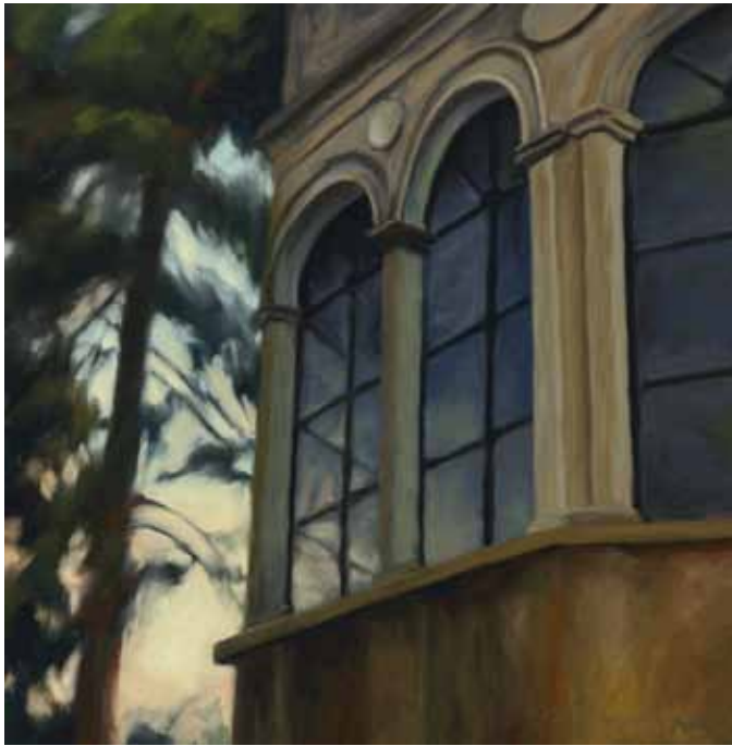
Appignano | 12 x 12" | LK745