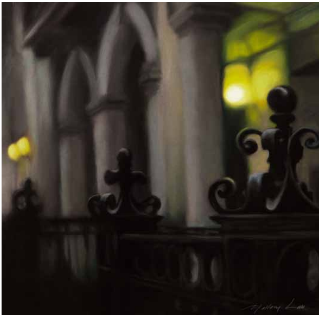
Finials | 18 x 18" | LK709