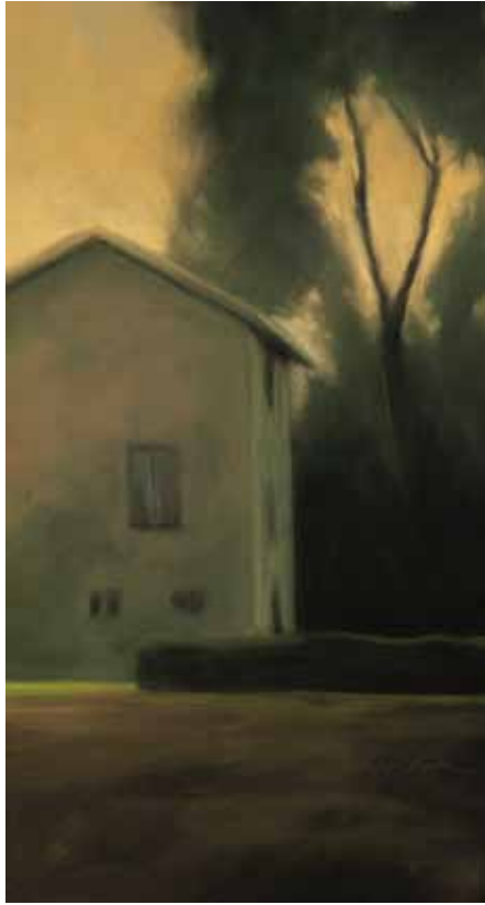
Maranello | 14 x 8" | LK776