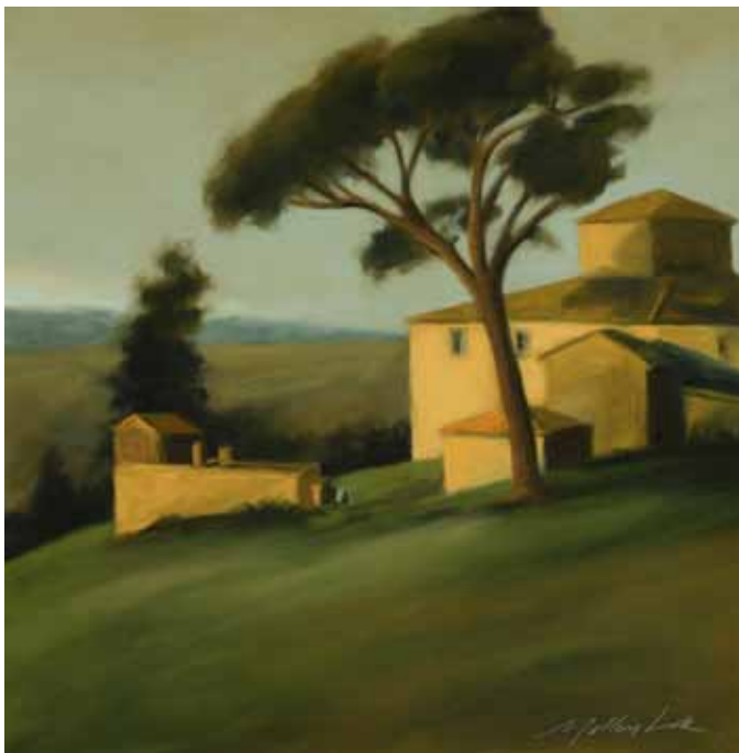
Impruneta | 12 x 12" | LK735