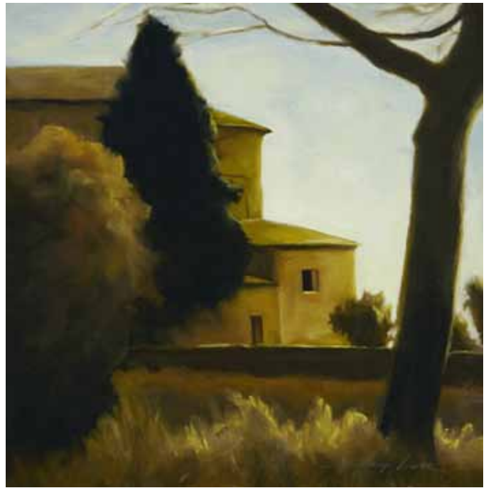
Moresco | 12 x 12" | LK748