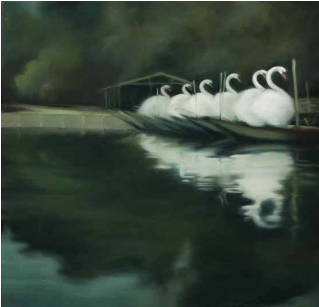
Early Morning, Boston Public Garden | 22 x 22" | LK685