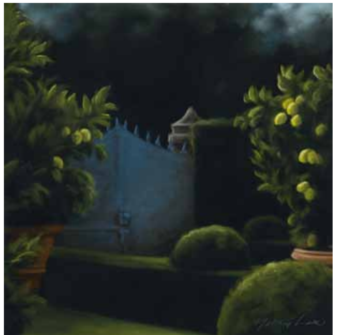
Morning Light, Villa Cetinale | 12 x 12" | LK750