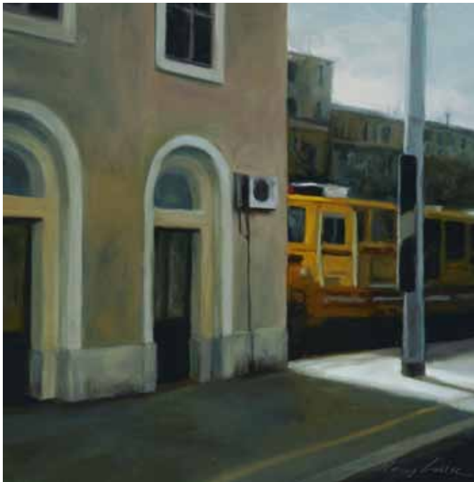
Stazione di Orvieto | 12 x 12" | LK749