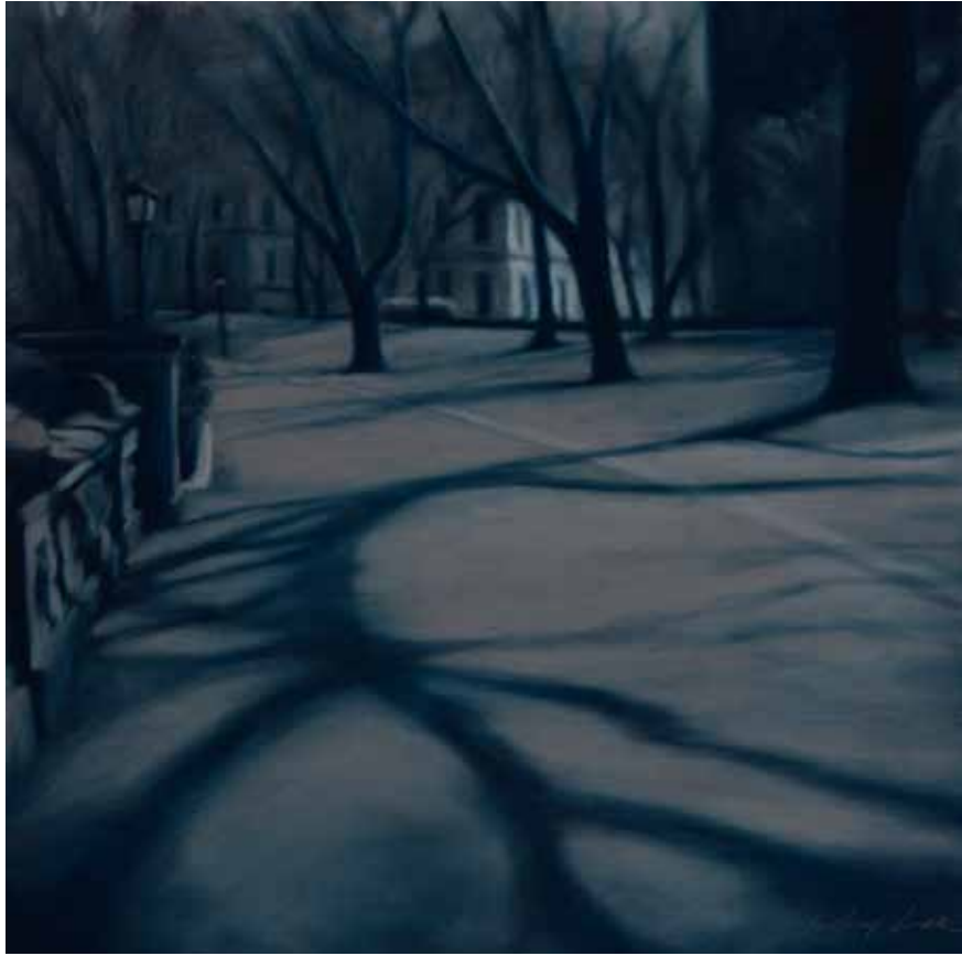
Boston | 18 x 18" | LK767