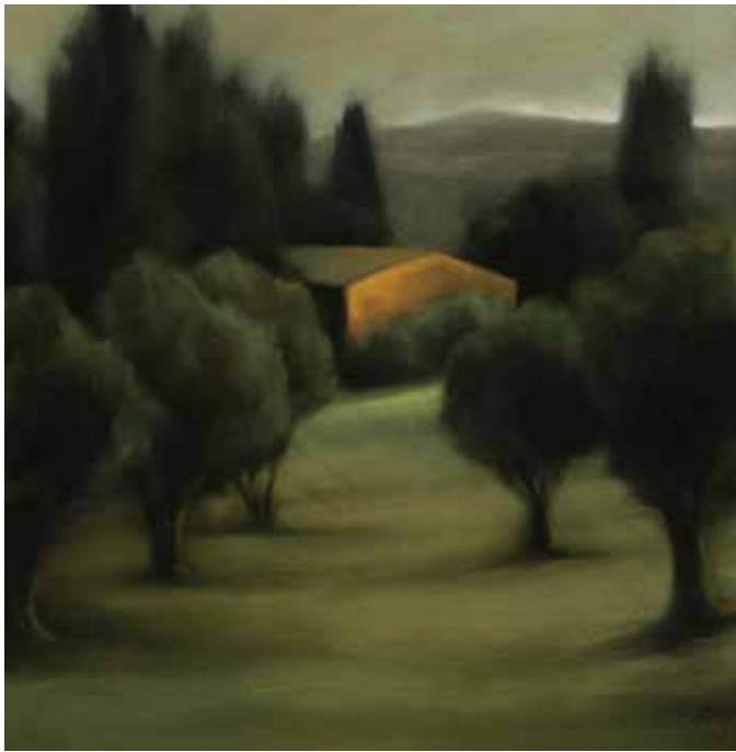
San Michele, Tuscany | 12 x 12" | LK773