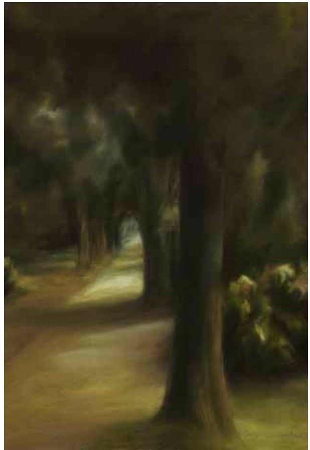
Woodland Path, Villa Cypress | 14 x 10" | LK772