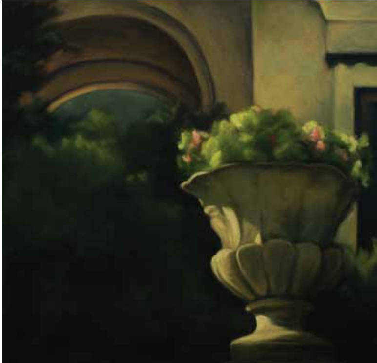
Menaggio | 14 x 14" | LK695