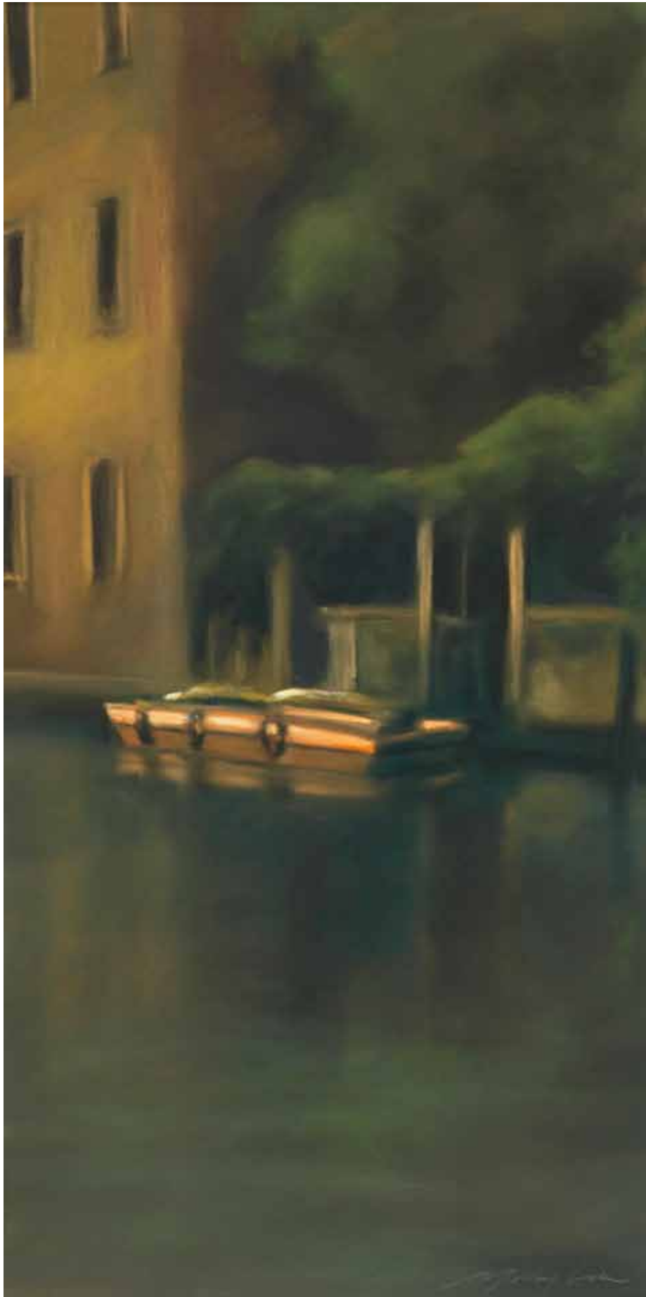
La Barca | 28 x 14" | LK651