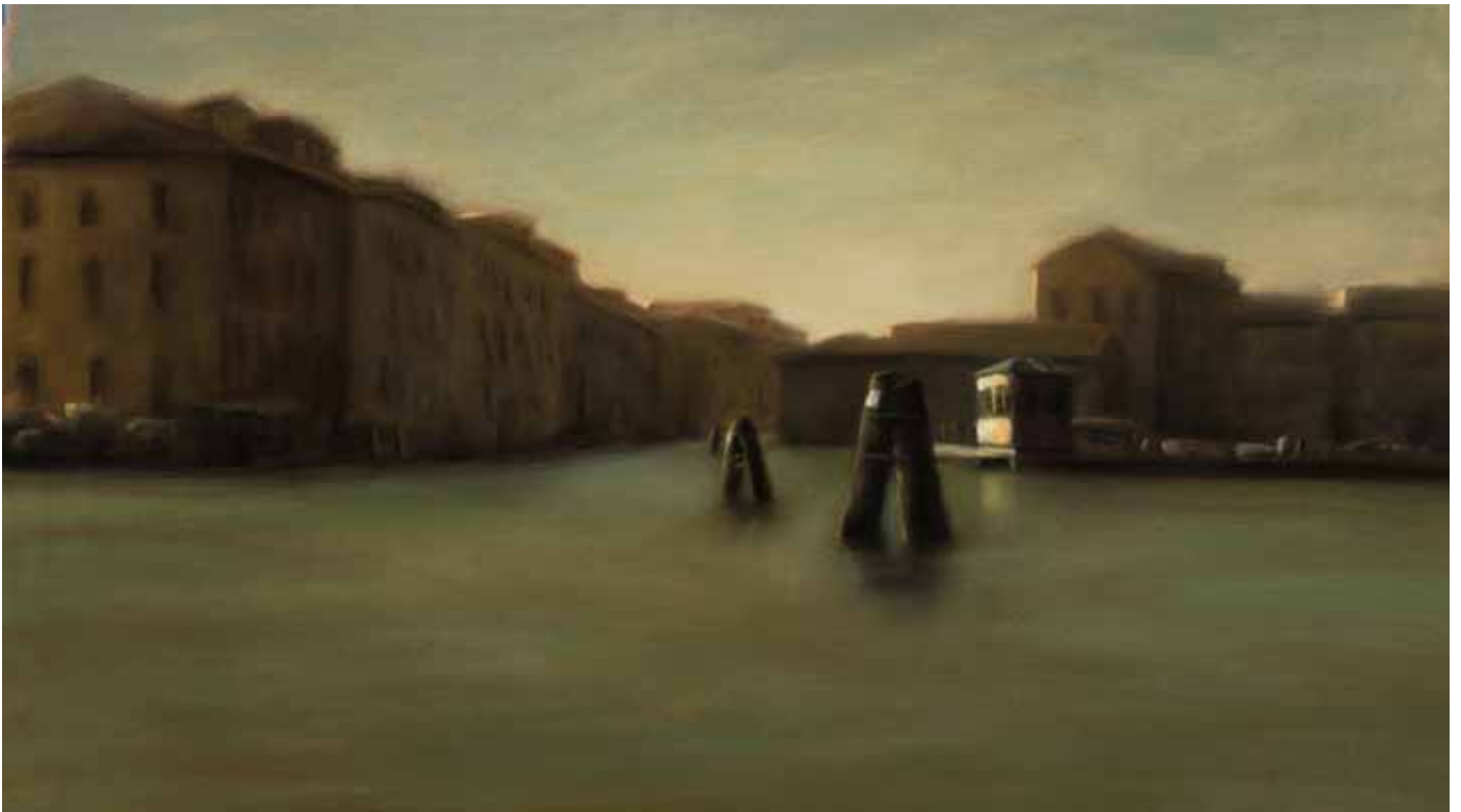
Canale delle Navi | 15 x 26" | LK769