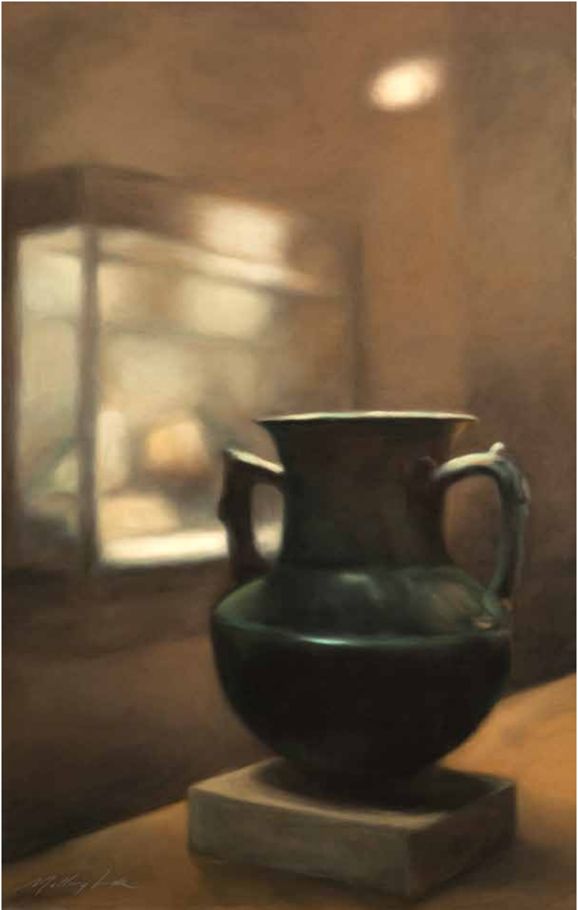
The Museum | 24.5 x 15.5" | LK702