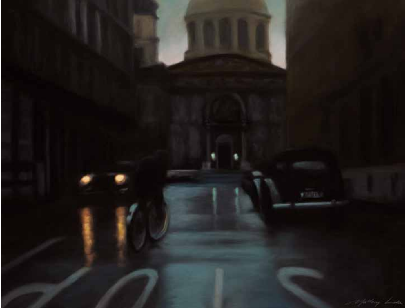
Le Cycliste | 20 x 26" | LK713