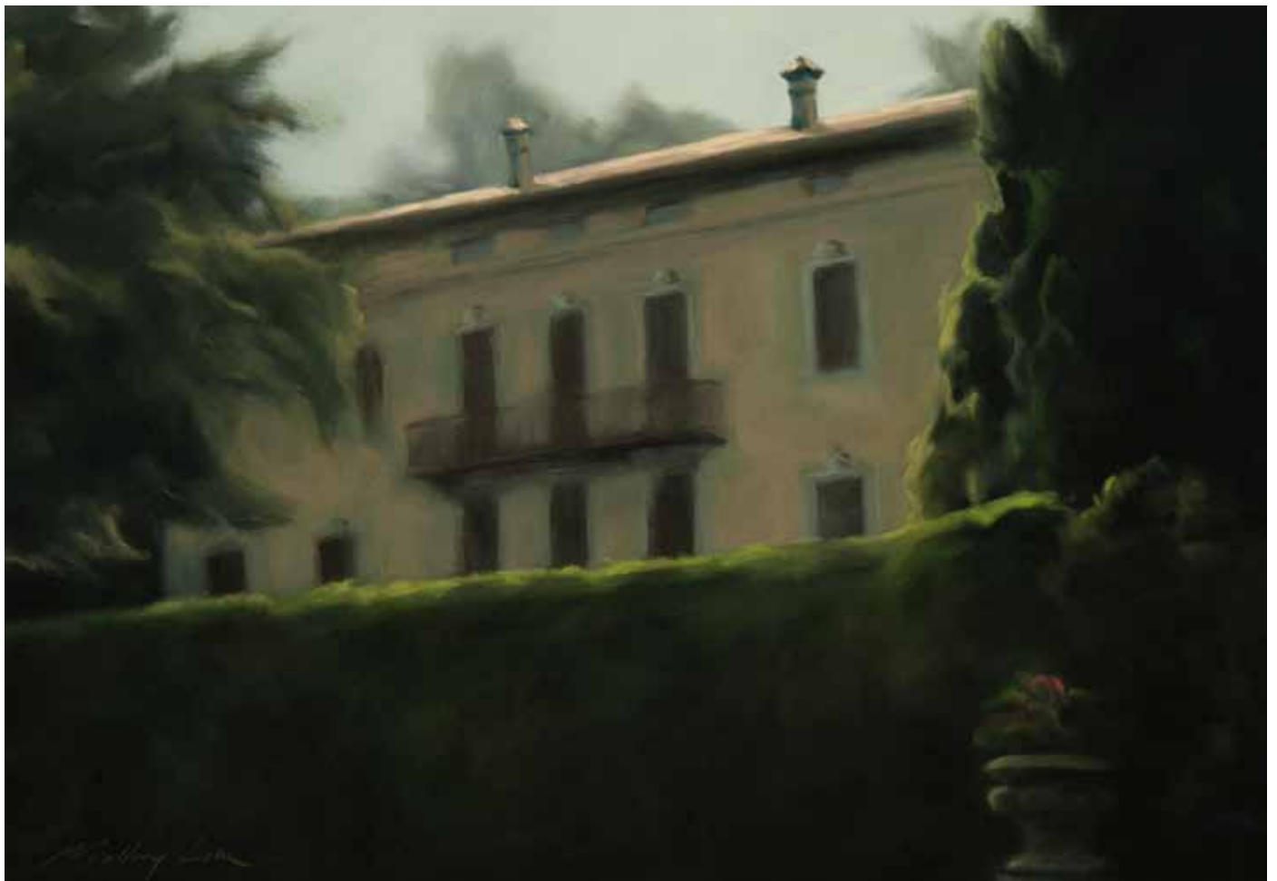
Appignano | 14 x 20" | LK766