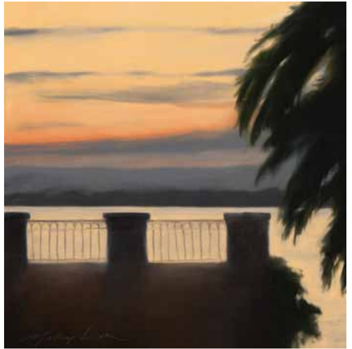
Syracuse Sunset | 12 x 12" | LK774