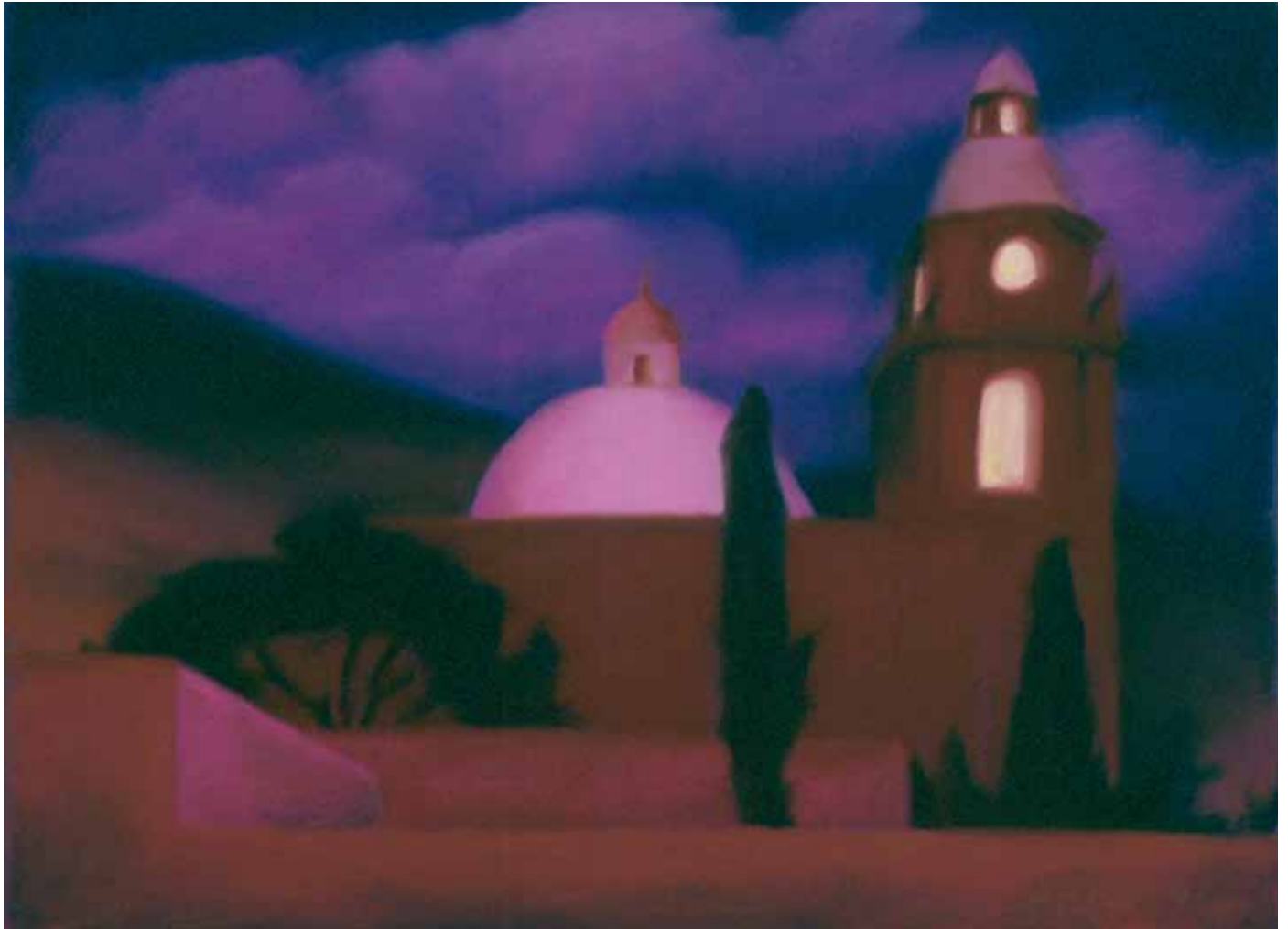
Real de Cantorce | 19,5 x 25,5" | LK73