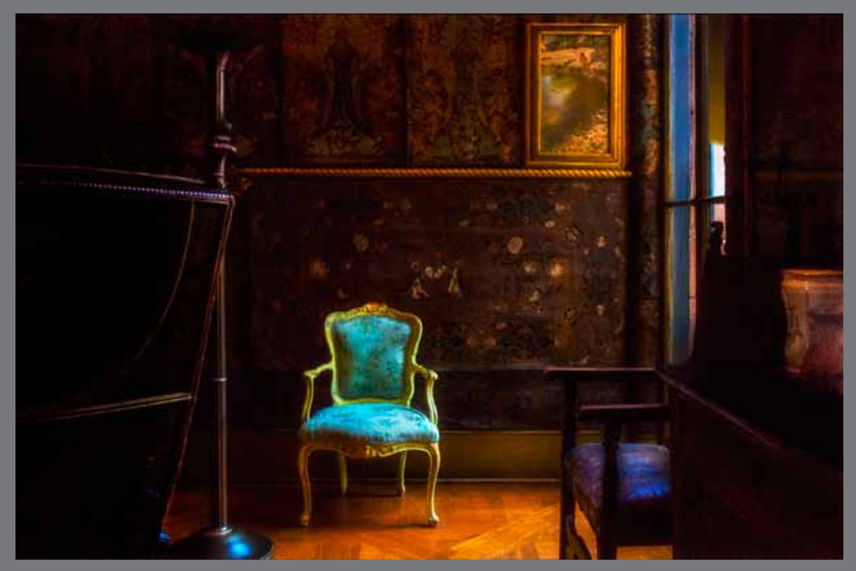
BLUE CHAIR 15.75 x 23.75" FF96