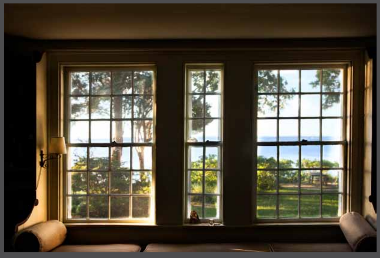
SUMMER AFTERNOON 14.75 x 22" FF94