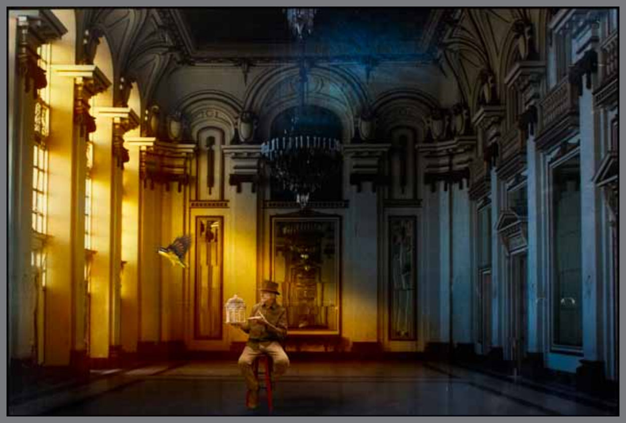
THE MAGICIAN IN THE PALACE 15 x 22" FF104