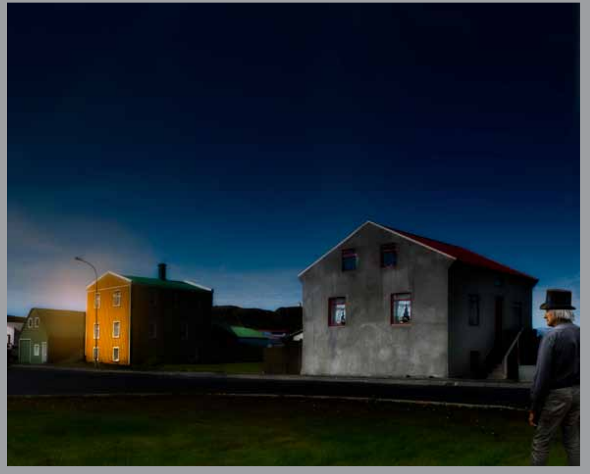
THREE HOUSES 17.5 x 21.75" FF91