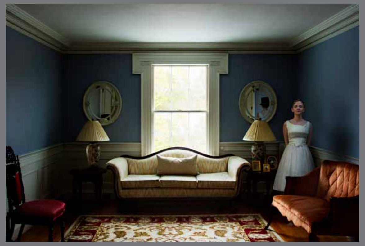
GIRL IN BLUE ROOM 15 x 22" FF109