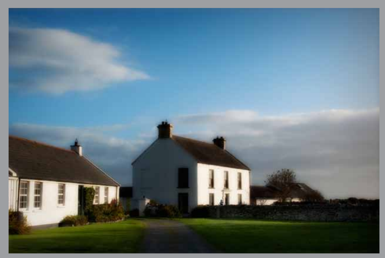
HOPPER IN KEARNEY 14.5 x 22" FF89