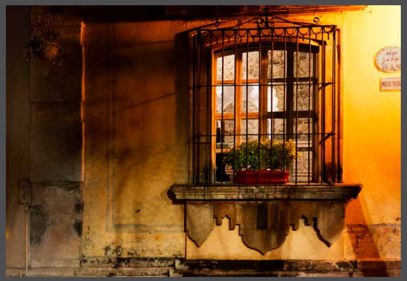
A WINDOW AT NIGHT 15 x 22" FF110