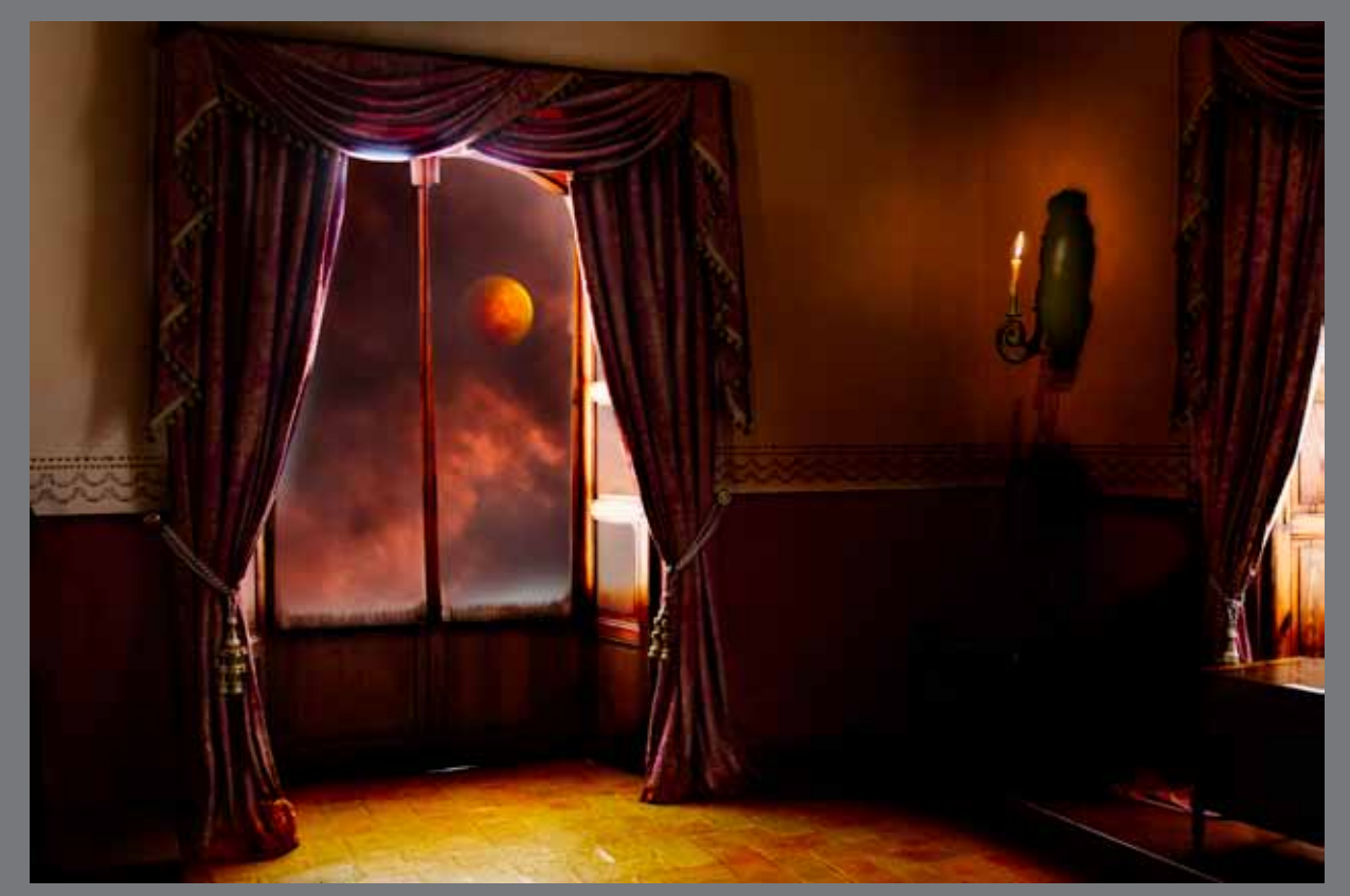
DOUBLE MOON #2 14.5 x 22" FF97