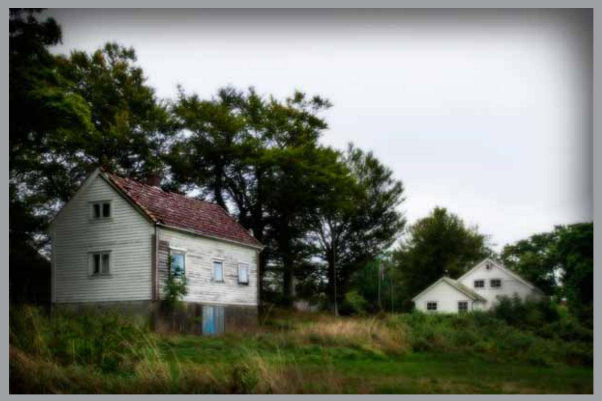
HALSNØY BARN 15 x 22" FF87