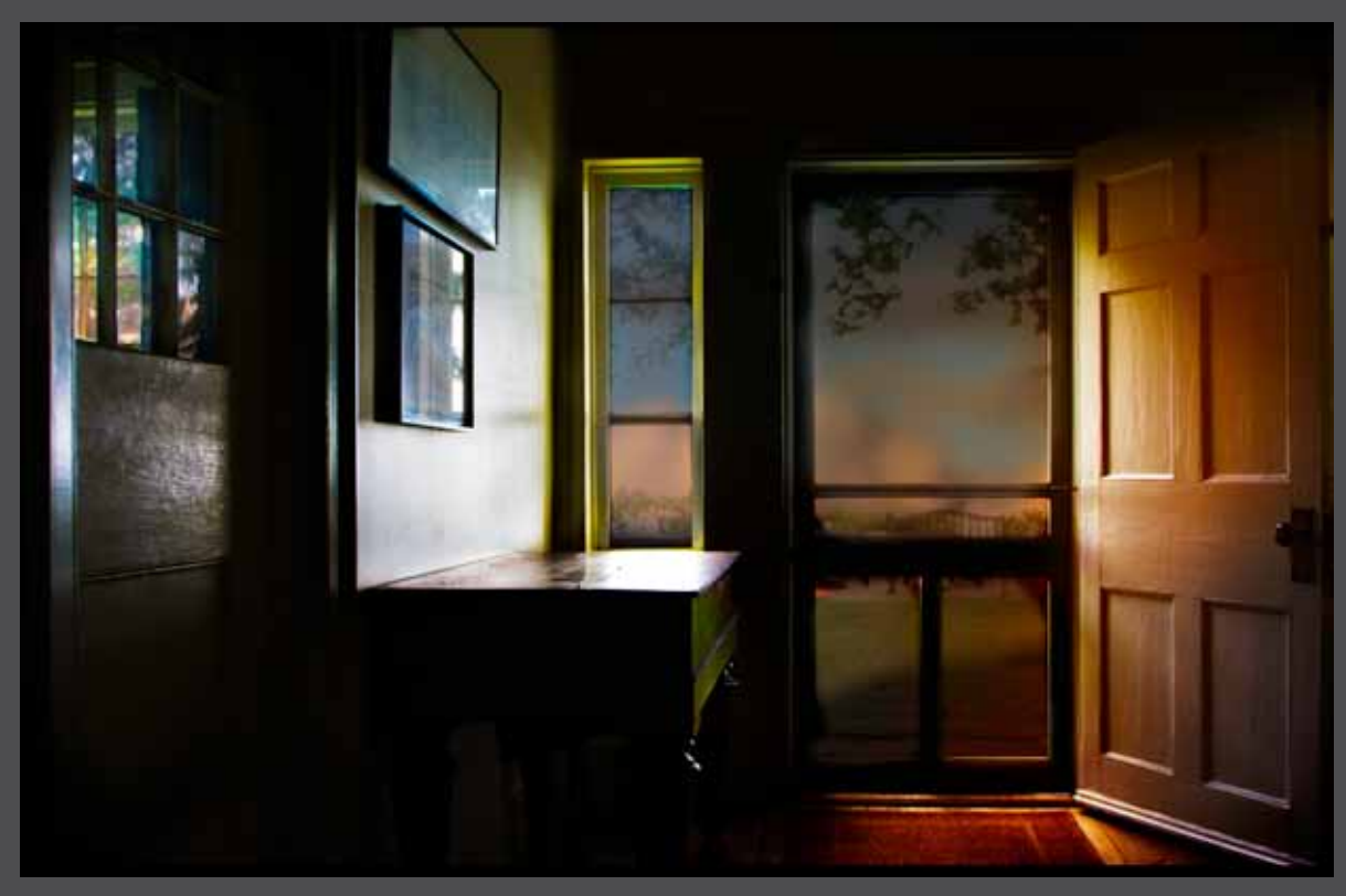
DOOR TO THE SEA 14.5 x 22" FF103