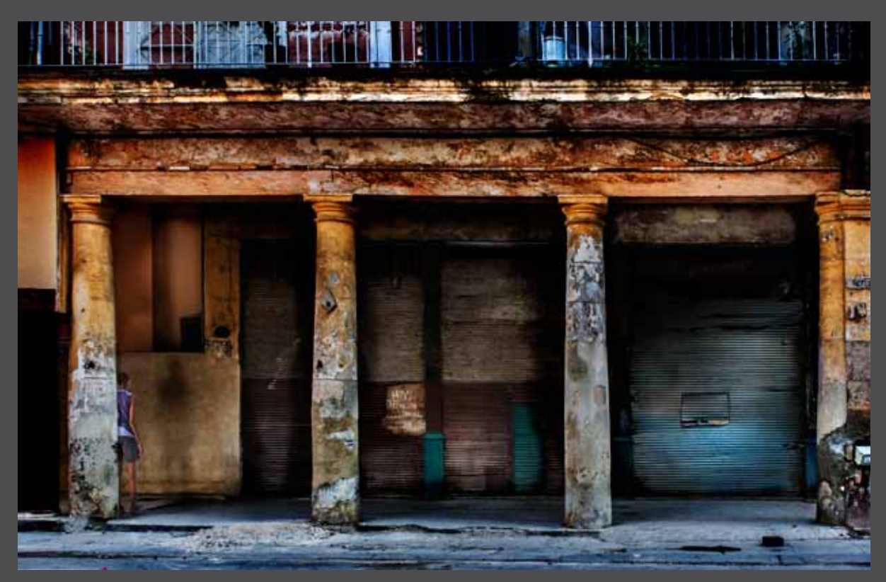
MALECON SHADOWS 15 x 22" FF86