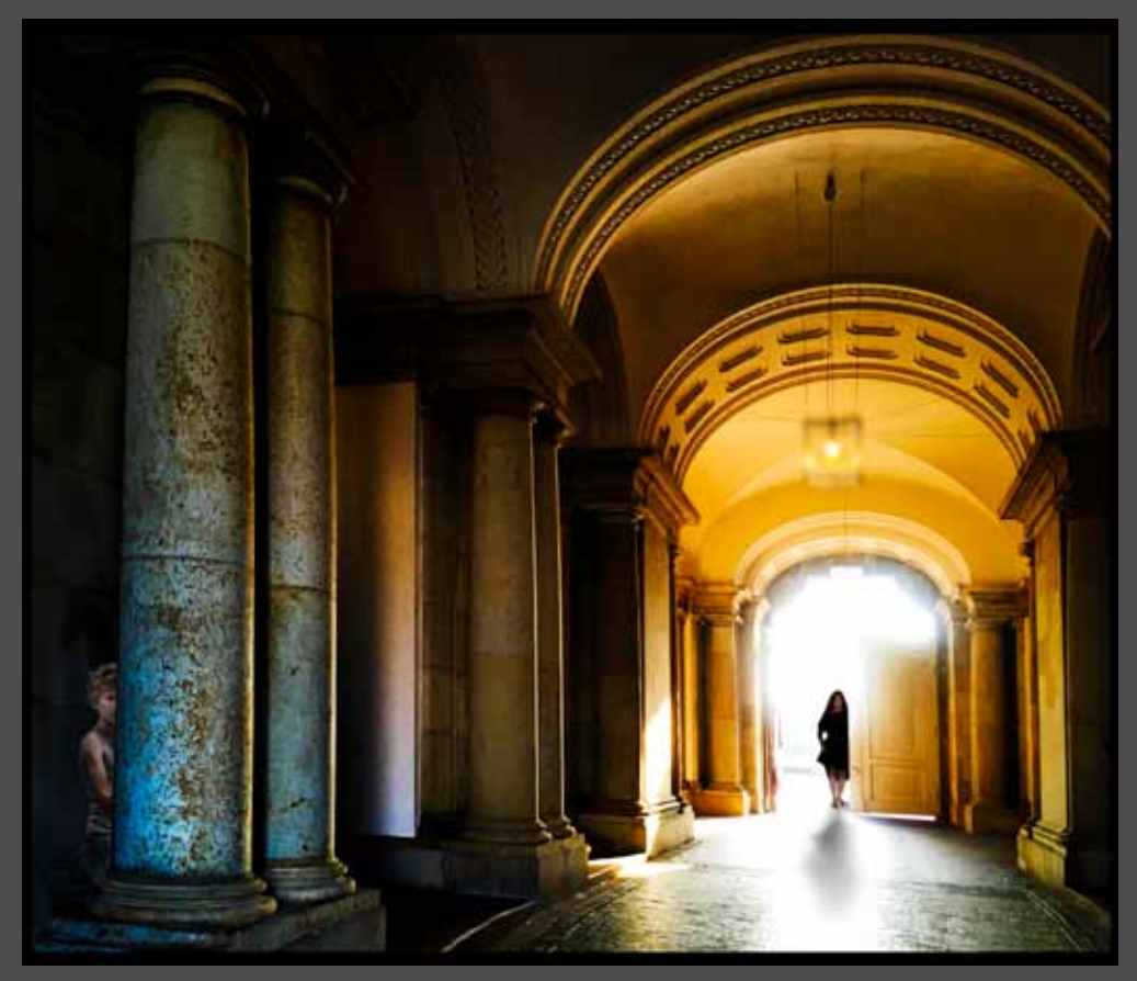
HIDDEN 22 x 18.75" FF108