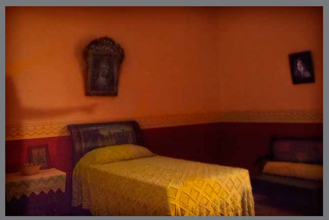
SAN MIGUEL SPECTRAL 14.5 x 22" FF106