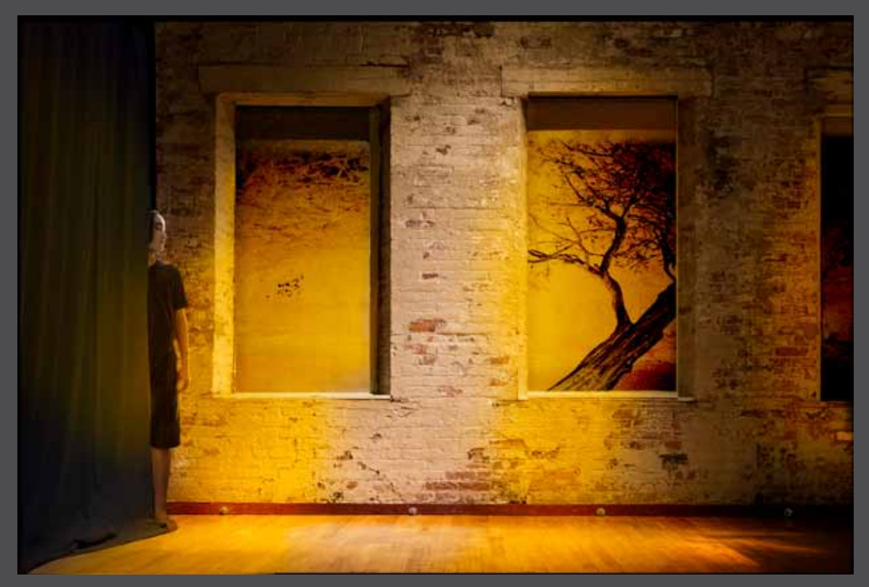
BEHIND THE CURTAIN 15 x 22" FF98