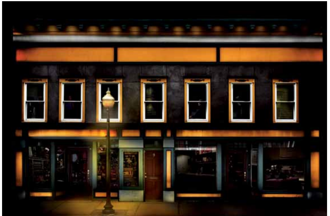
DOOR #9, 2019 Archival pigment print 17 x 25" FF113

ONLINE EVENTS: Please visit www.puckergallery.com for a list of virtual gatherings and events accompanying Self-Illumination .