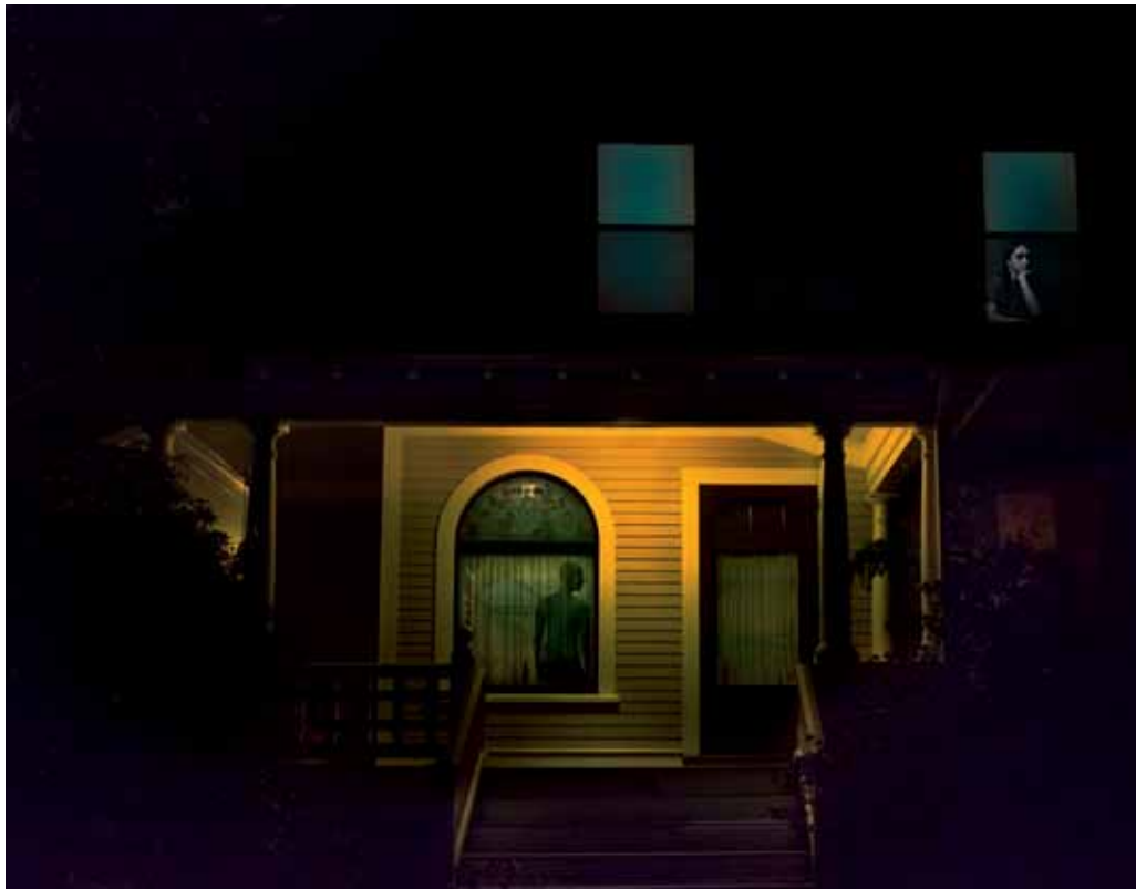
NIGHT IN THE TIME OF CORONA, 2020 Archival pigment print 16 x 20" FF116