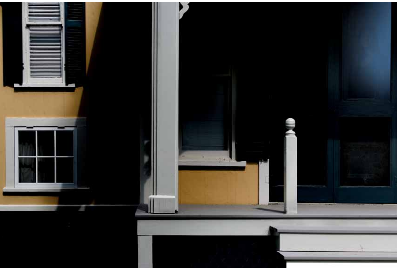
YELLOW HOUSE, 2019 Archival pigment print 17 x 25" FF125