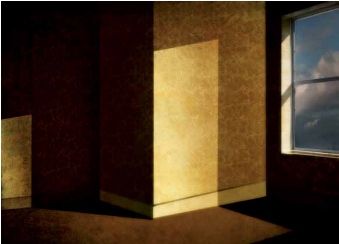
SUNLIGHT, AFTER HOPPER, 2019 Archival pigment print 15 x 21" FF119