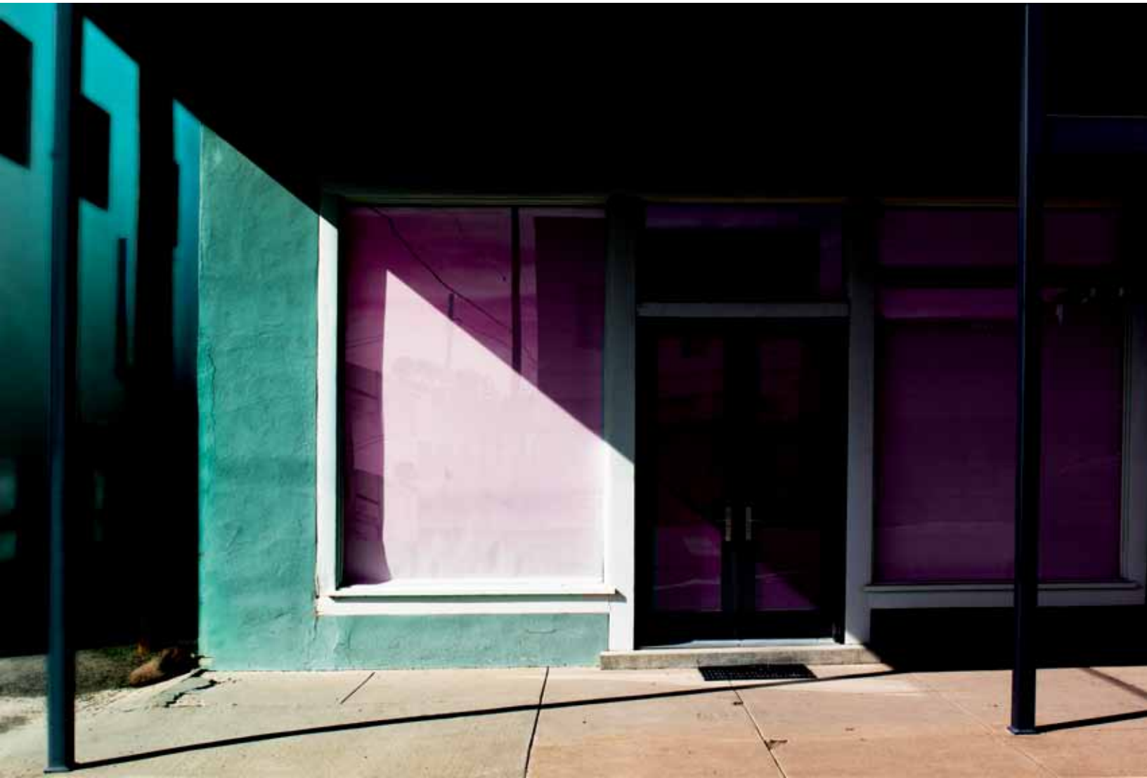
STUDY IN AQUA AND PINK, 2019 Archival pigment print 17 x 25" FF118