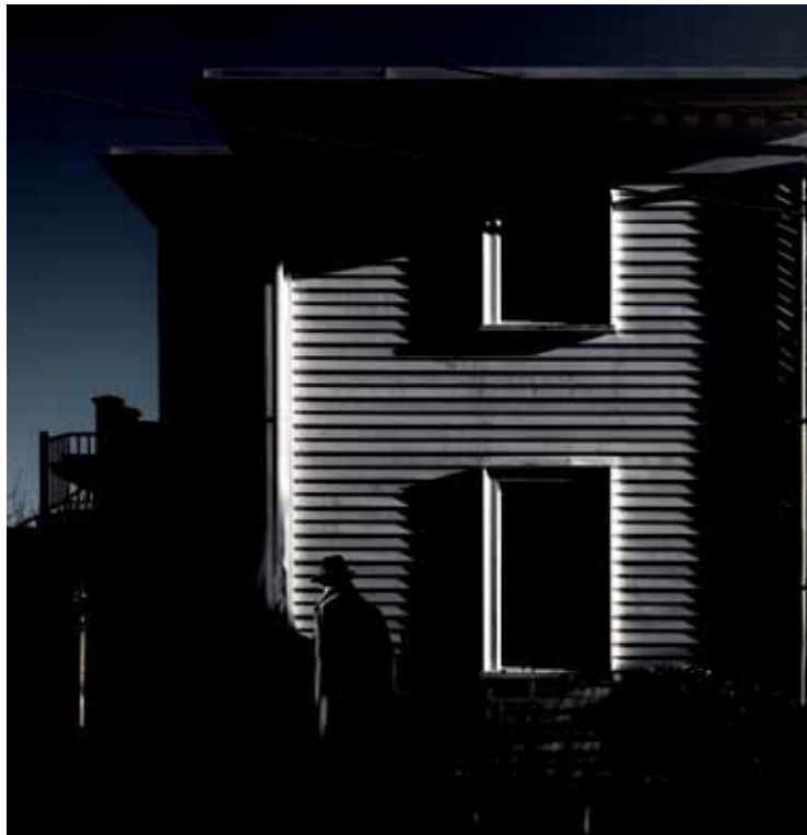
WELLFLEET SHADOWS, 2019 Archival pigment print 15 x 14" FF123