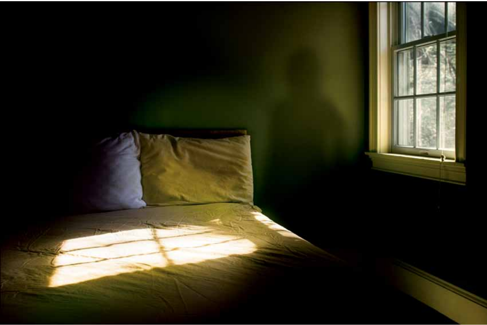
WELLFLEET SPECTRAL, 2018 Archival pigment print 16 x 25" FF124