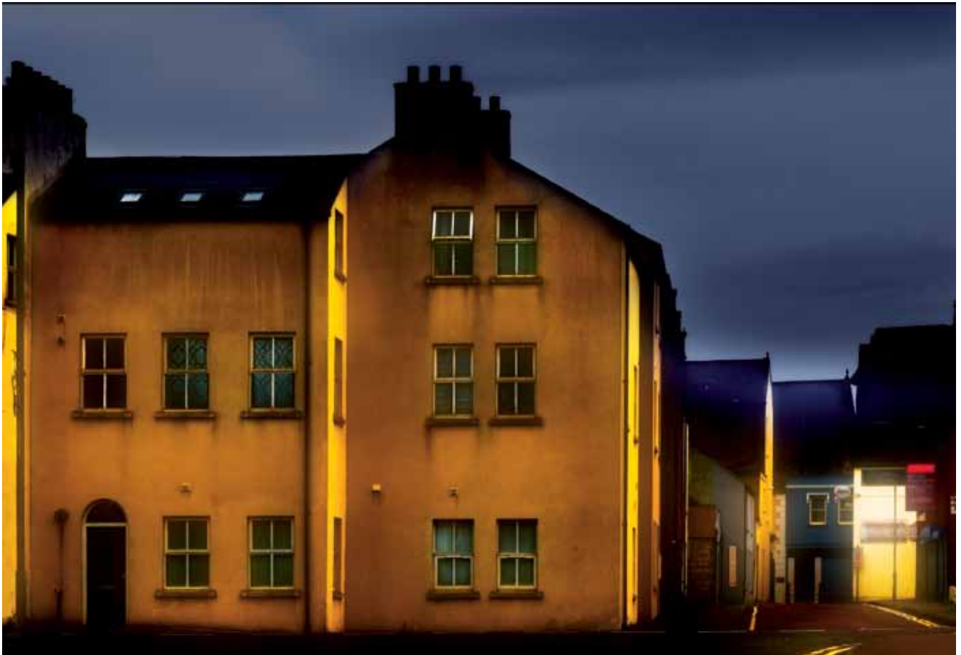
ANTRIM, 2019 Archival pigment print 15 x 22" FF112