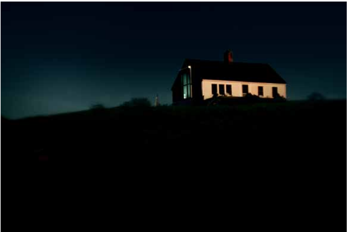
LEAVING TRURO, 2019 Archival pigment print 14 x 21" FF115