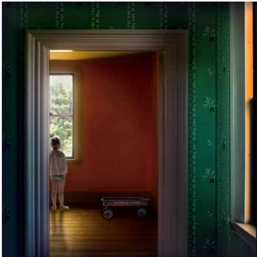
RADIO FLYER, 2020 Archival pigment print 20 x 20" FF117