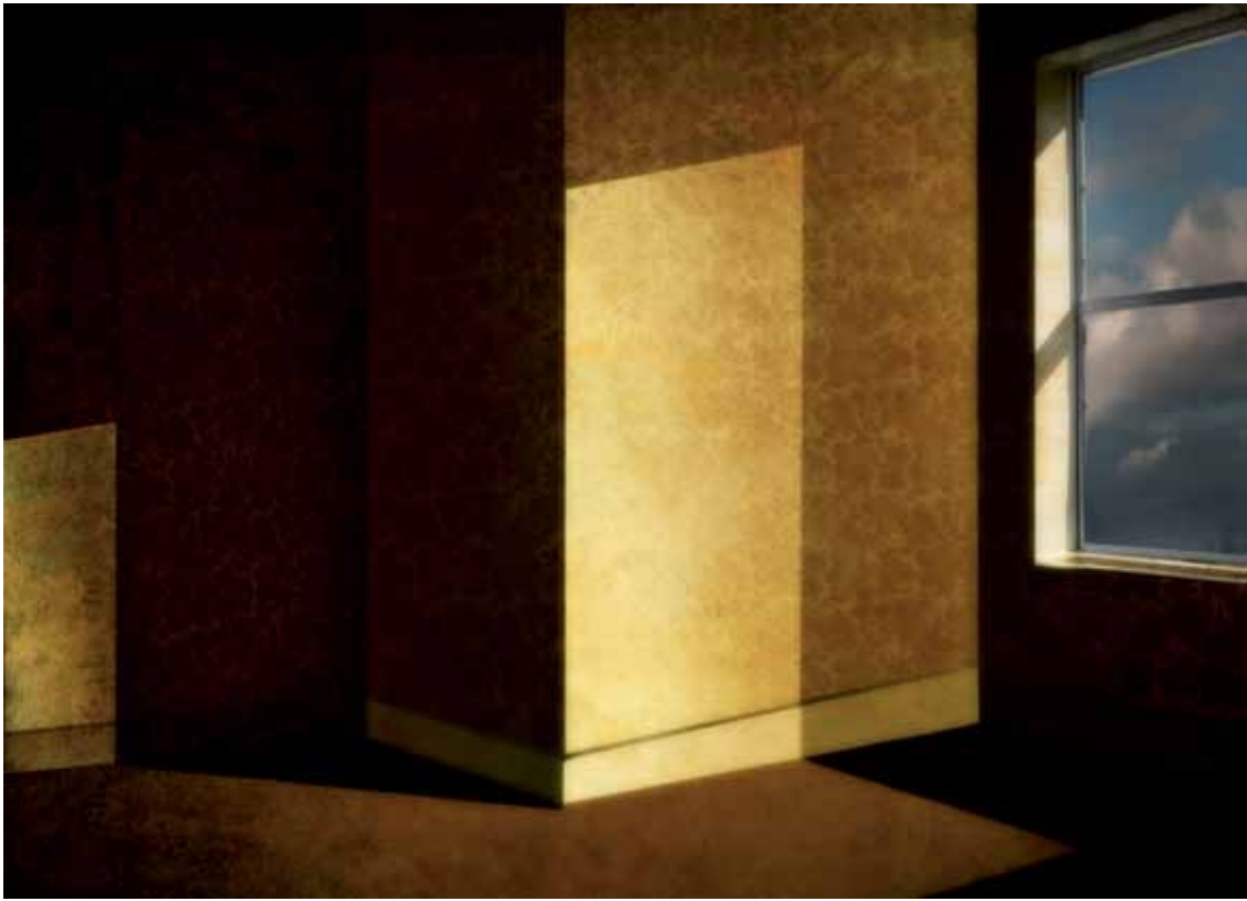
SUNLIGHT, AFTER HOPPER, 2019 Archival pigment print 15 x 21" FF119