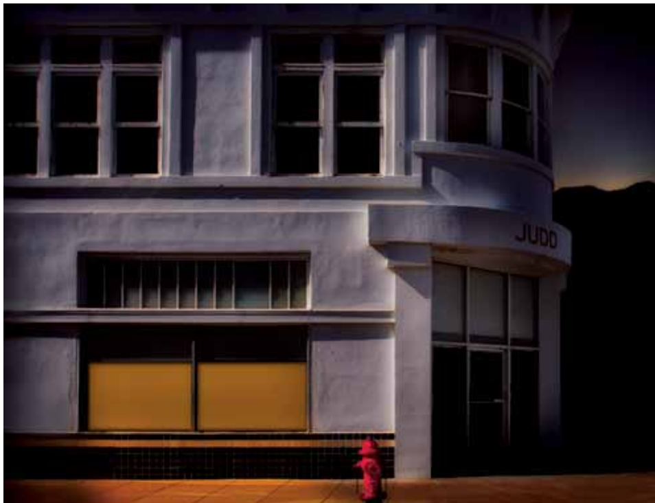
JUDD, 2019 Archival pigment print 16 x 21" FF114