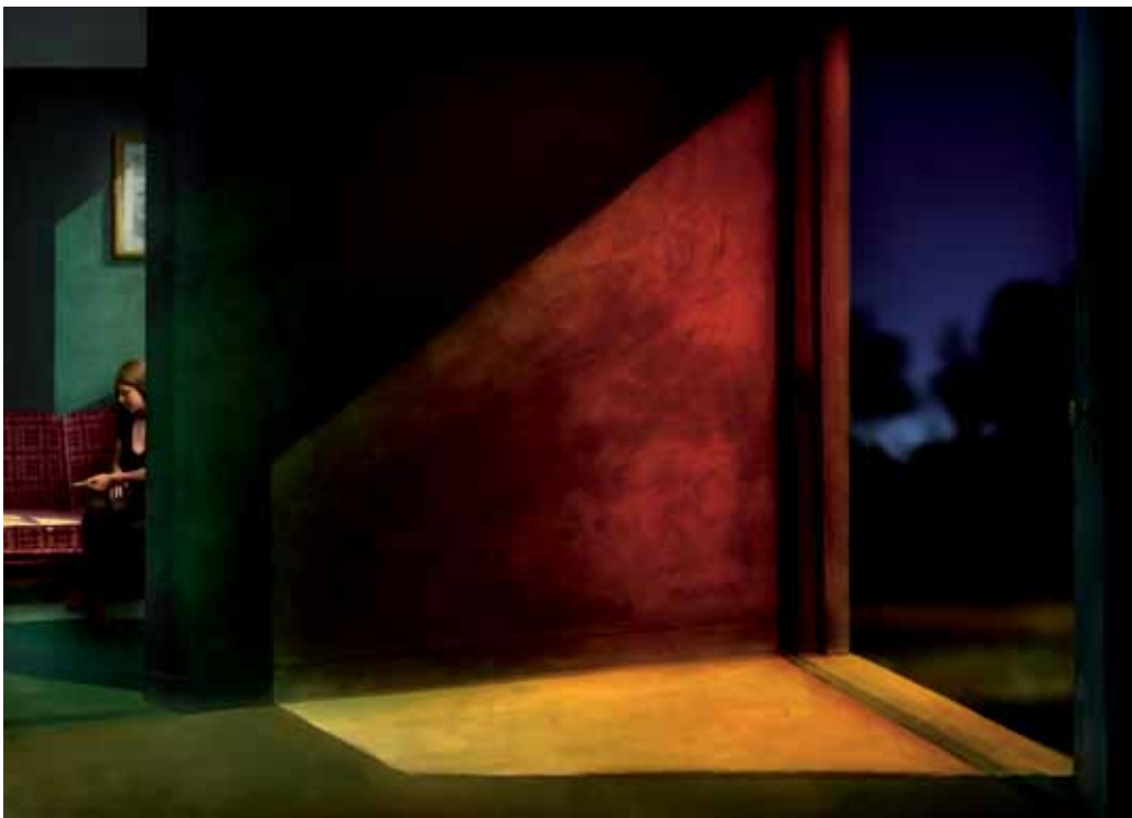
THE WORLD OUTSIDE, AFTER HOPPER, 2019 Archival pigment print 15 x 20.75" FF122