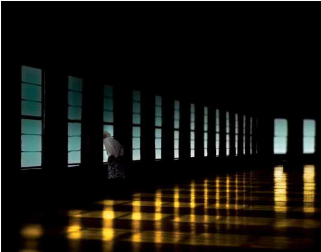
SURVEILLANCE, 2018 Archival pigment print 15 x 21" FF120