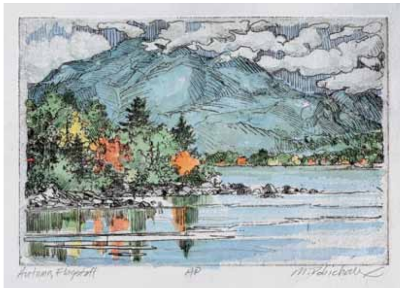
Autumn, Flagstaff Hand-colored etching 6.5 x 9" MR366