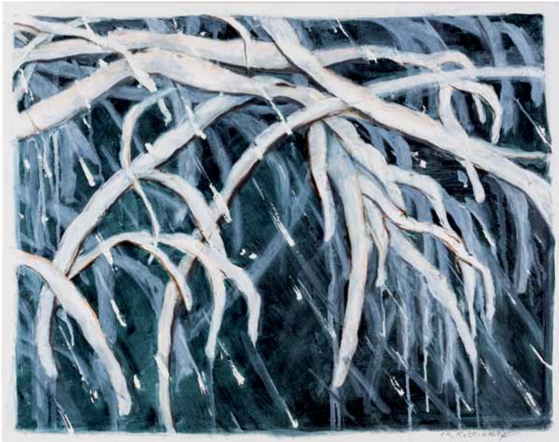
Night Storm Oil on canvas 16 x 20" MR351