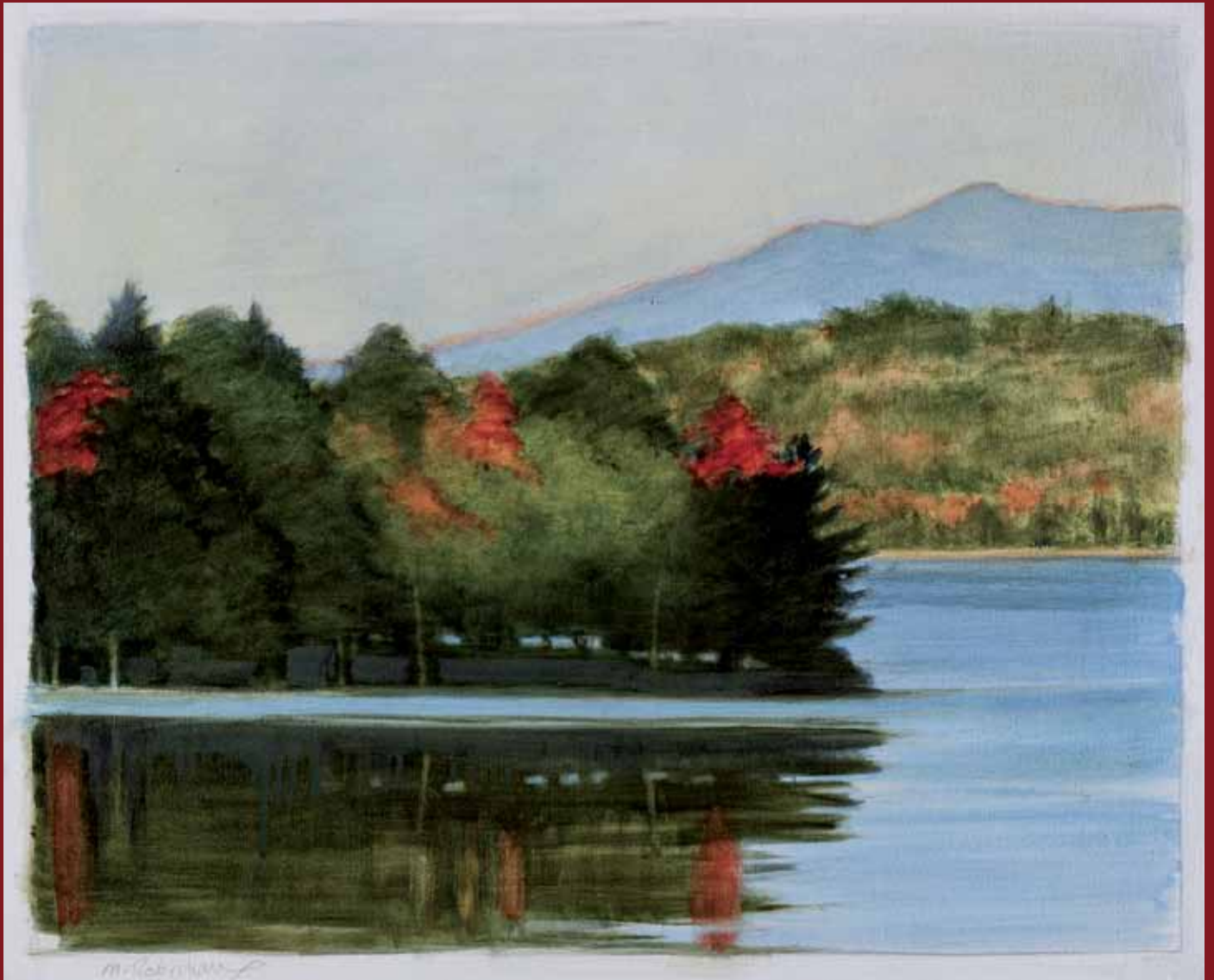
September Lake Oil on canvas 20 x 24" MR356