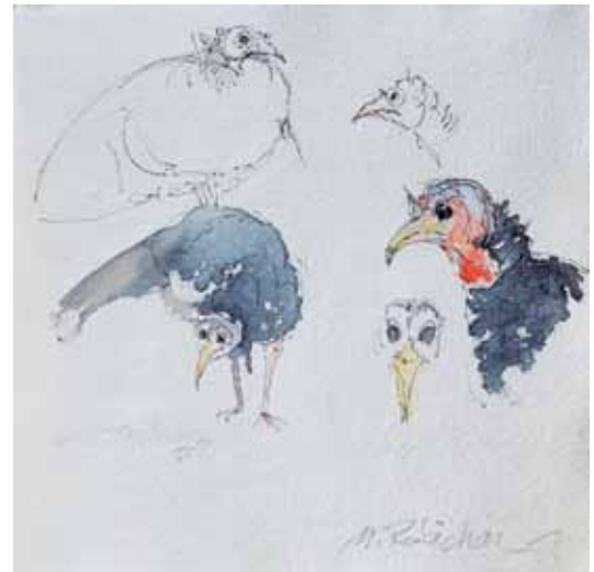
Wild Turkeys Ink and watercolor 6 x 6" MR362