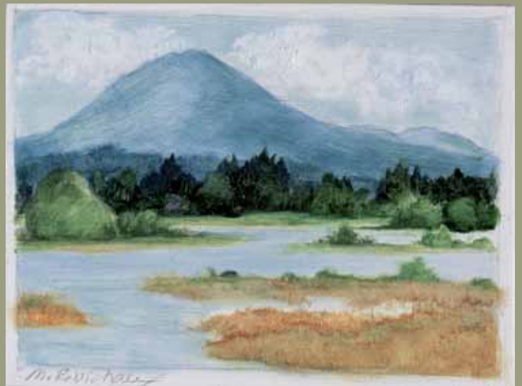
Black Nubble Oil and graphite on birch panel 6 x 8" MR344