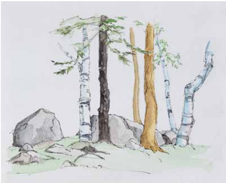
Along the Carrabassett Ink and watercolor 8 x 10.5" MR364