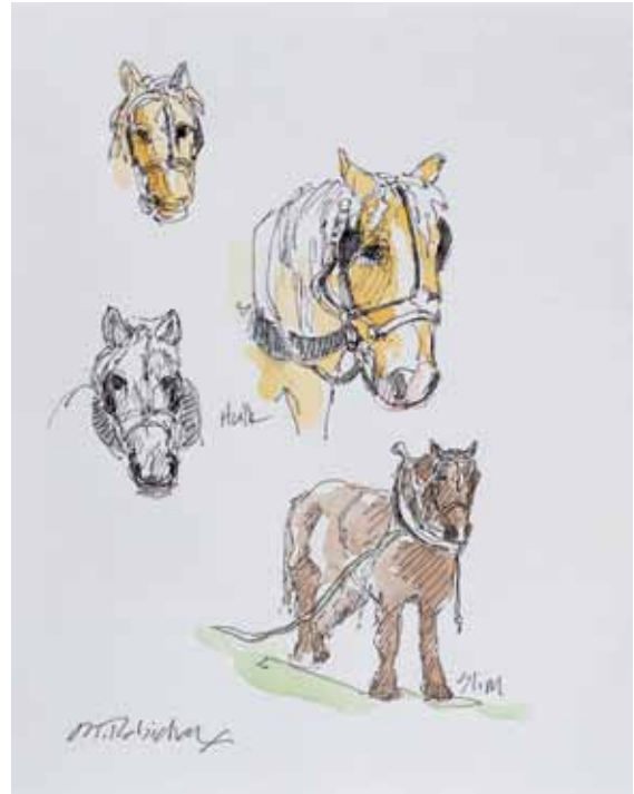
Hulk and Slim Ink and watercolor 10 x 7" MR365