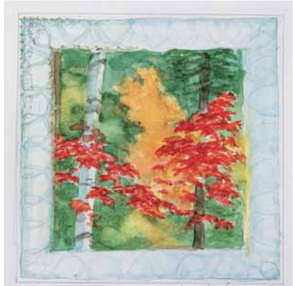
Study, Autumn Leaves Watercolor 6.5 x 6.5" MR361