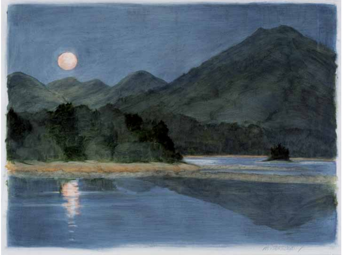
Moonrise Oil on canvas 18 x 24" MR345