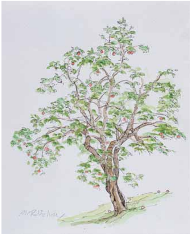
Walter's Apple Tree Ink and watercolor 10 x 8.5" MR363