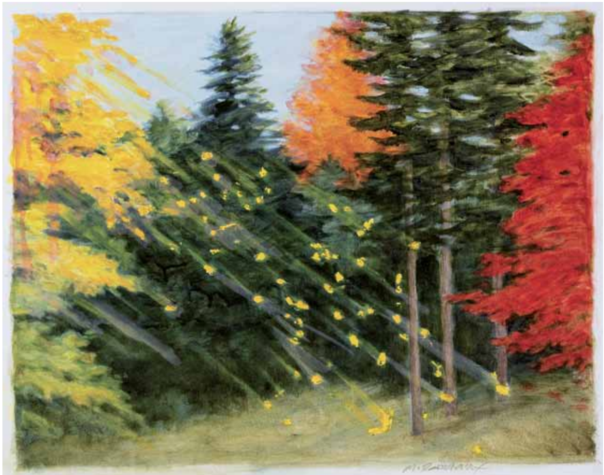
Autumn Wind Oil on canvas 16 x 20" MR350