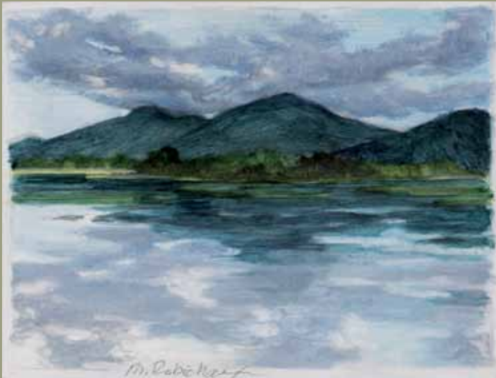
Bigelows Oil and graphite on birch panel 6 x 8" MR343

Please visit www.puckergallery.com for a list of virtual gatherings and events accompanying 'Round Home.