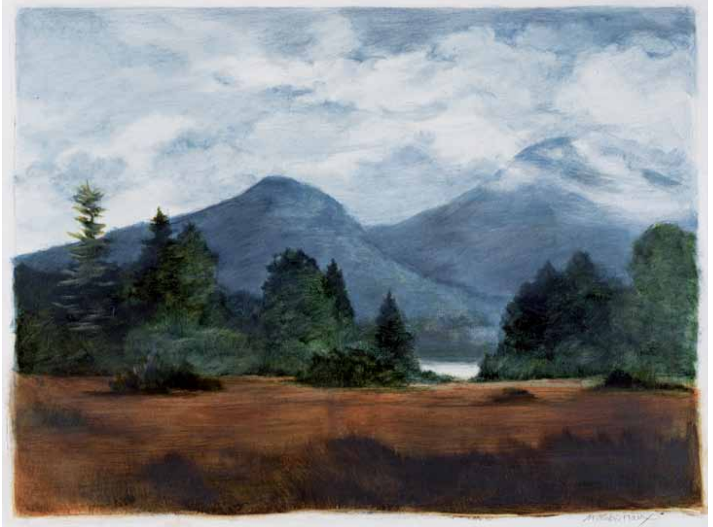
Darkening Day Oil on canvas 18 x 24" MR347