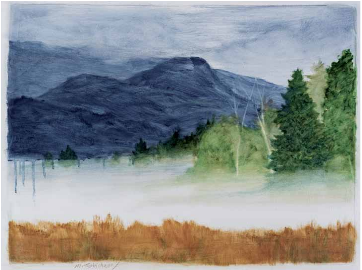
Ground Fog Oil on canvas 18 x 24" MR346