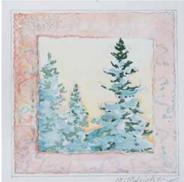
Study, Winter Snow Watercolor 6.5 x 6.5" MR360