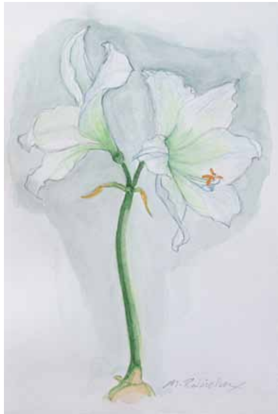
Amaryllis II Watercolor 11 x 7" MR358