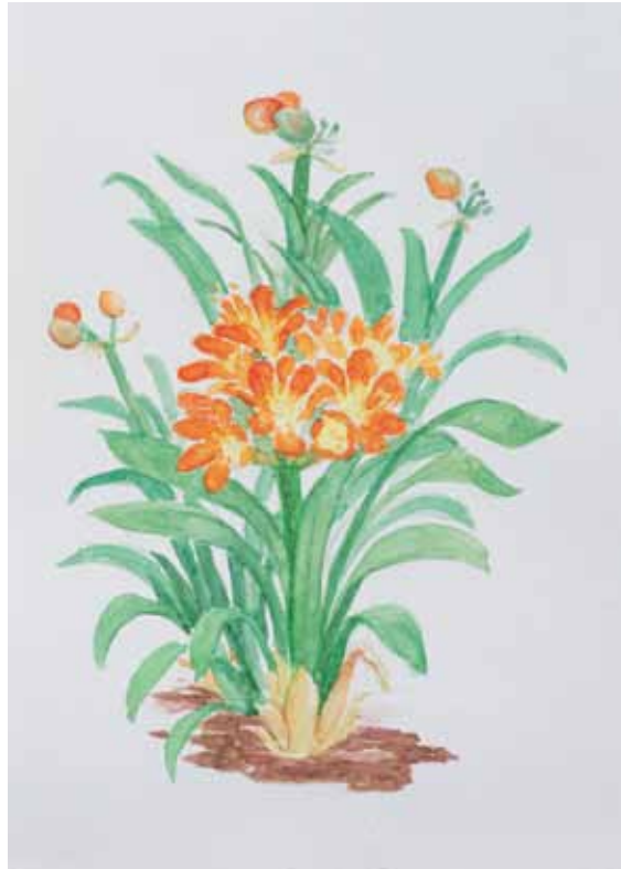
Clivia Watercolor 9 x 7" MR359