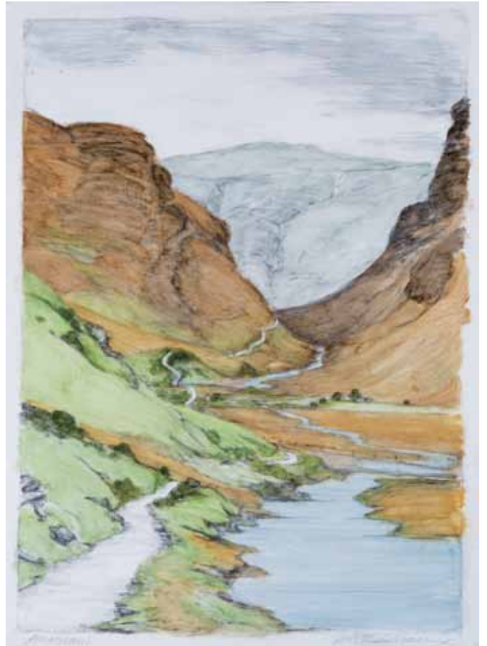
Anascaul Oil and graphite on birch panel 16 x 12" MR353