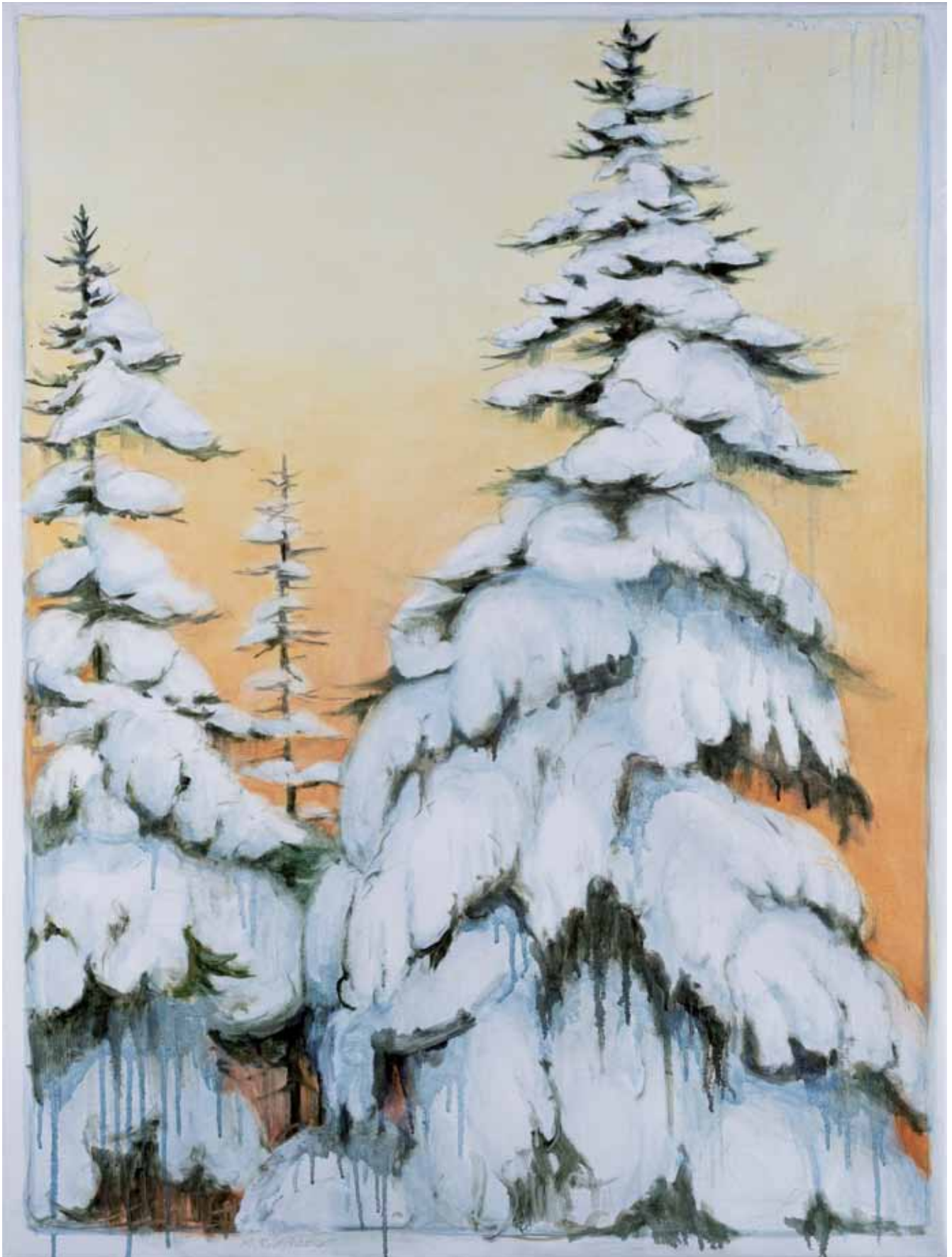
Winter Snow Oil and graphite on linen 40 x 30" MR354