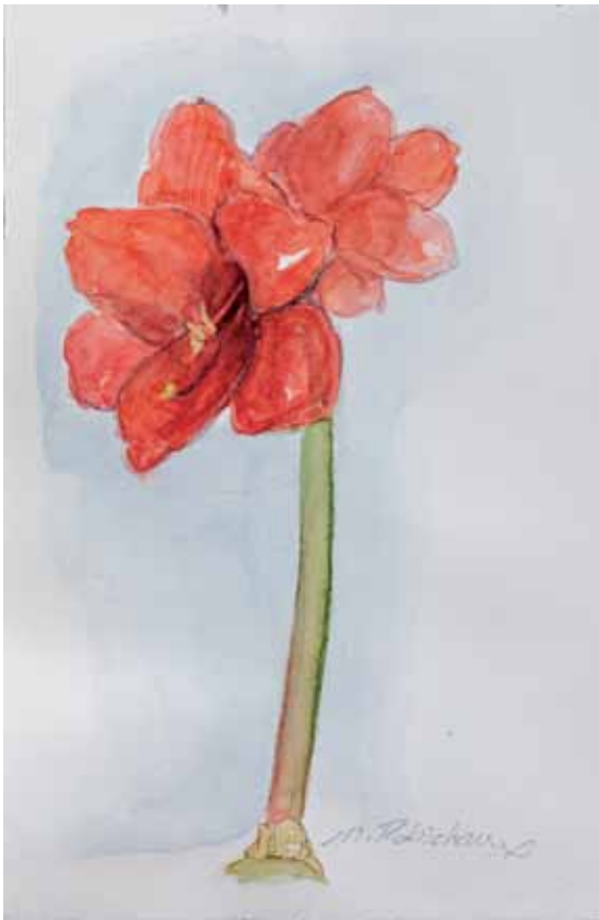
Amaryllis I Watercolor 11 x 7" MR357