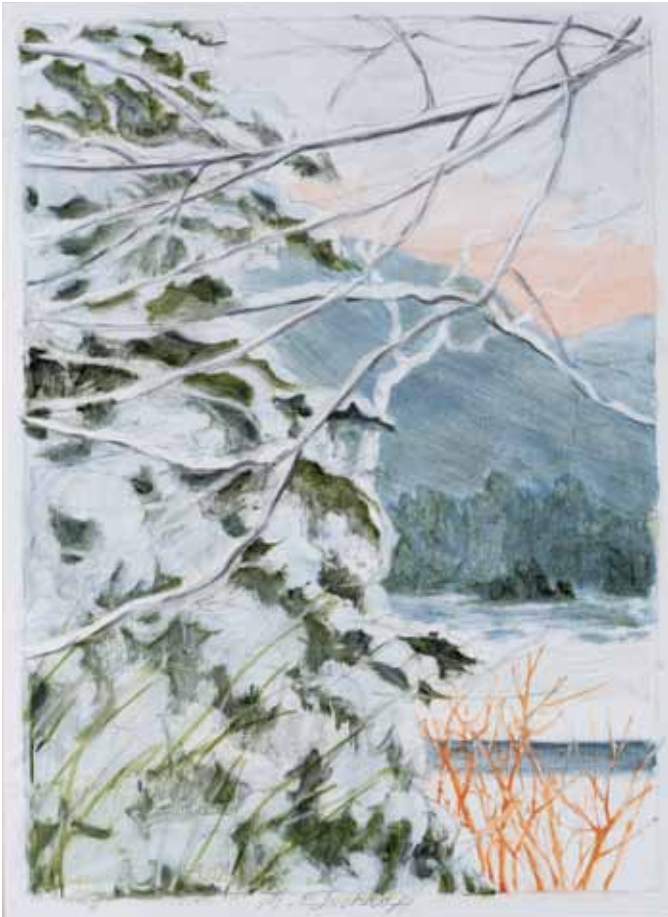
Winter Morning Oil and graphite on birch panel 16 x 12" MR352