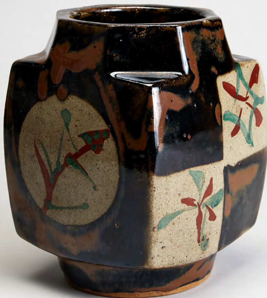
YO NO BI | THE BEAUTY OF USE SHOJI HAMADA (1894-1978)