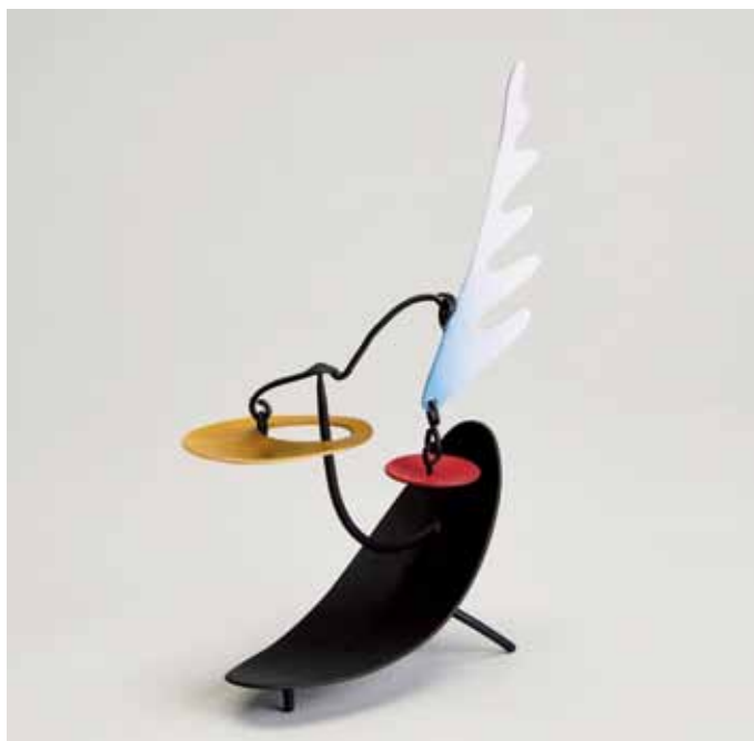
Odalisque Standing mobile in brass and aluminum with steel wires, oil and acrylic colors 7 x 4 x 4" MD868