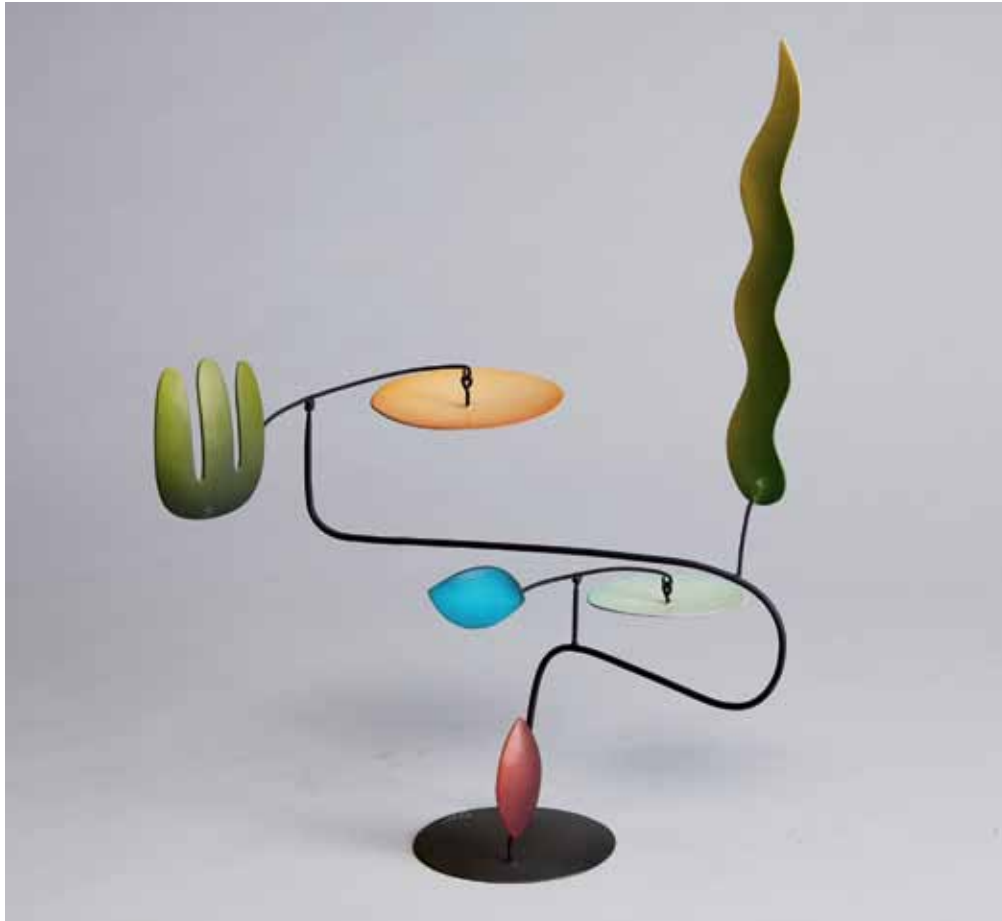
Navigating the Terrain

Standing mobile in brass and aluminum with steel wires, oil and acrylic colors 14 x 13 x 8" MD883