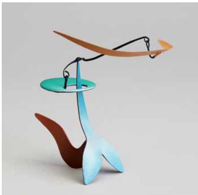
Happy Days Standing mobile in brass and steel, oil and acrylic colors 4.5 x 7 x 5" MD877