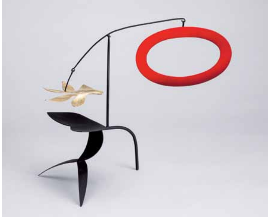
Aristocratic Standing mobile in brass and aluminum with steel wires, oil and acrylic colors, and 23 karat gold leaf 10 x 12 x 6" MD902