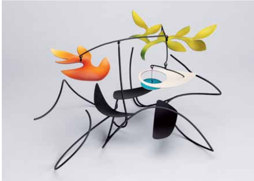
A Lengthy Conversation

Standing mobile in brass and aluminum with steel wires, oil and acrylic colors 7.5 x 12 x 11" MD904