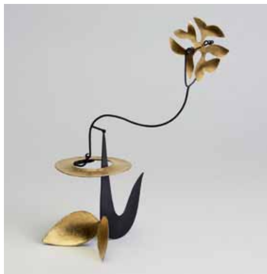
Flourishing Standing mobile in brass and aluminum with steel wires, oil paint and 23 karat gold leaf 11 x 9 x 3.5" MD875