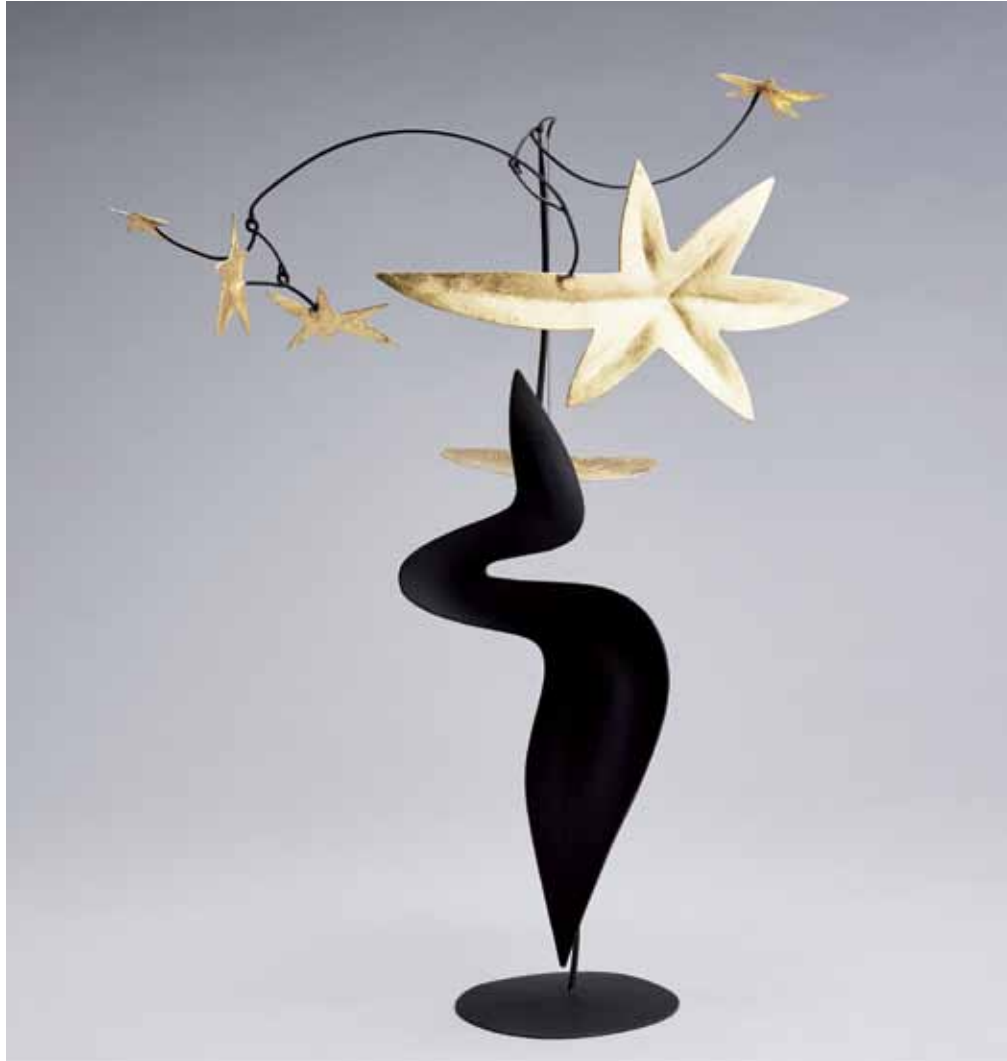
Shimmering From Above

Standing mobile in brass and aluminum with steel wires and nylon cord, oil color and 23 karat gold leaf 17 x 12 x 11" MD852