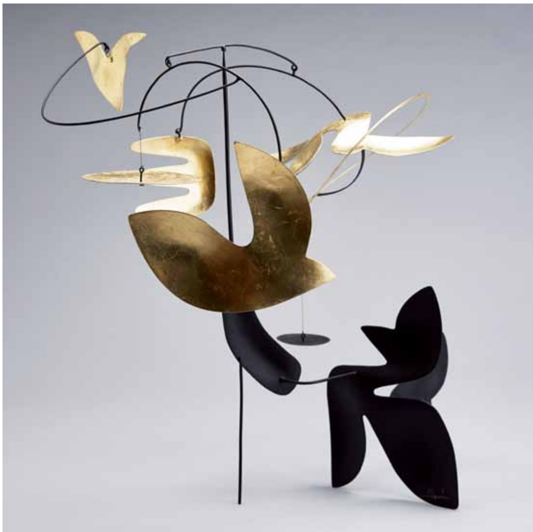
A Unified Model of Specified Complexity Standing mobile in brass and aluminum with steel wires and nylon cord, oil color and 23 karat gold leaf 19 x 17 x 13" MD850