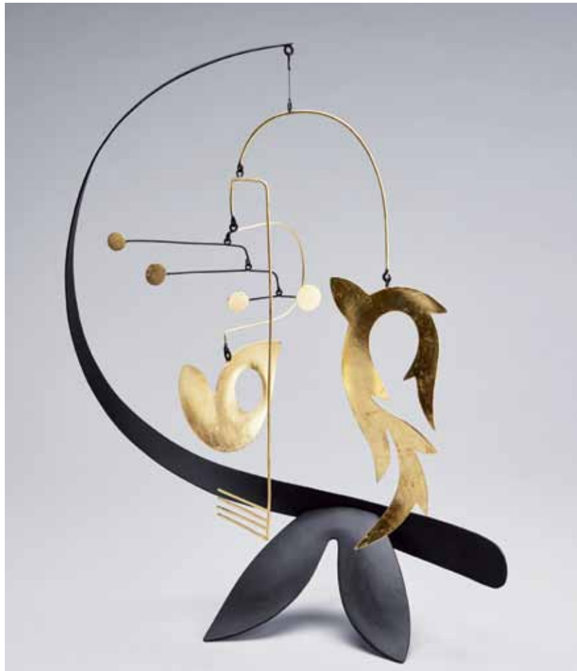
The Developing World Standing mobile in brass and aluminum with nylon cord, oil color and 23 karat gold leaf 16 x 11 x 8" MD851