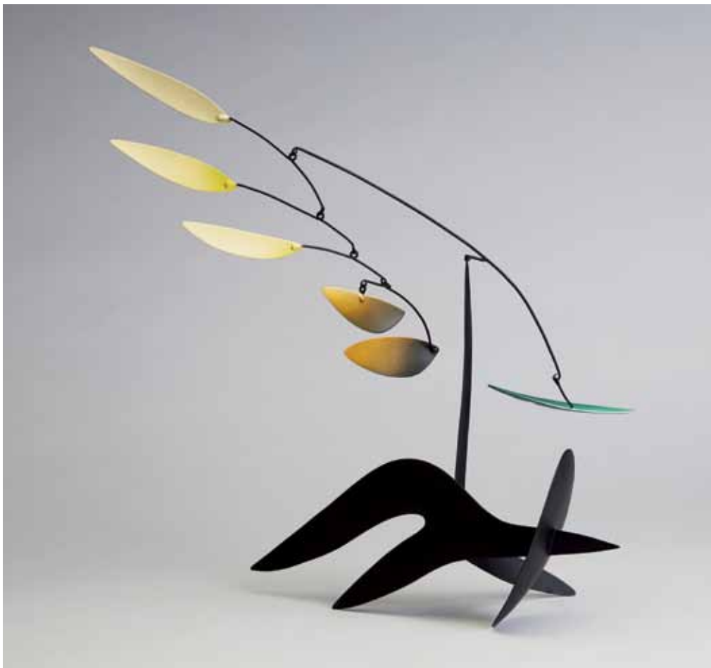
Arpeggio Standing mobile in brass and aluminum with steel wires, oil and acrylic colors 16 x 19 x 6" MD876