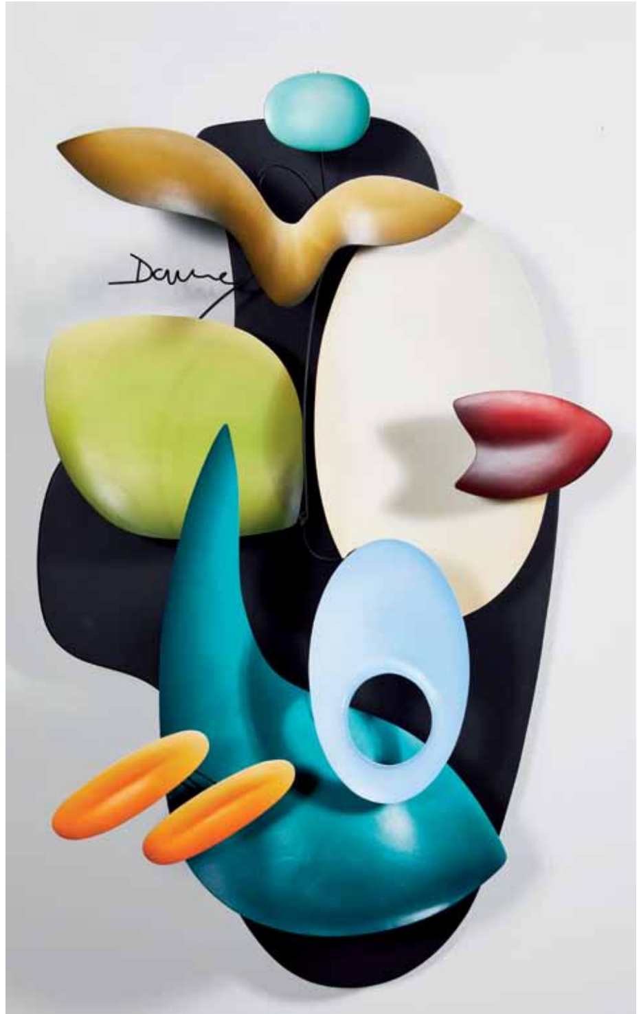
The Obscured View Wall-mounted mobile in aluminum and acrylic board with steel wires, oil and acrylic colors 38 x 24 x 13" MD909

About two years ago, I decided to try a different approach to designing wall-mounted mobiles. For many years, I would draw or cut out a shape from paper, and once happy with it, cut it out of thin aluminum and shape it with hammers and forming stakes. Then I would let my creative mind come up with the next shape, and the next, arranging them as I went. As a departure, I decided to cut shapes from colored paper—I have a huge stash of scraps from collage projects—and arrange a group of colors and shapes against a black background, adjusting it until I was happy with the result. I then formed the pieces in metal to recreate the paper model. There is something extremely satisfying about this new process, and The Obscured View shows how it results in a strong, color-oriented composition. It is very exciting to me to see the possibilities when disparate colors and shapes find their way to a harmonious composition! It is a poetic vision of the art I love making so much.