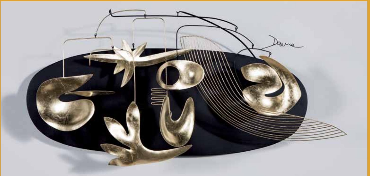
Guarding the Queen

Please visit www.puckergallery.com for a list of virtual gatherings and events accompanying Flights of Joy .