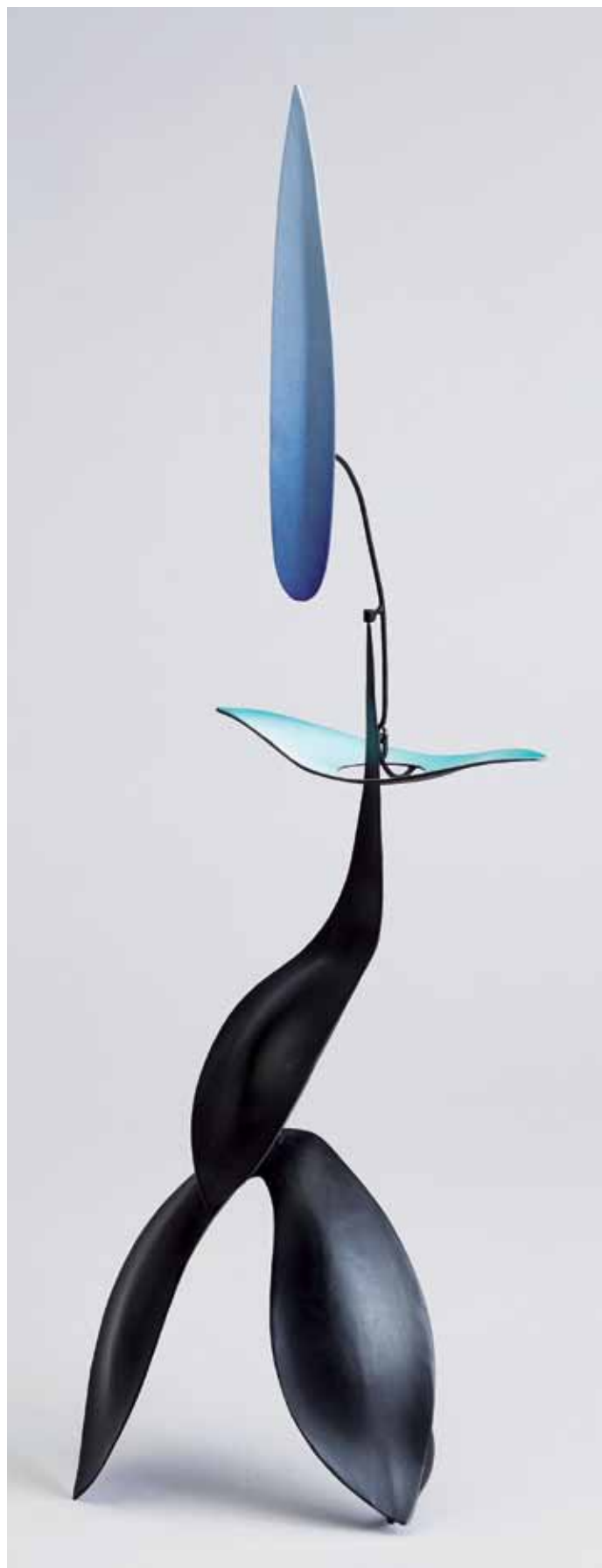
The Right Touch

Standing mobile in brass and aluminum with steel wires, oil and acrylic colors 17 x 6 x 7" MD896