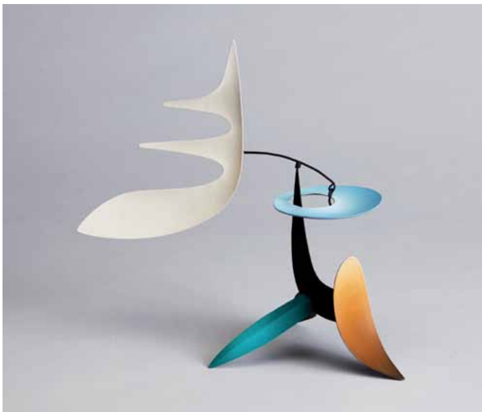
A Walk Along a Short Path Standing mobile in brass and aluminum with steel wires, oil and acrylic colors 10 x 9.5 x 5.5" MD880