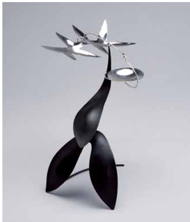
Fountain of Youth

Printed in the United States by Modern Postcard