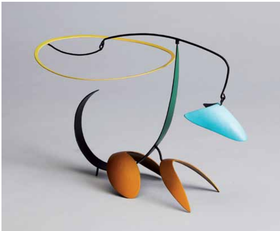
Perrito Standing mobile in brass and steel, oil and acrylic colors 7 x 11 x 6" MD884