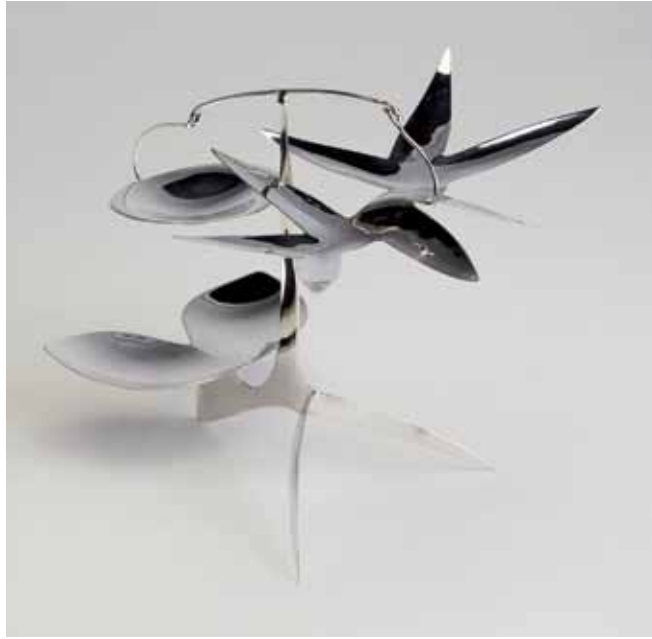
Perhaps A Thorny Disposition Standing mobile in sterling silver 7 x 8 x 7" MD873