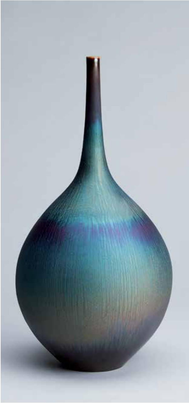
Bottle Blue hare's fur glaze 12 \frac{1}{2} x 6 x 6" HM677