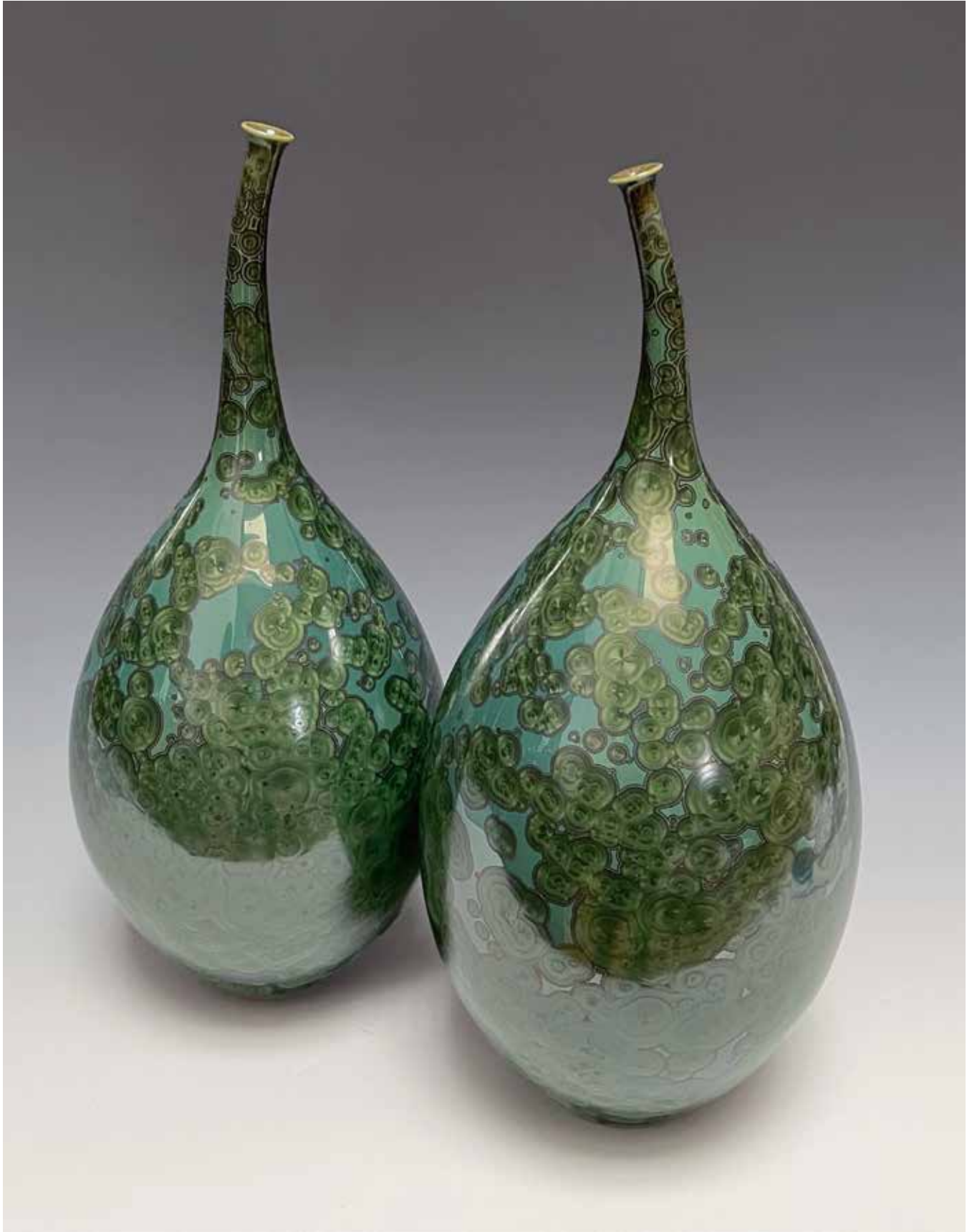
Pair of Vases Green crystalline glaze 17 x 7 x 7" each HM710