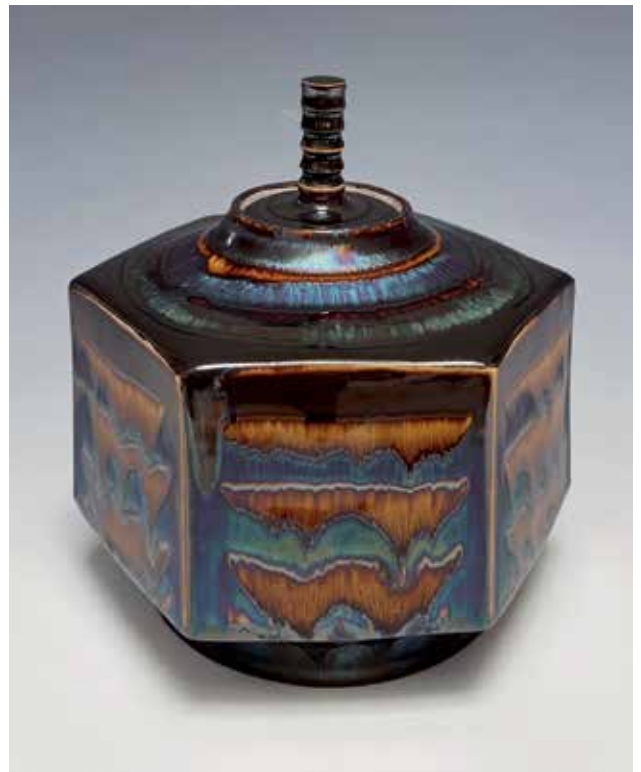
Hexagon-shaped Jar Blue waves glaze 9 x 6¾ x 6¾" HM703