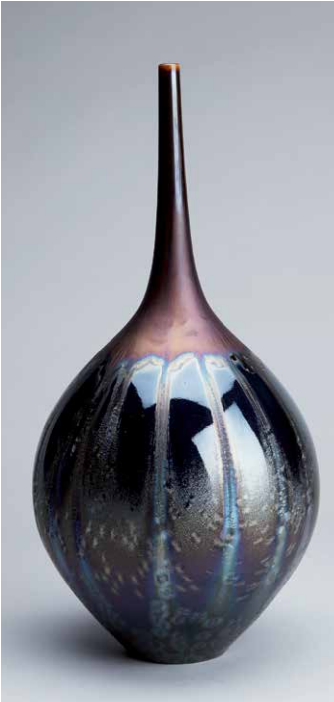
Bottle Purple hare's fur and starry night glaze 15 x 7 1/2 x 7 1/2" HM678