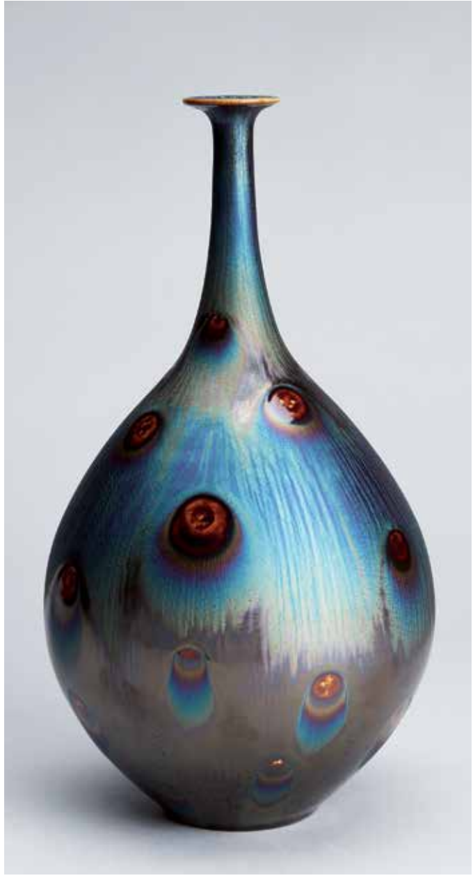
Vase Peacock glaze 13 x 6 1/2 x 6 1/2" HM687