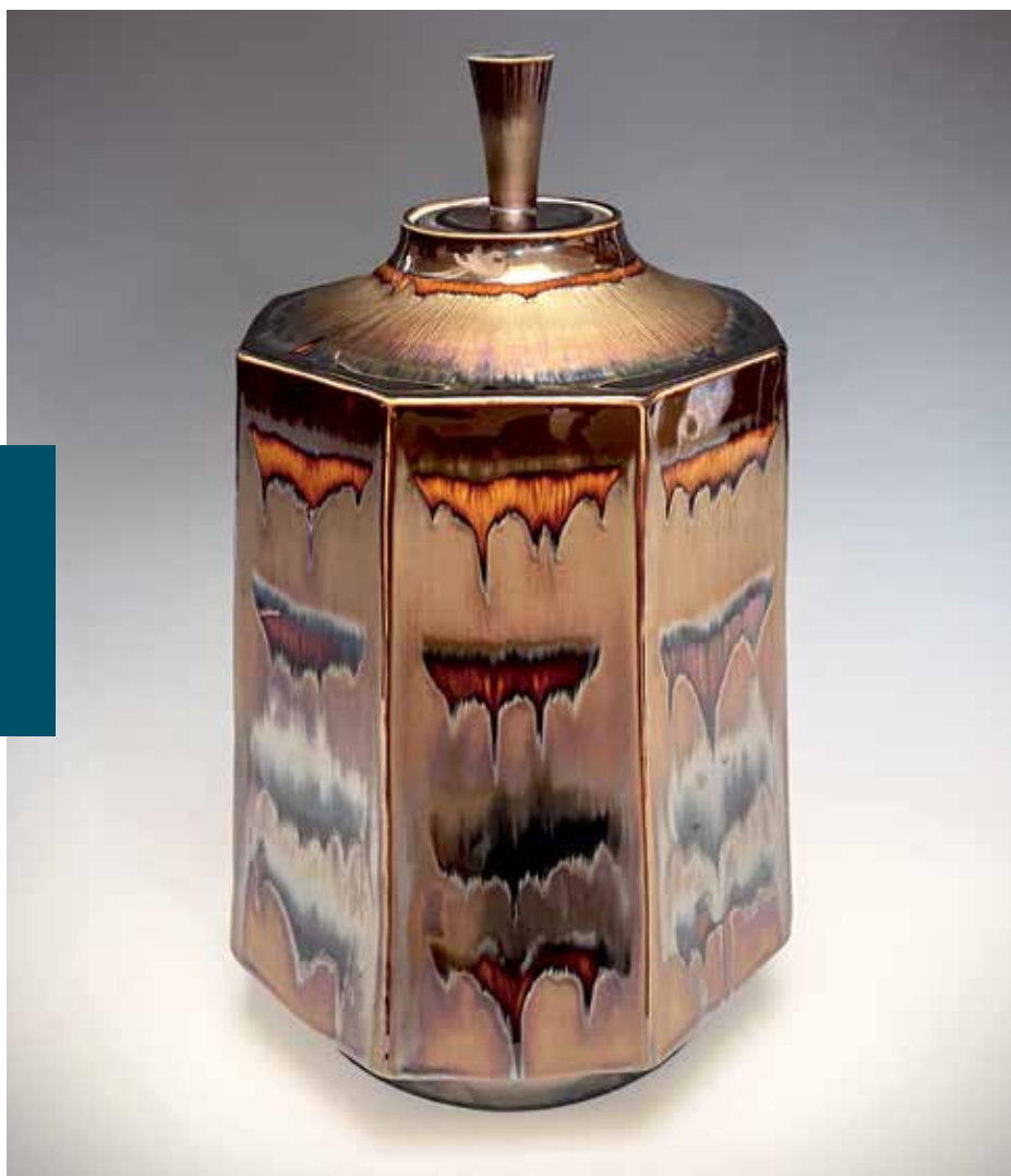
Octagon-shaped Jar Gold waves glaze 17 1/2 x 9 1/2 x 9 1/2" HM711