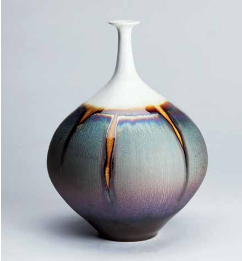
Vase Snow Cap with blue hare's fur glaze 10 x 7 x 7" HM685