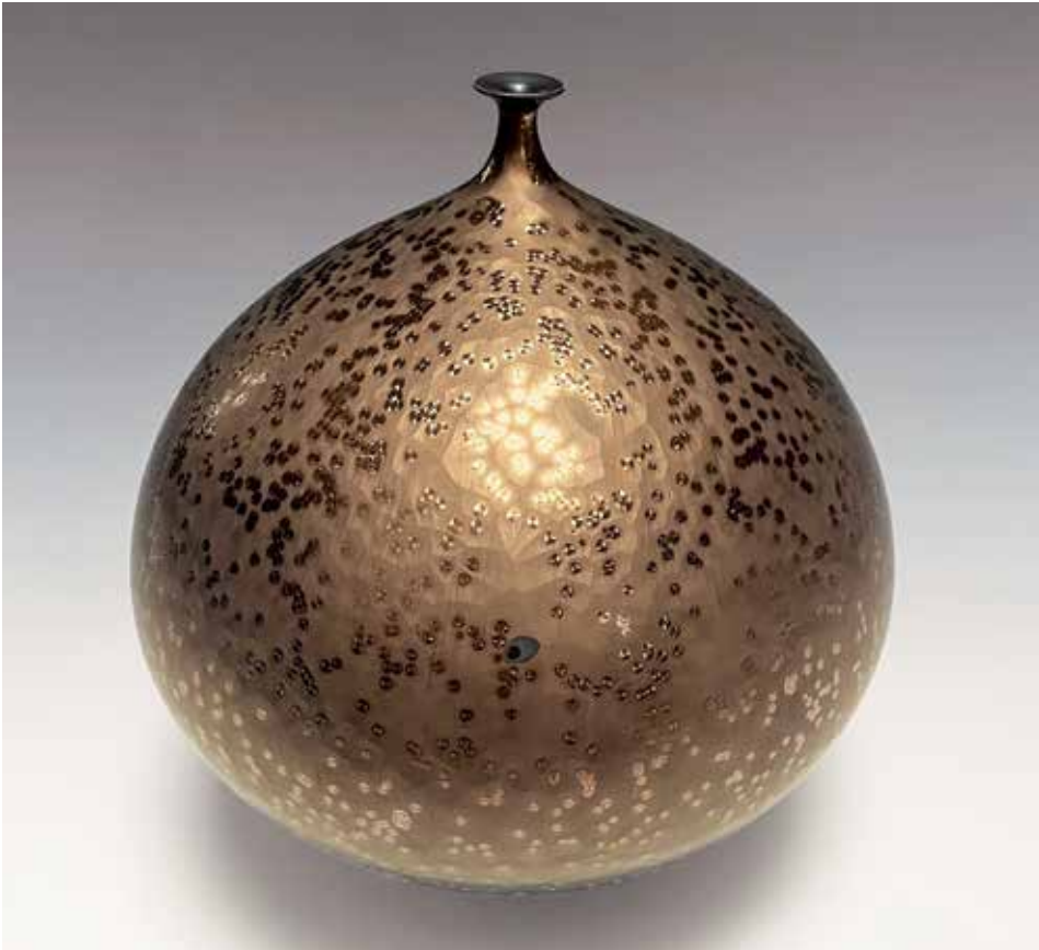
Vase Gold spots glaze 13 x 10 x 10" HM694