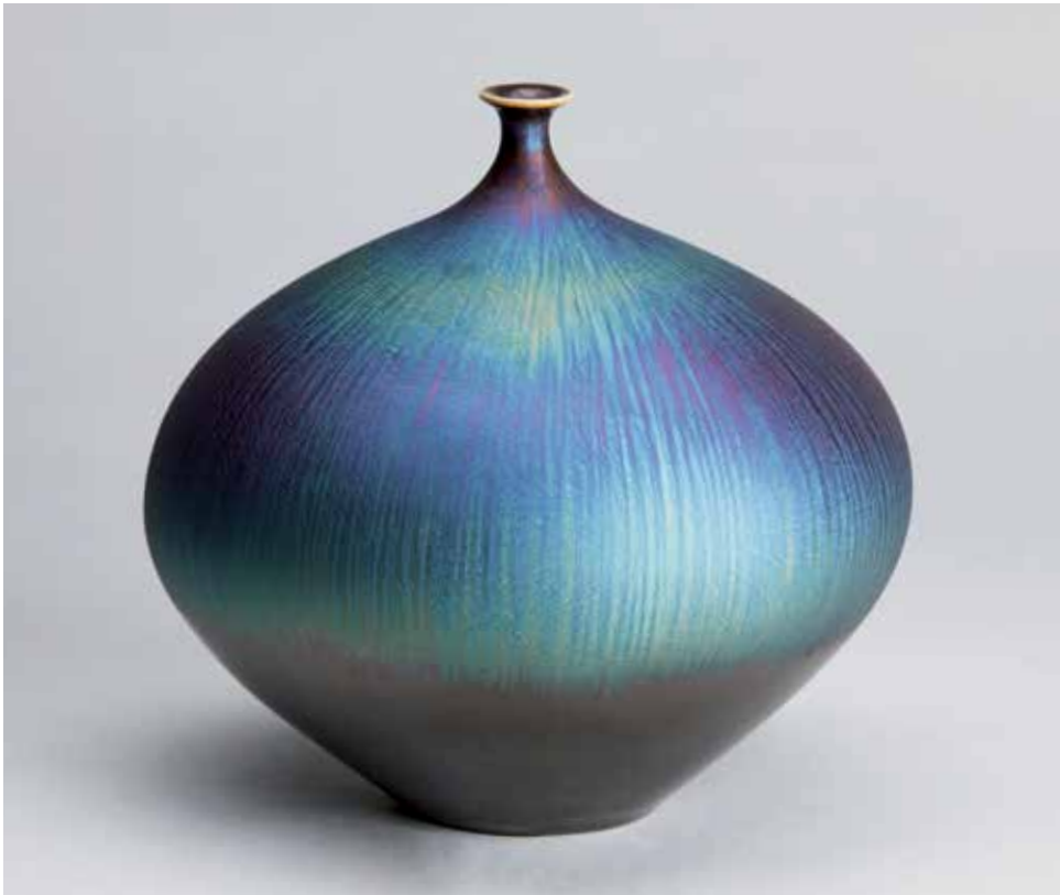
Vase Blue hare's fur glaze 8 1/2 x 6 1/2 x 6 1/2" HM688