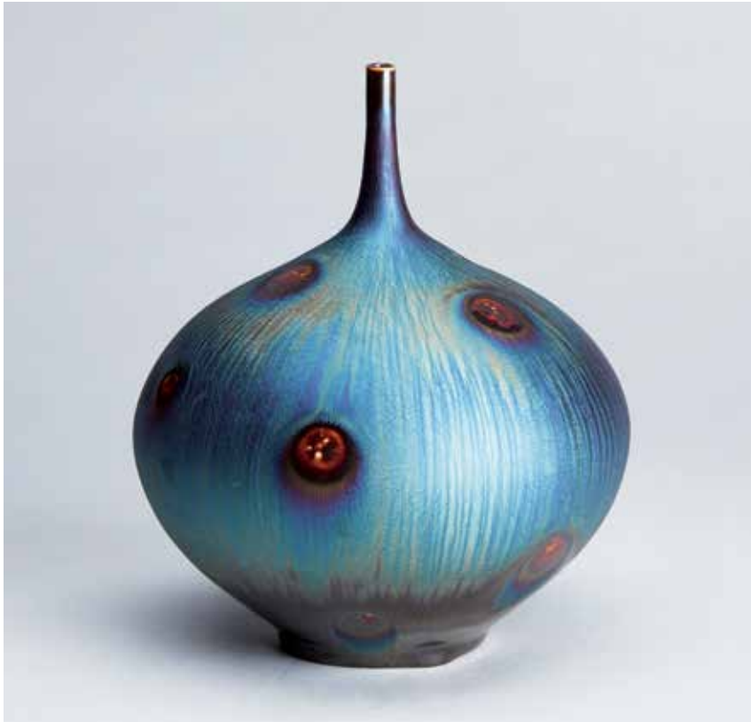
Bottle Peacock glaze 9 x 5 1/2 x 5 1/2" HM686