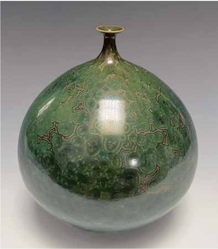
Vase Green coral glaze 10 x 8 3 / 4 x 8 3 / 4 " HM693