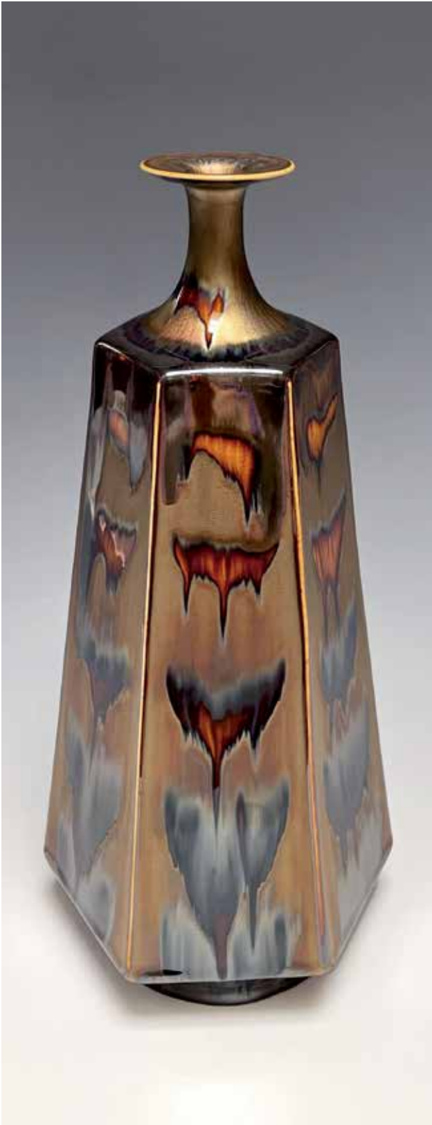
Hexagon-shaped Vase Gold waves glaze 14½ x 7 x 7" HM700