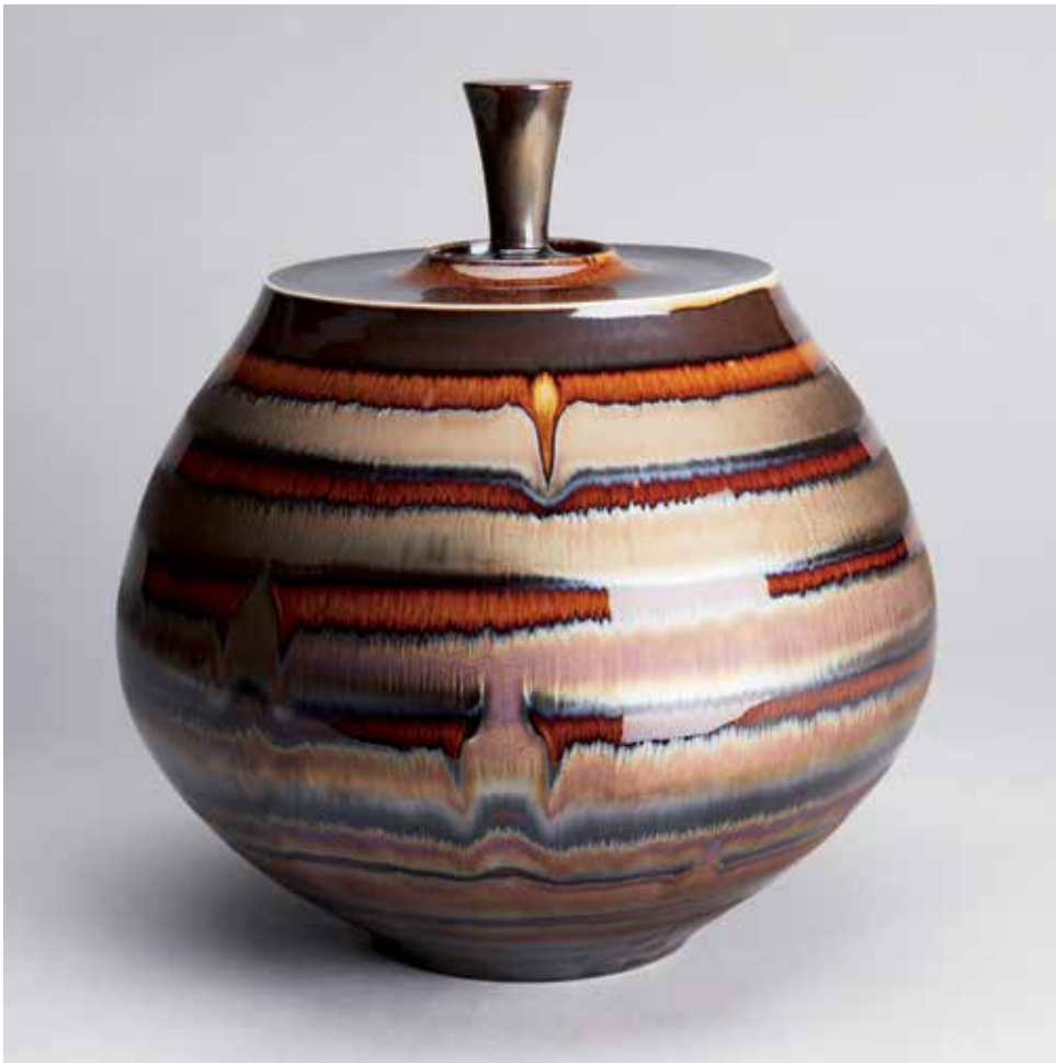
Jar Gold and brown glaze 13 1/2 x 10 1/2 x 10 1/2" HM691