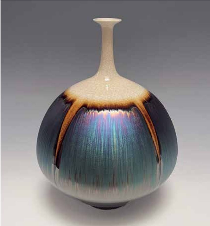
Vase Snow Cap with blue hare's fur glaze 13 x 10 x 10" HM695