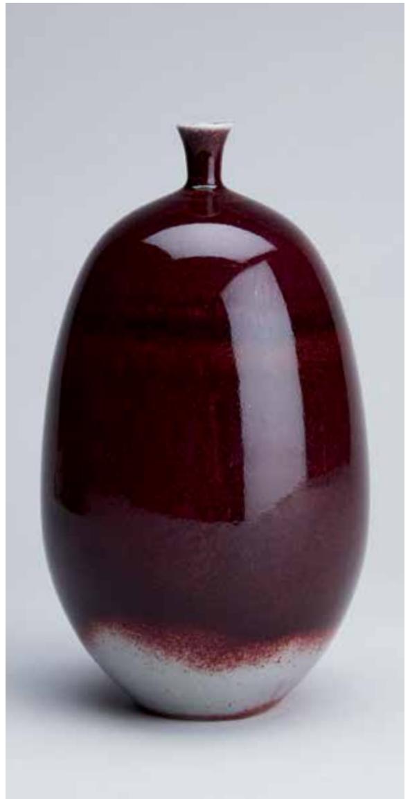
Vase Red copper glaze 9 3/4 x 5 1/2 x 5 1/2" HM675