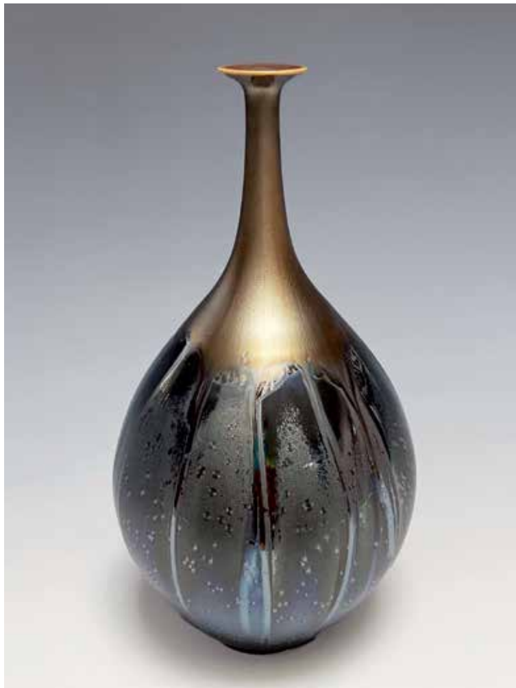
Vase Gold and starry night glaze 12 x 6 x 6" HM705