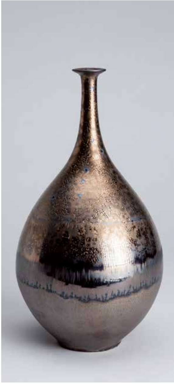
Vase Gold glaze 11 1/4 x 6 x 6" HM668