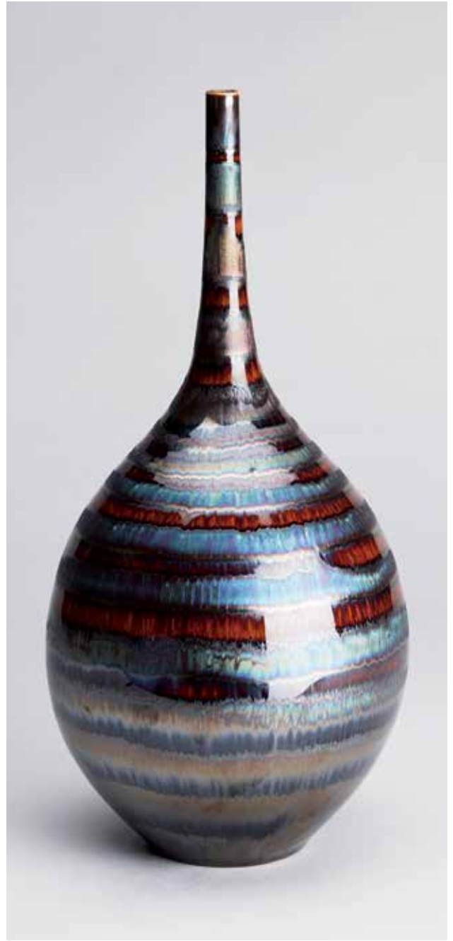
Bottle Blue waves glaze 13 \frac{1}{4} x 6 x 6" HM684