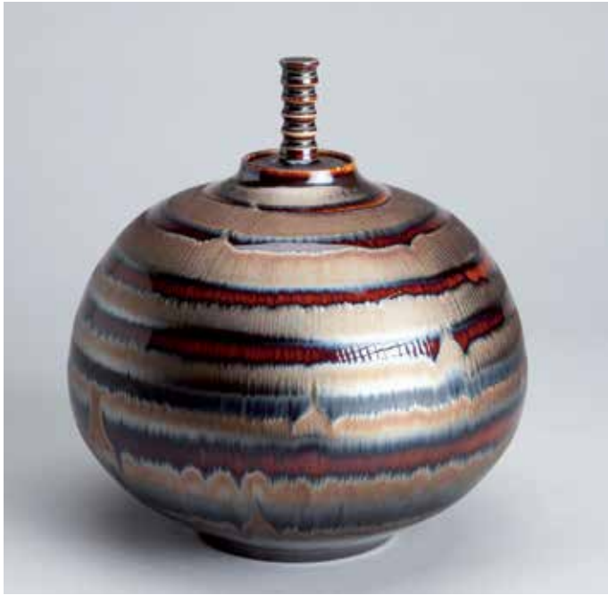
Jar Gold waves glaze 8½ x 7¾ x 7¾" HM670