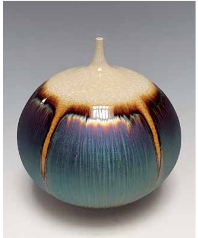
Vase Snow Cap with blue hare's fur glaze 7 x 6½ x 6½" HM709