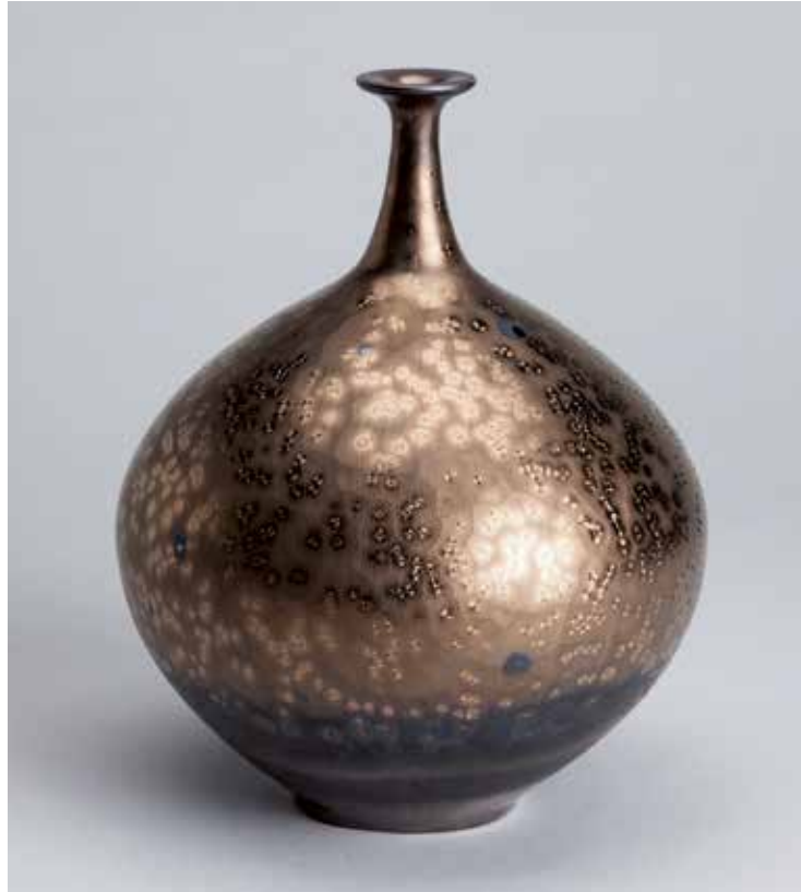
Vase Gold glaze 8 1/2 x 6 1/2 x 6 1/2" HM667