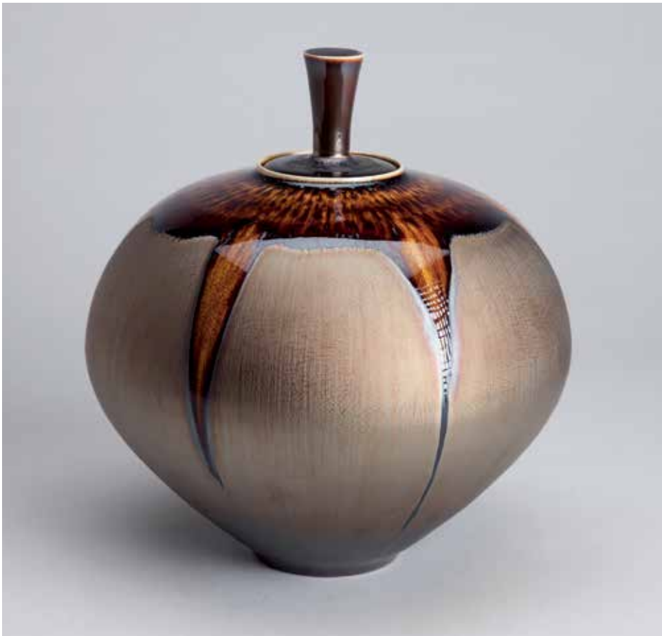
Jar Gold and brown glaze 9 1/4 x 8 1/2 x 8 1/2" HM669