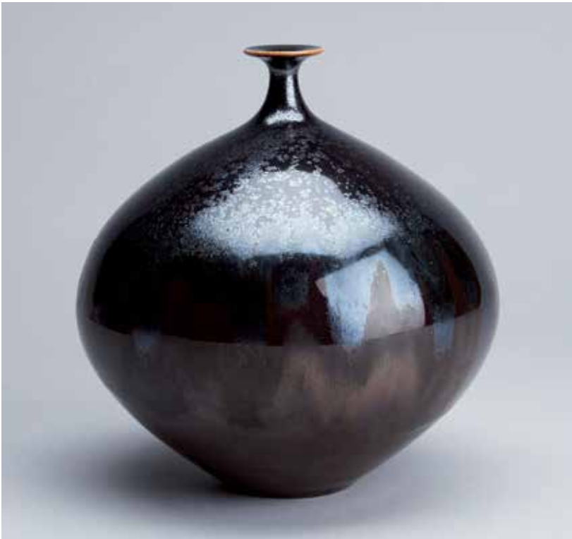
Vase Iron glaze 8 1/2 x 6 1/2 x 6 1/2" HM676