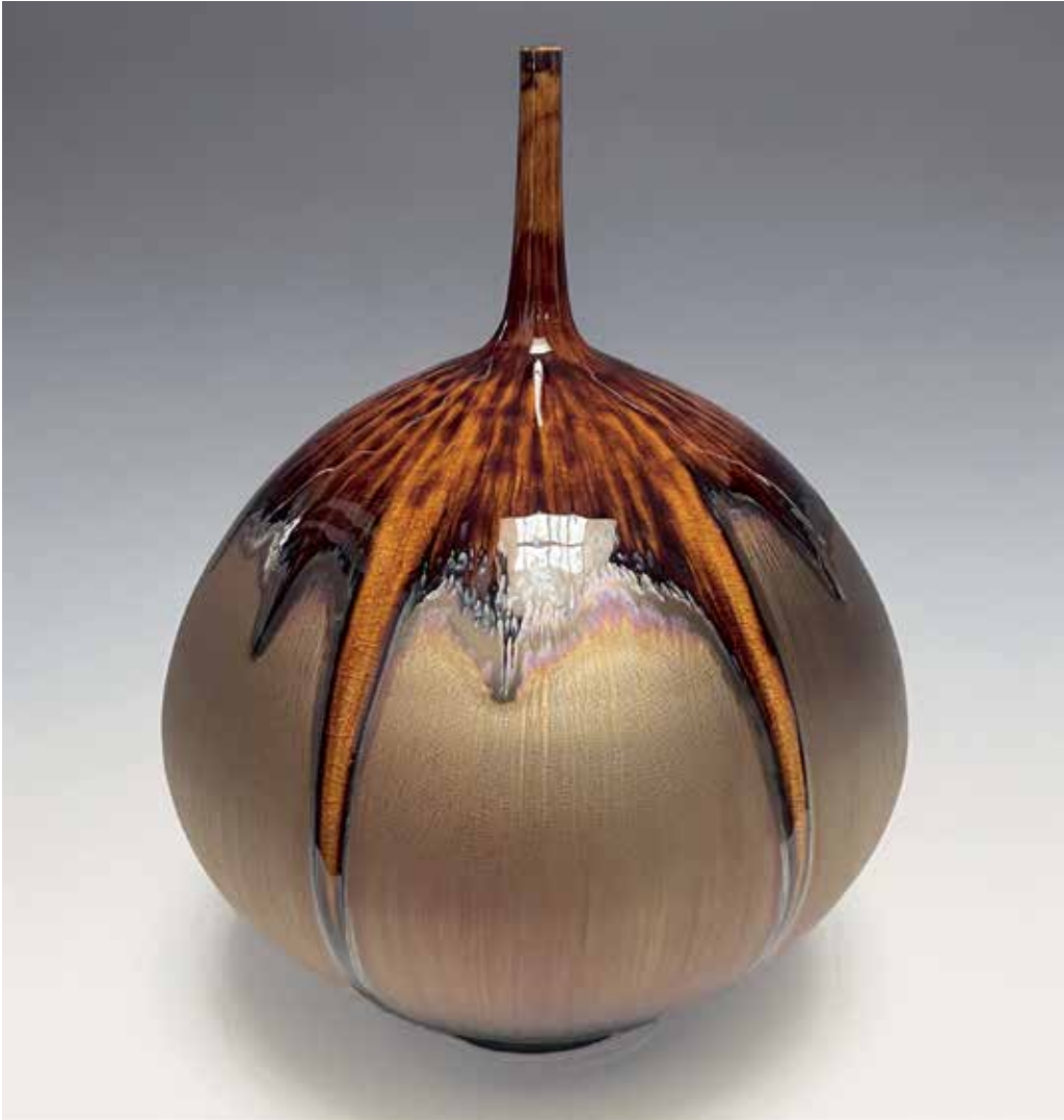
Bottle Gold and brown glaze 14 3/4 x 11 x 11" HM692