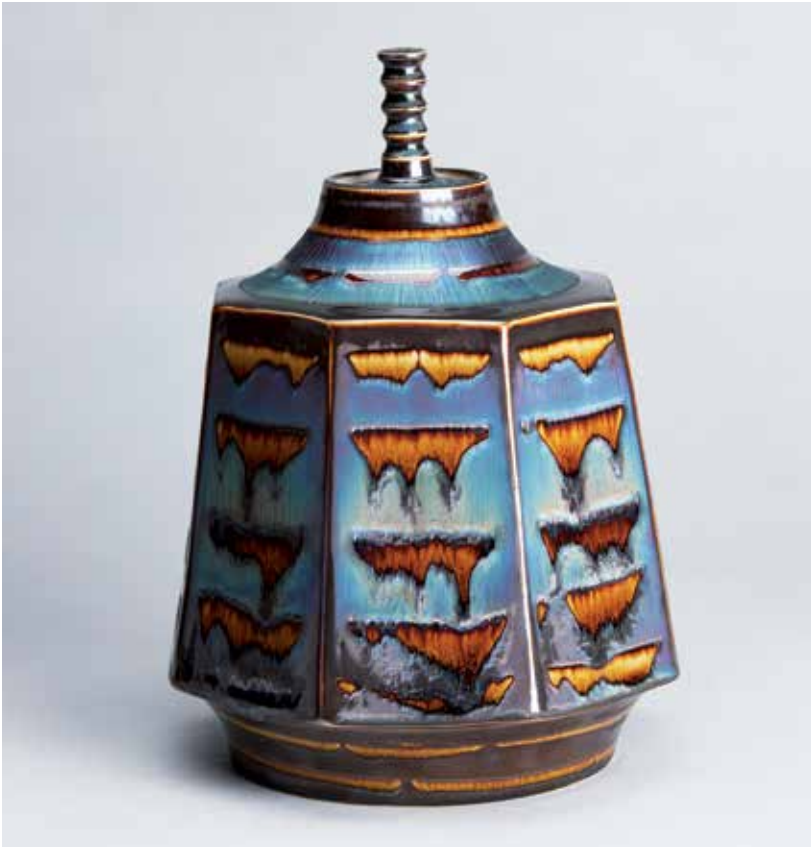
Octagon-shaped Jar Blue waves glaze 11 x 8 x 8" HM683