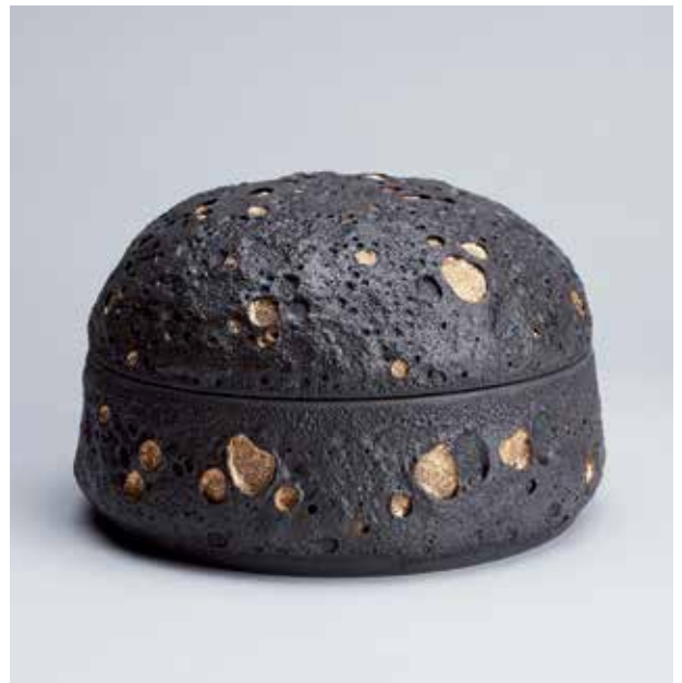
Covered Jar Lunar glaze and 24K gold 5 x 9 x 9" HM672