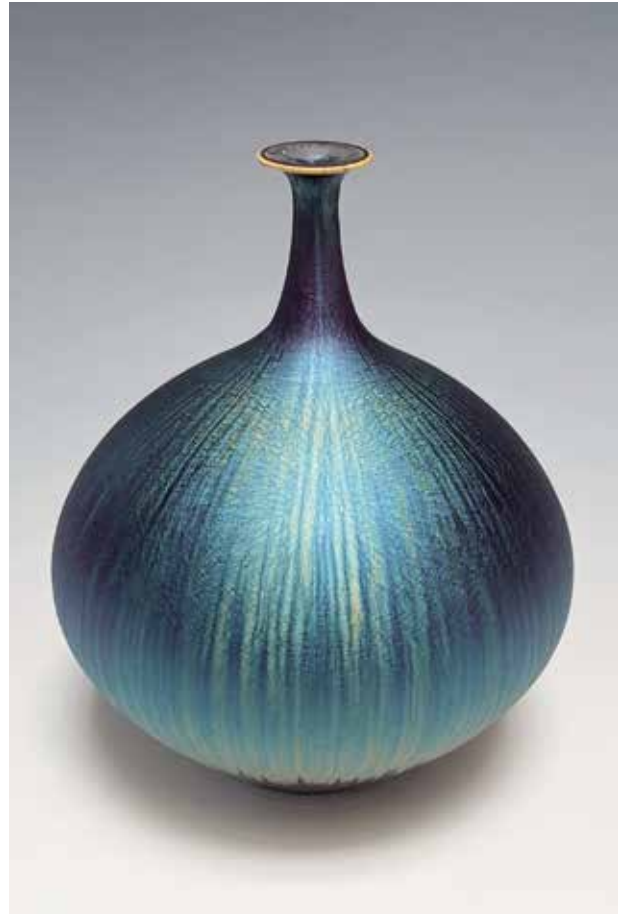
Vase Blue hare's fur glaze 7 1/2 x 6 x 6" HM702