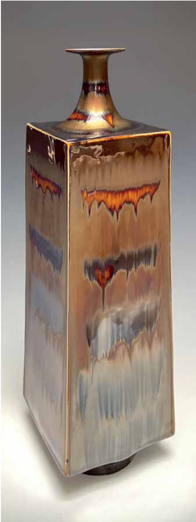
Square Vase Gold waves glaze 21 x 6 x 6" HM708