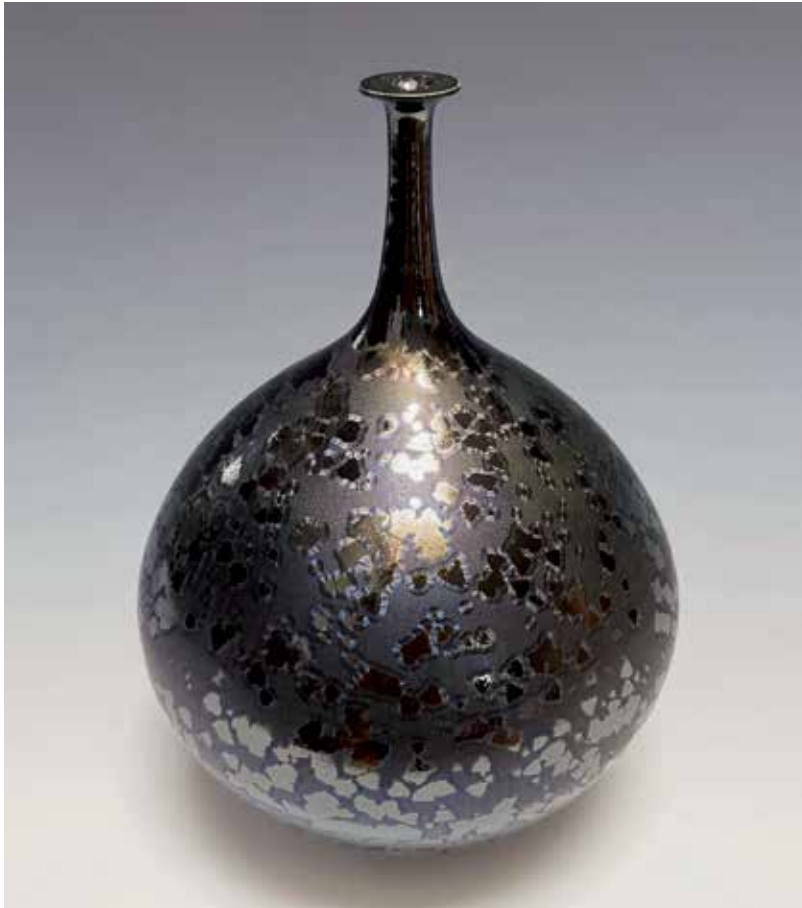
Vase Midnight Sky glaze 11 1/4 x 7 1/2 x 7 1/2" HM701