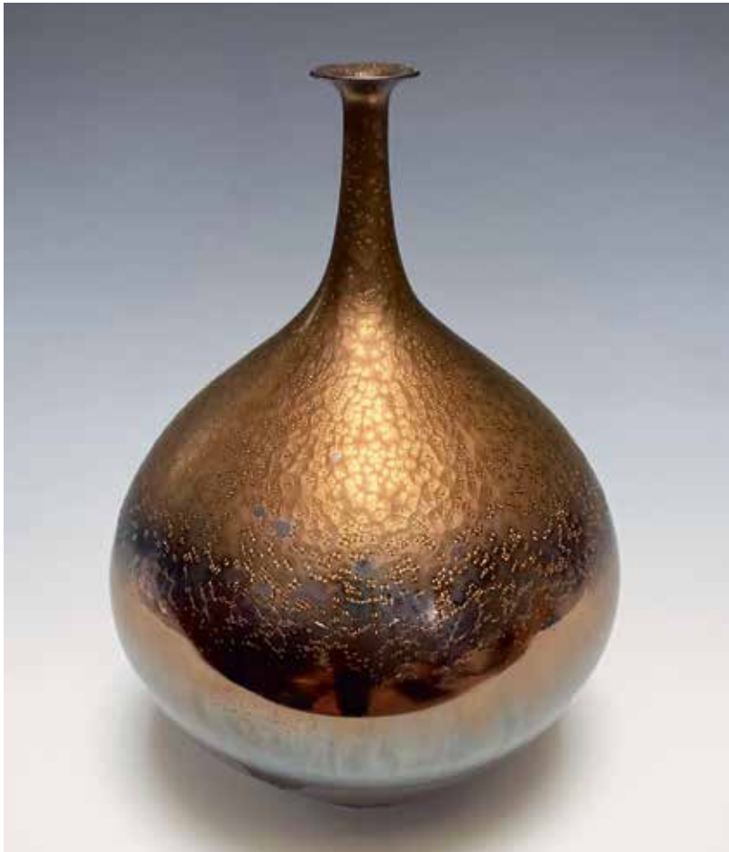
Vase Gold glaze 12 3/4 x 7 3/4 x 7 3/4" HM707