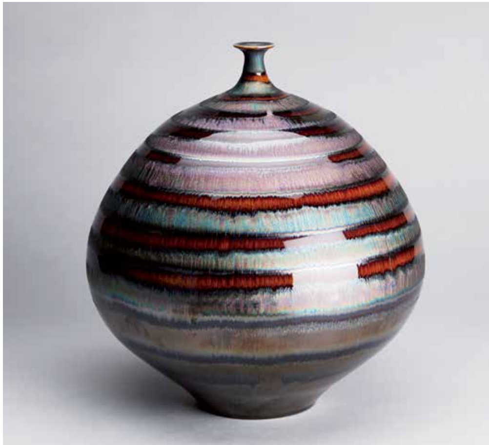
Jar Blue waves glaze 13 1/2 x 10 x 10" HM682