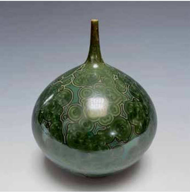
Vase Green coral glaze 8 x 6 1/4 x 6 1/4" HM704