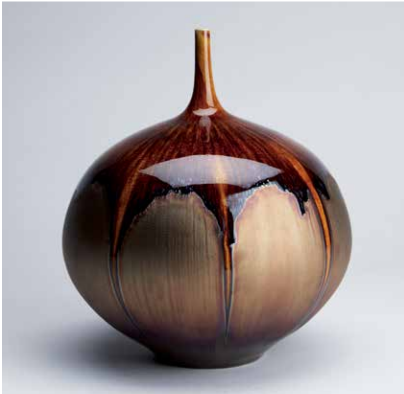
Bottle Gold and brown glaze 9 x 8 1/2 x 8 1/2" HM673