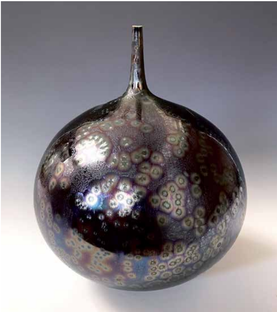
Vase Fireworks in the Night Sky glaze 12¼ x 10 x 10" HM698