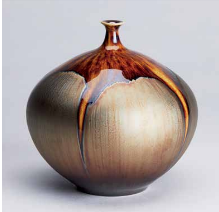
Vase Gold and brown glaze 7 x 5 1/2 x 5 1/2" HM689