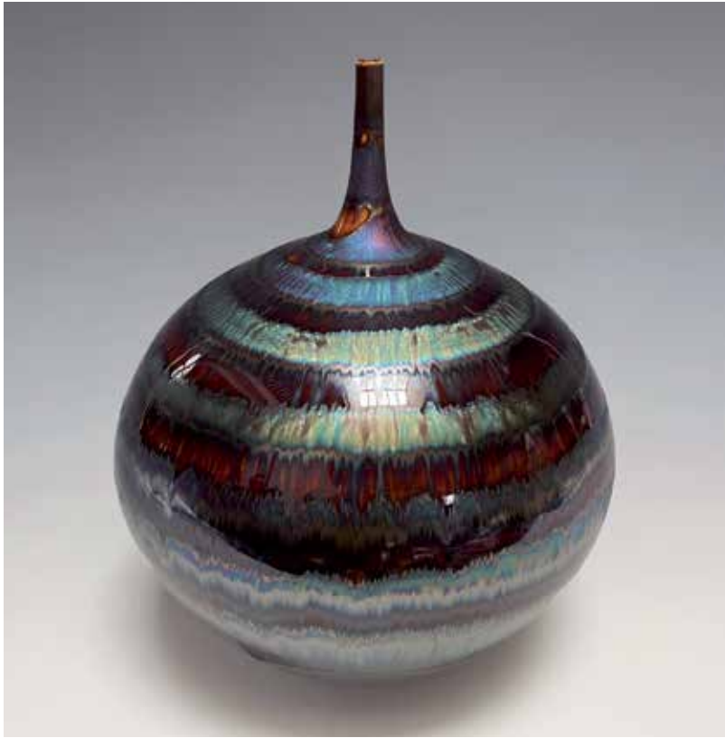
Bottle Blue waves glaze 10 x 7 1/2 x 7 1/2" HM706