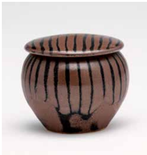
BOWL WITH A LID KAKI GLAZE 3 x 3.5 x 3.5" YH1006