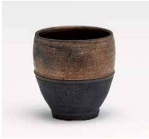
SAKE CUP COPPER GLAZE 2.75 x 2.25 x 2.25" YH1063