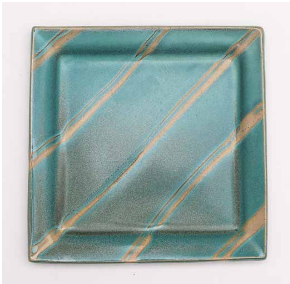
SQUARE PLATE BLUE NUKA GLAZE 1 x 9 x 9" YH1079