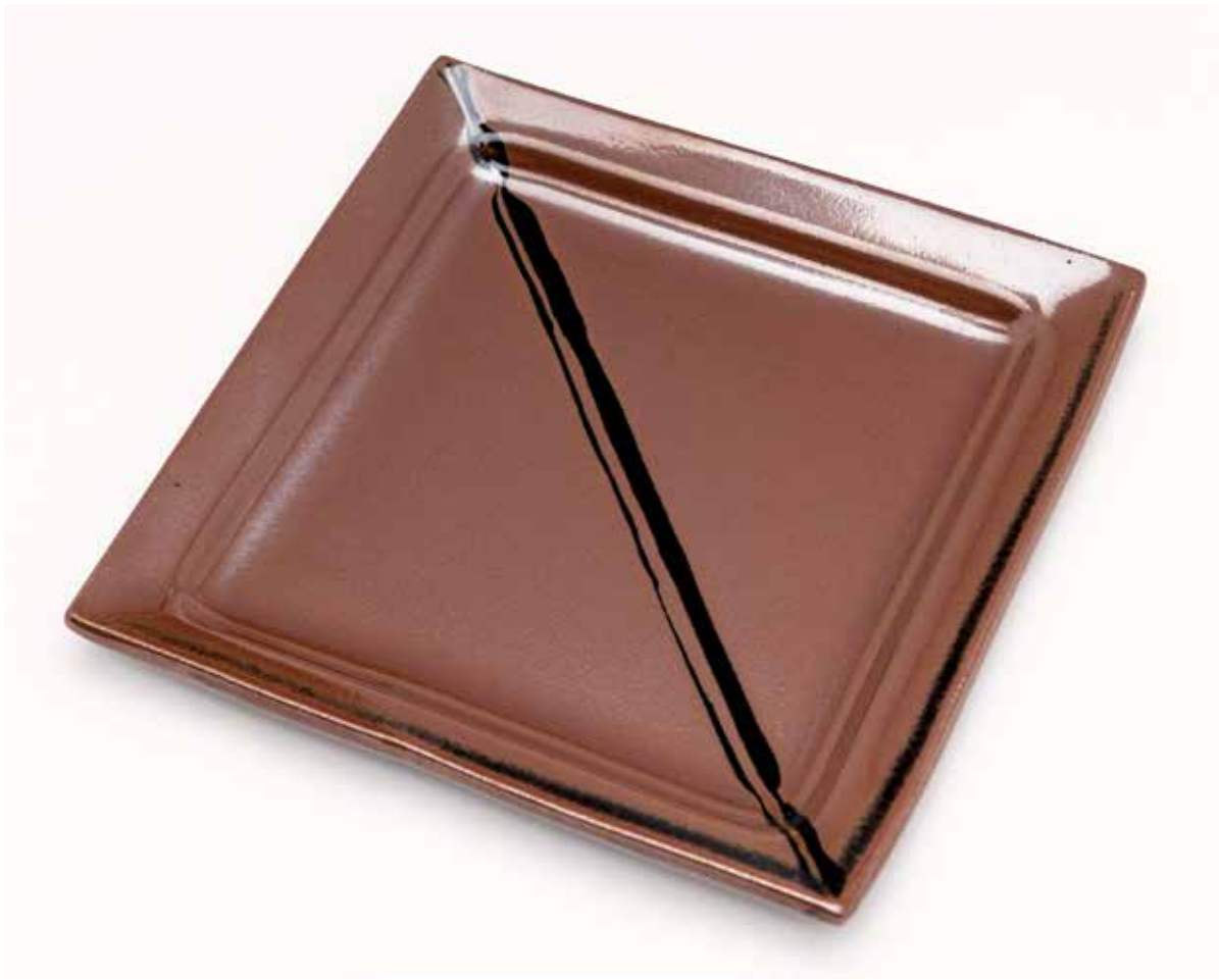
SQUARE PLATE KAKI GLAZE 1 x 9 x 9" YH1082