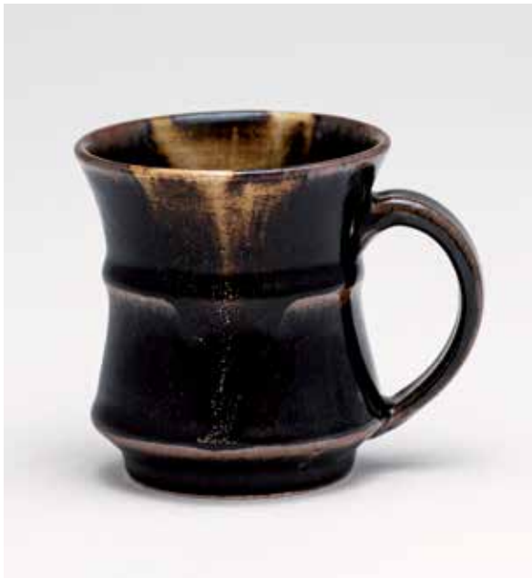
MUG BLACK GLAZE 3.5 x 4.25 x 3.25" YH1015