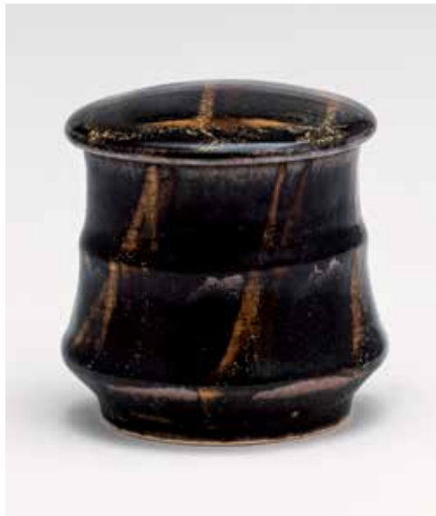
BOWL WITH A LID BLACK GLAZE 3.5 x 3.25 x 3.25" YH1010