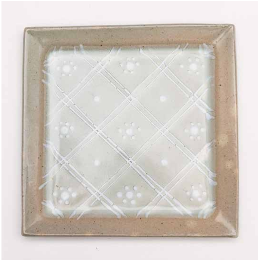
SQUARE PLATE WHITE NUKA GLAZE 1 x 9 x 9" YH1077