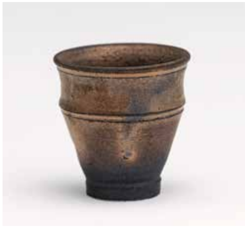
SAKE CUP COPPER GLAZE 2.5 x 2.5 x 2.5" YH1062