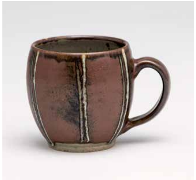
MUG KAKI GLAZE 4 x 4.5 x 3.5" YH1027