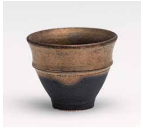
SAKE CUP COPPER GLAZE 2 x 3 x 3" YH1064