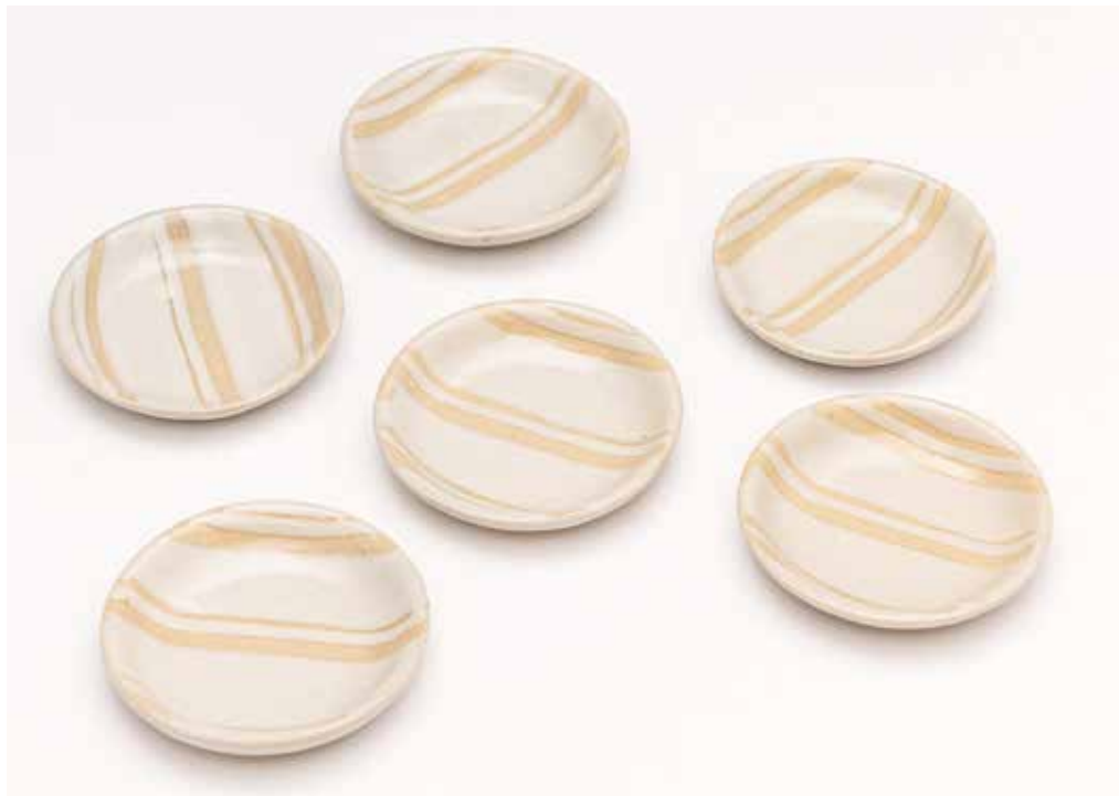
SET OF SIX SMALL PLATES WHITE NUKA GLAZE .5 x 4 x 4" EACH YH1067