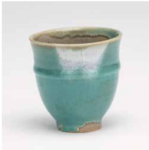
TEA BOWL BLUE NUKA GLAZE 3.5 x 3.25 x 3.25" YH1037