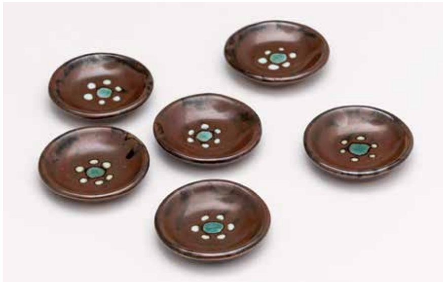
SET OF SIX MAMEZARA (VERY SMALL PLATES) KAKI GLAZE .5 x 2.5 x 2.5" EACH YH1073