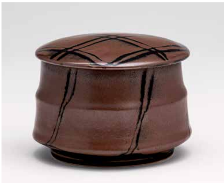
BOWL WITH A LID KAKI GLAZE 4.5 x 6.25 x 6.25" YH985