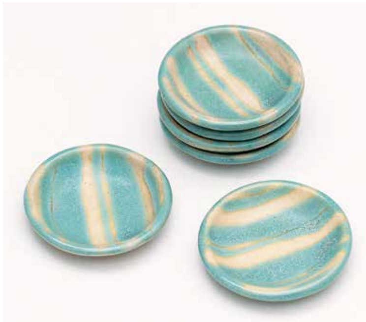
SET OF SIX MAMEZARA (VERY SMALL PLATES) BLUE NUKA GLAZE .5 x 2.5 x 2.5" EACH YH1071