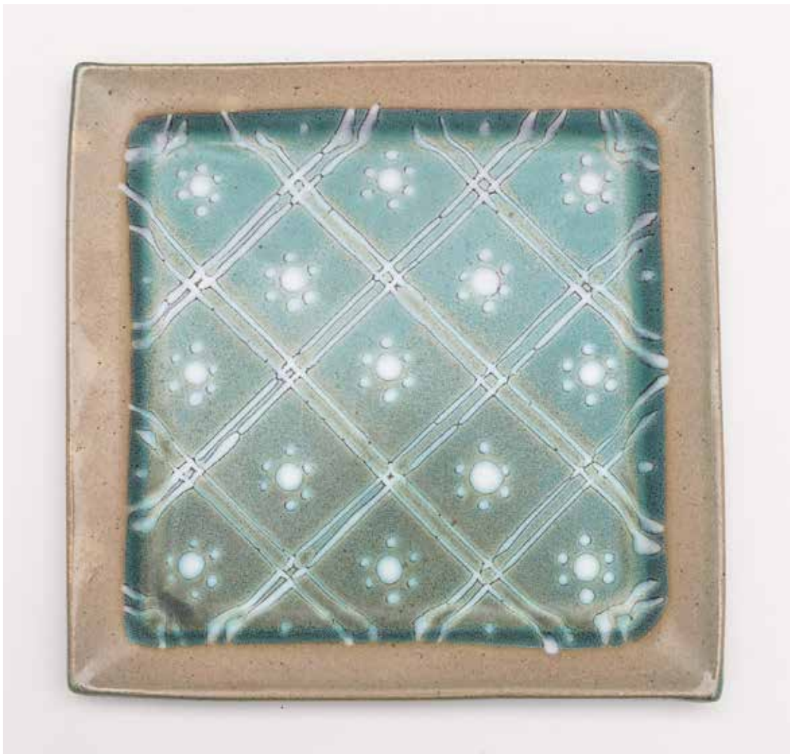
SQUARE PLATE BLUE NUKA GLAZE 1 x 9 x 9.25" YH1081