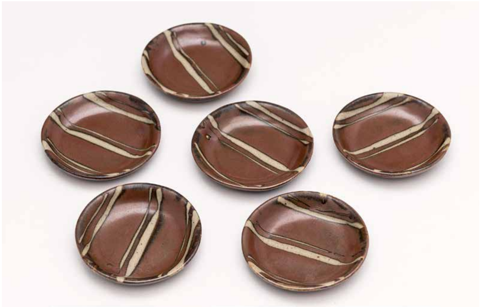
SET OF SIX SMALL PLATES KAKI GLAZE .5 x 4 x 4" EACH YH1065