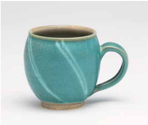
MUG BLUE NUKA GLAZE 3.5 x 5 x 3.5" YH1018