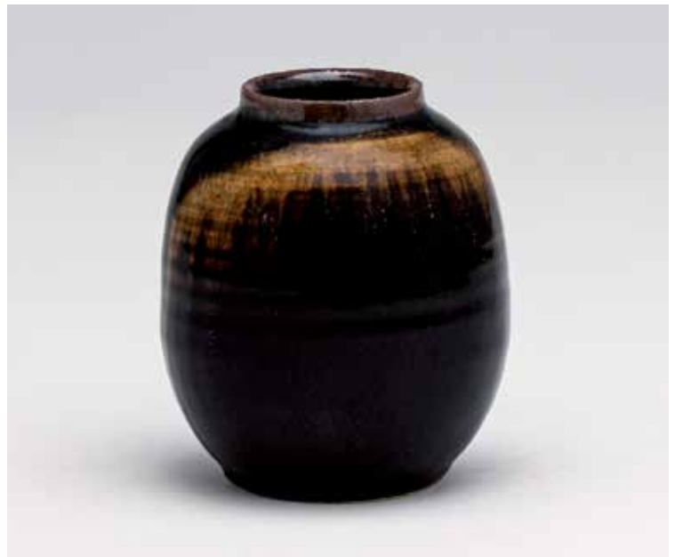
SINGLE FLOWER VASE BLACK GLAZE 4 x 3.5 x 3.5" YH995