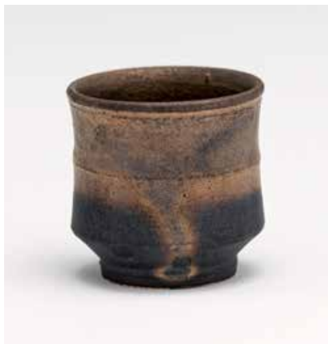
SAKE CUP COPPER GLAZE 2.5 x 2.5 x 2.5" YH1061