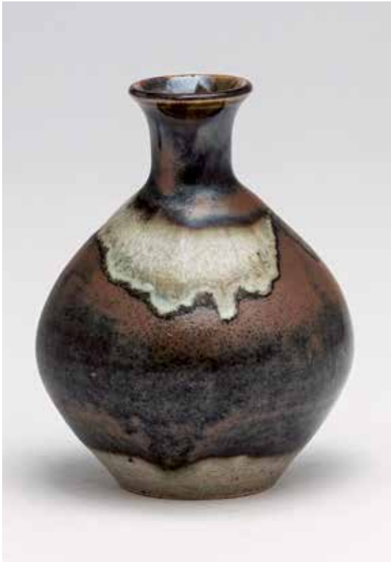
SINGLE FLOWER VASE KAKI GLAZE 5 x 4 x 4" YH992