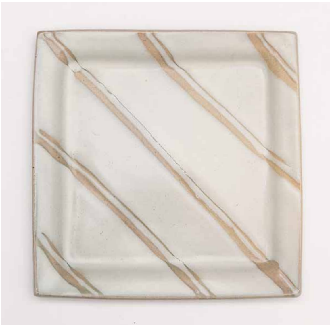
SQUARE PLATE WHITE NUKA GLAZE 1 x 9.25 x 9.25" YH1078