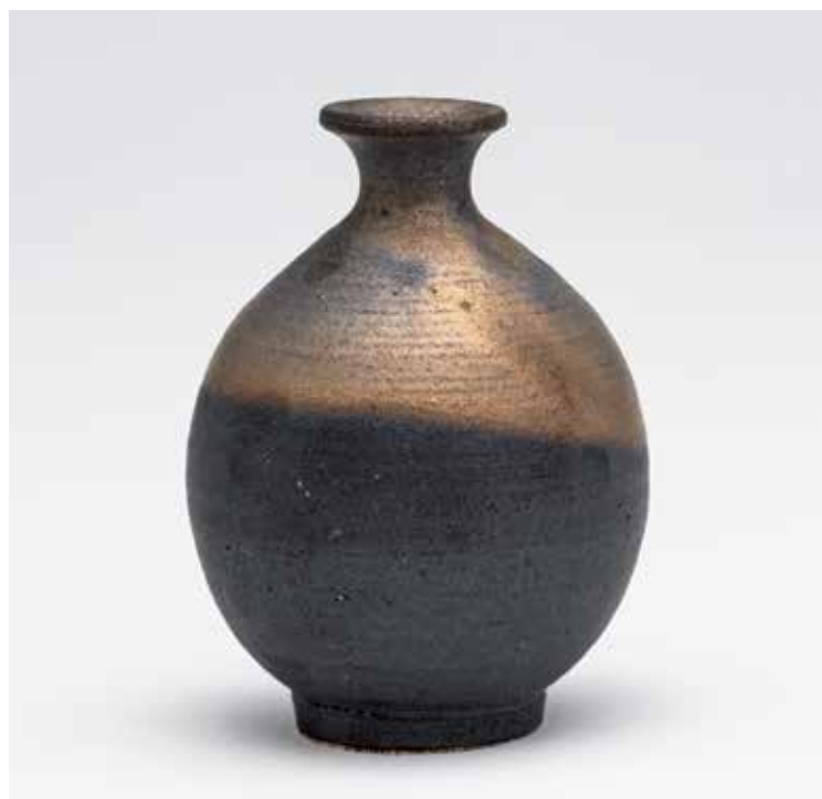
SINGLE FLOWER VASE COPPER GLAZE 4.5 x 3.5 x 3.5" YH998