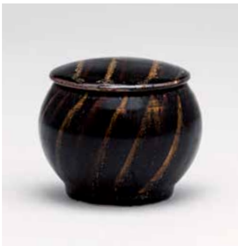
BOWL WITH A LID BLACK GLAZE 3.25 x 3.5 x 3.5" YH1008