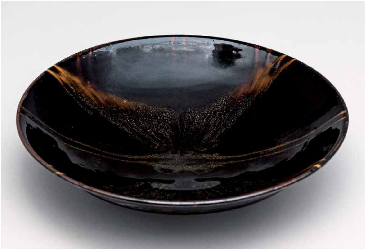
PLATE BLACK GLAZE 3 x 13.75 x 13.75" YH970