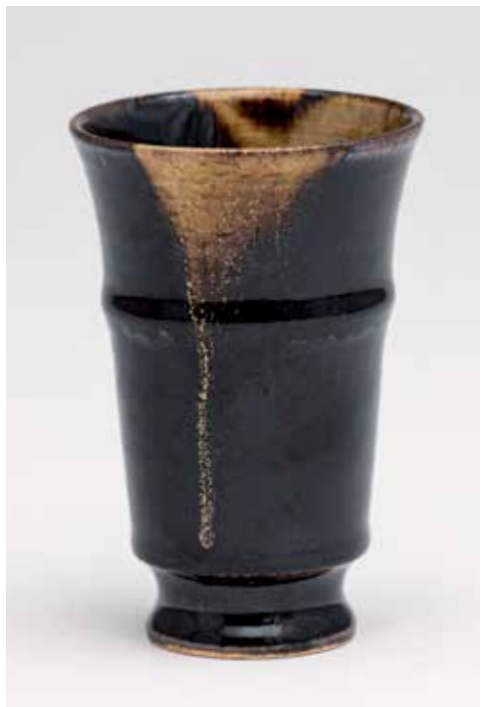
CUP BLACK GLAZE 5 x 3.5 x 3.5" YH1043