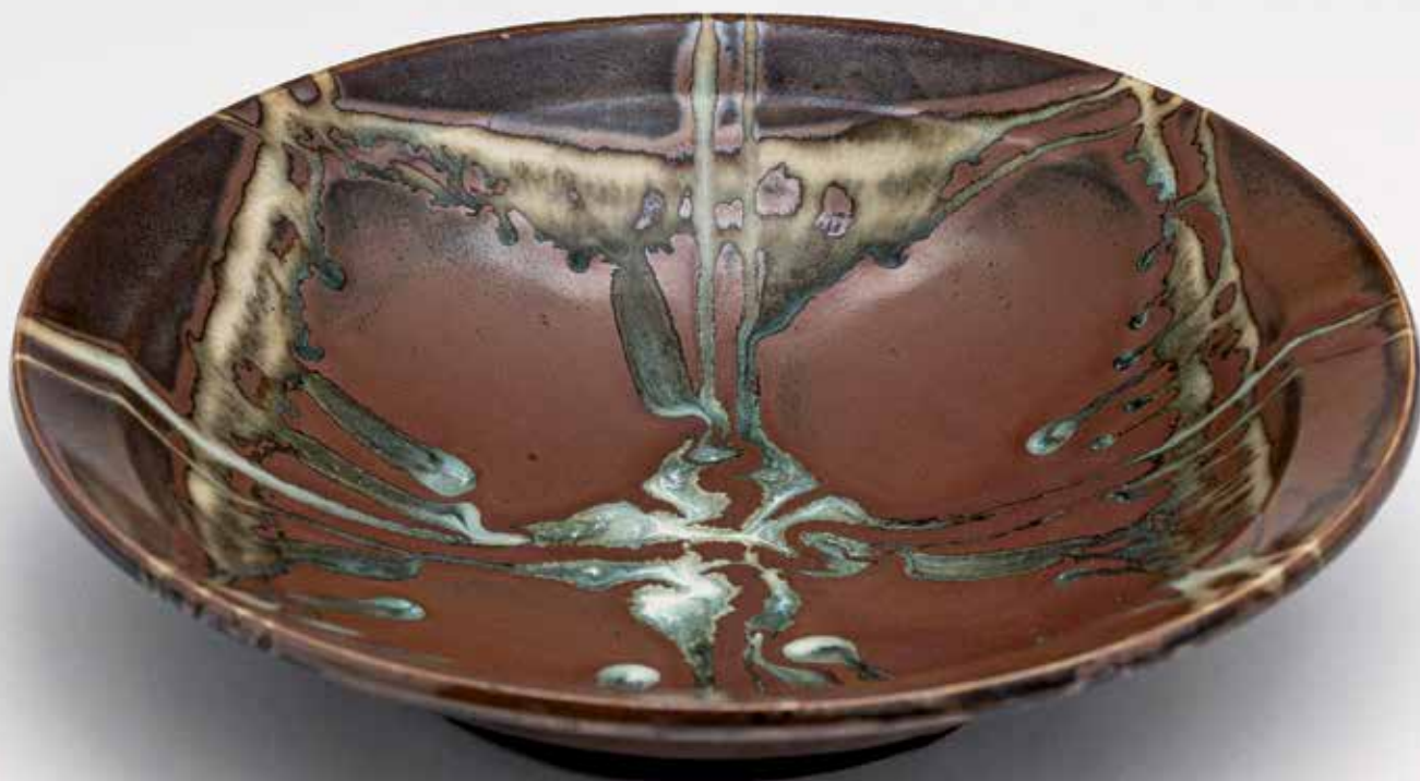
PLATE KAKI GLAZE 3 x 13.75 x 13.75" YH971