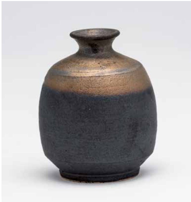
SINGLE FLOWER VASE COPPER GLAZE 4.25 x 3.5 x 3.5" YH999