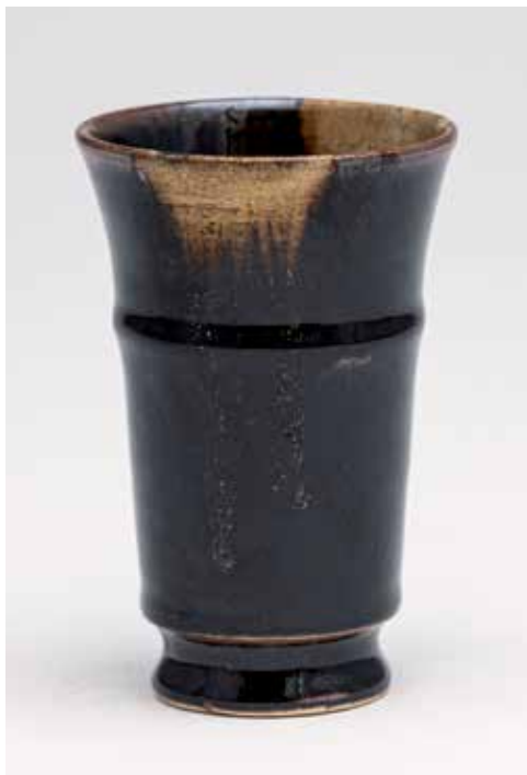
CUP BLACK GLAZE 5 x 3.25 x 3.25" YH1042