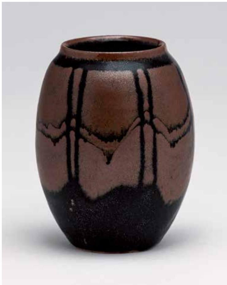
SINGLE FLOWER VASE KAKI GLAZE 5 x 3.75 x 3.75" YH990