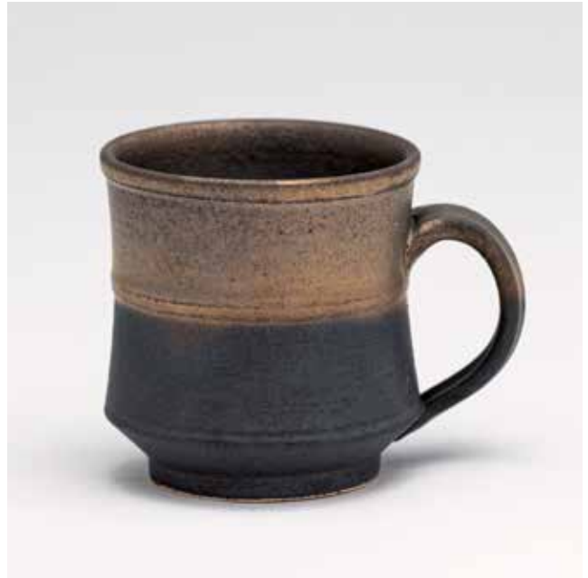
MUG COPPER GLAZE 3.5 x 4.5 x 3.25" YH1024