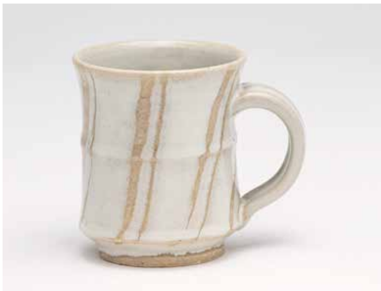
MUG WHITE NUKA GLAZE 4 x 4.5 x 3.5" YH1021