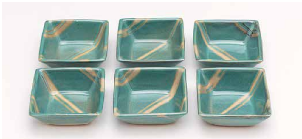
SET OF SIX SMALL SQUARE BOWLS BLUE NUKA GLAZE 1.25 x 4.25 x 4.25" EACH YH1013