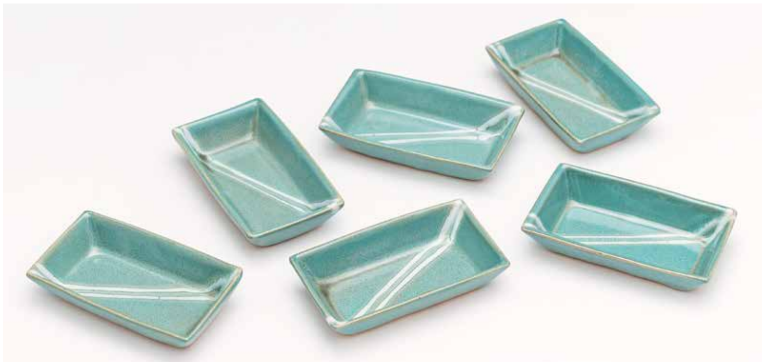
SET OF SIX SMALL SQUARE BOWLS BLUE NUKA GLAZE 1.25 x 5.25 x 3" EACH YH1012