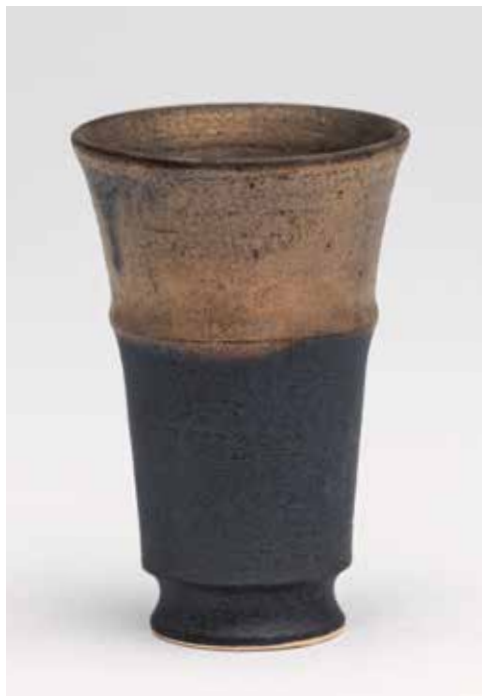
CUP COPPER GLAZE 5.25 x 3.5 x 3.5" YH1047