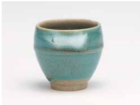
SAKE CUP BLUE NUKA GLAZE 2.5 x 2.5 x 2.5" YH1060