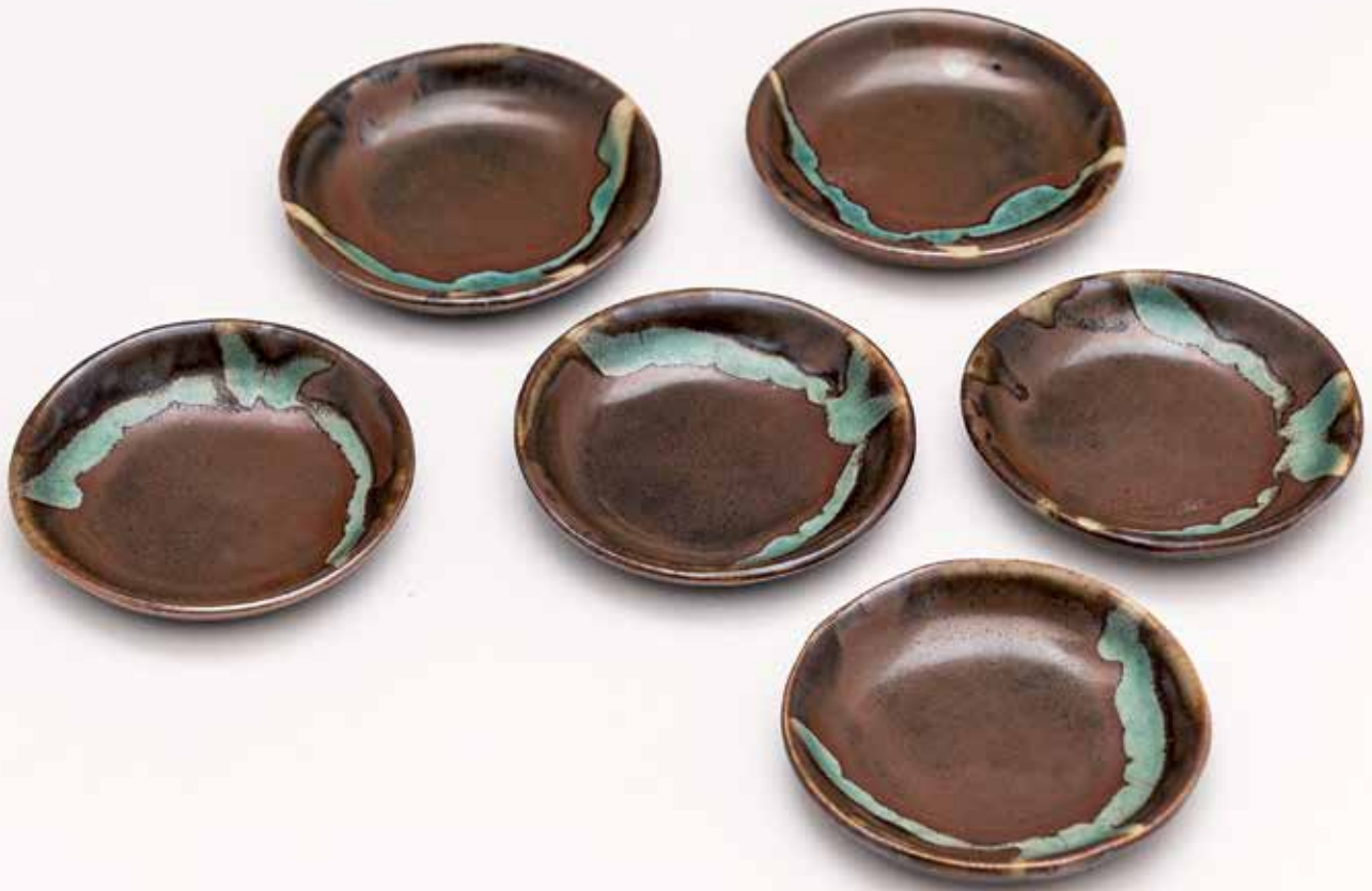
SET OF SIX SMALL PLATES KAKI GLAZE .5 x 3.75 x 3.75" EACH YH1068