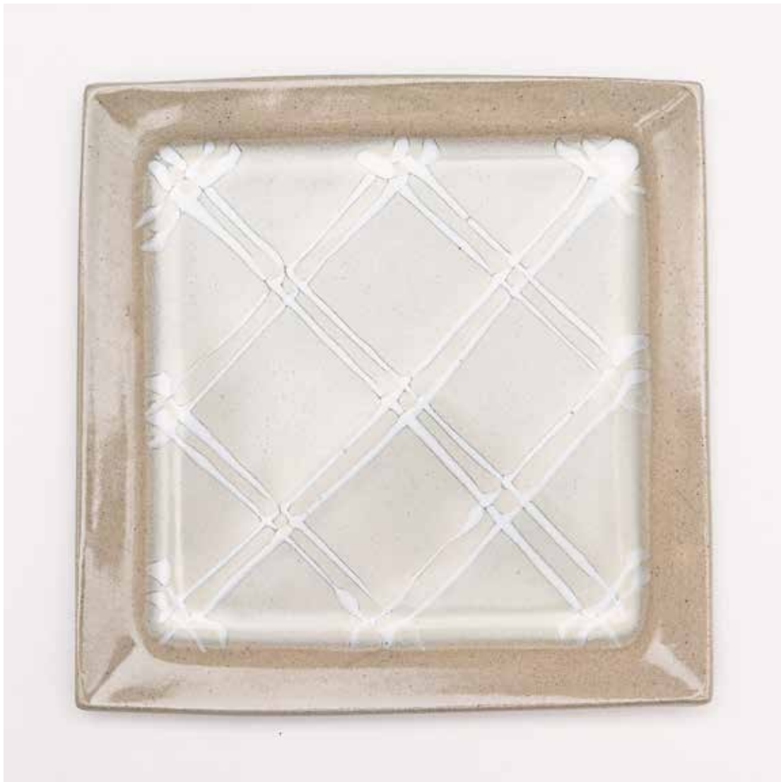
SQUARE PLATE WHITE NUKA GLAZE 1 x 9 x 9" YH1076