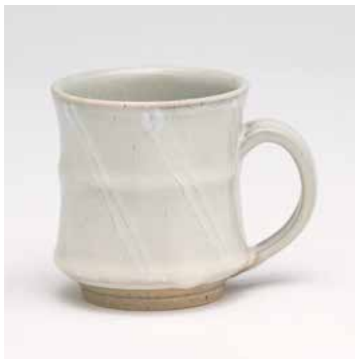
MUG WHITE NUKA GLAZE 3.75 x 4.5 x 3.25" YH1020