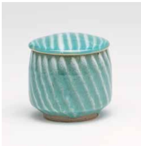
BOWL WITH A LID BLUE NUKA GLAZE 3.5 x 3.5 x 3.5" YH1007

Please visit www.puckergallery.com for a list of virtual gatherings and events accompanying Back to the Center .