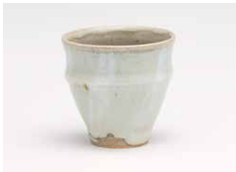
SAKE CUP WHITE NUKA GLAZE 2.5 x 2.5 x 2.5" YH1054