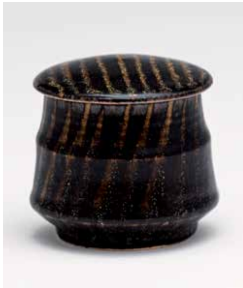
BOWL WITH A LID BLACK GLAZE 3.5 x 3.25 x 3.25" YH1009