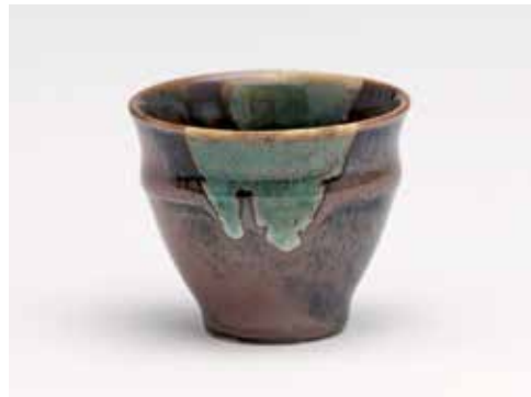
SAKE CUP KAKI GLAZE 2.25 x 3 x 3" YH1058