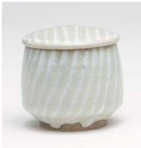
BOWL WITH A LID WHITE NUKA GLAZE 3.5 x 3.5 x 3.5" YH1005