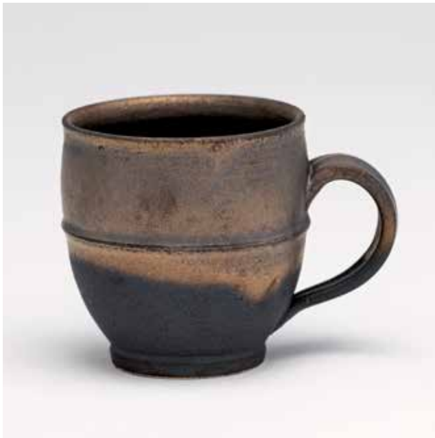
MUG COPPER GLAZE 3.5 x 4.5 x 3.5" YH1023