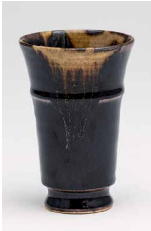
CUP BLACK GLAZE 5 x 3.5 x 3.5" YH1040