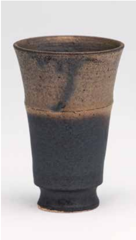
CUP COPPER GLAZE 5 x 3.5 x 3.5" YH1044