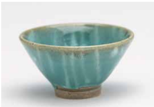
SAKE CUP BLUE NUKA GLAZE 1.75 x 3 x 3" YH1053