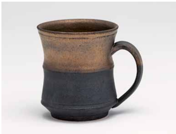
MUG COPPER GLAZE 4 x 4.5 x 3.5" YH1022