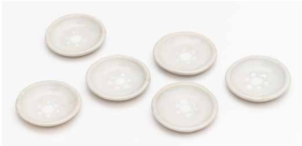
SET OF SIX MAMEZARA (VERY SMALL PLATES) WHITE NUKA GLAZE .5 x 2.75 x 2.75" EACH YH1074