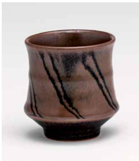
TEA BOWL KAKI GLAZE 3.5 x 3.25 x 3.25" YH1029