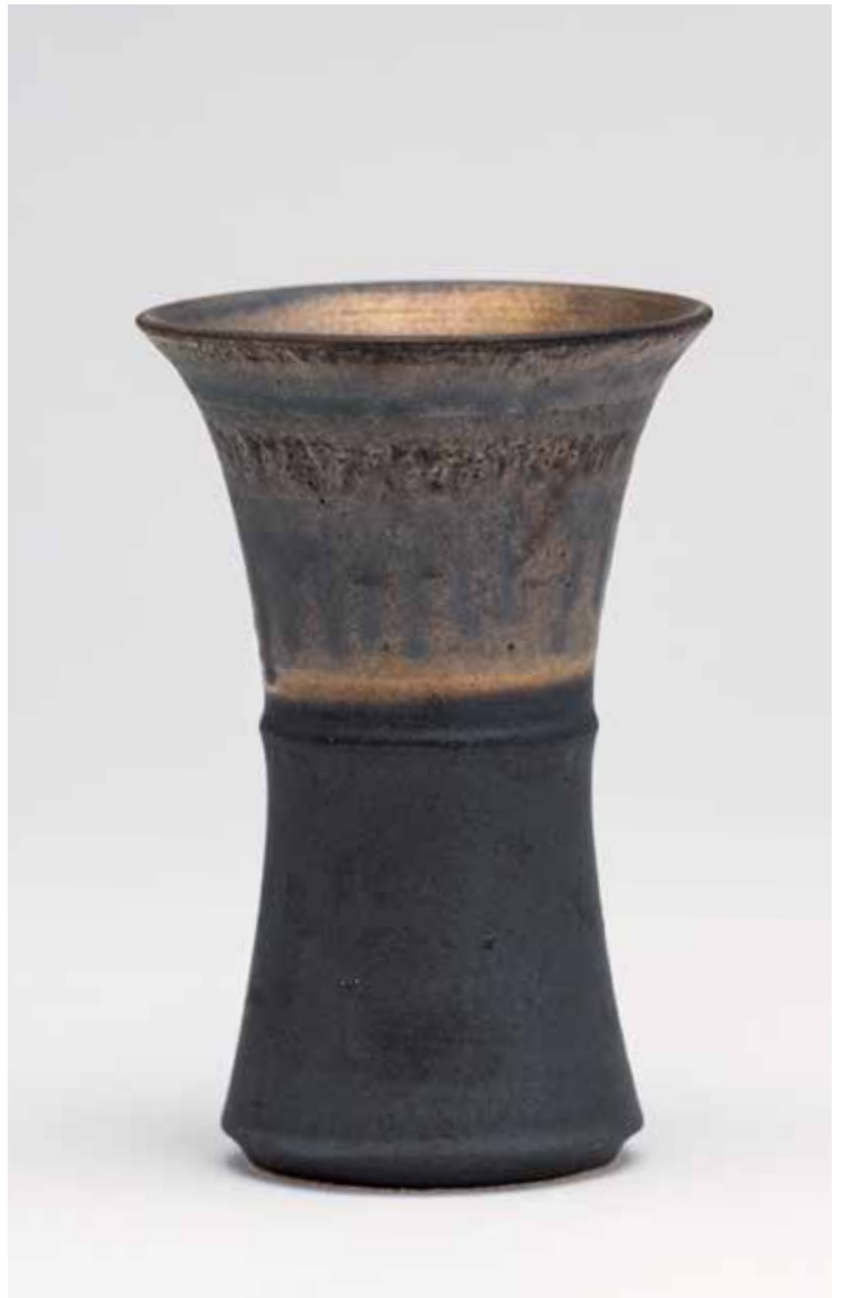
VASE COPPER GLAZE 7 x 4.75 x 4.75" YH983