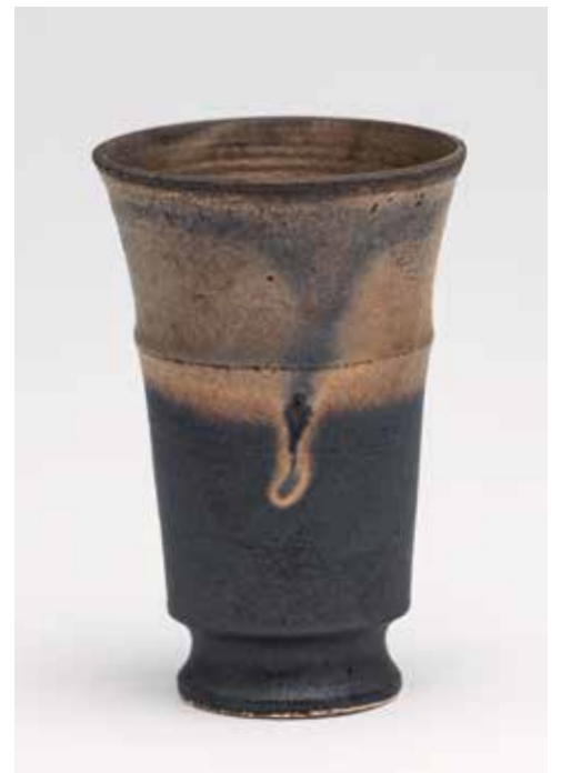
CUP COPPER GLAZE 5 x 3.5 x 3.5" YH1045