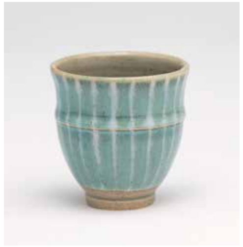
TEA BOWL BLUE NUKA GLAZE 3.5 x 3.25 x 3.25" YH1033