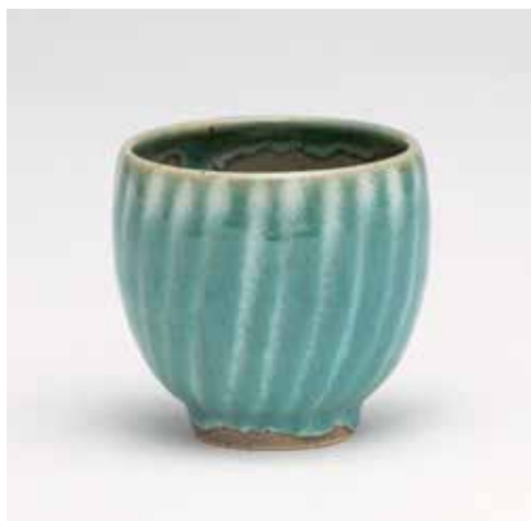
TEA BOWL BLUE NUKA GLAZE 3 x 3.25 x 3.25" YH1036