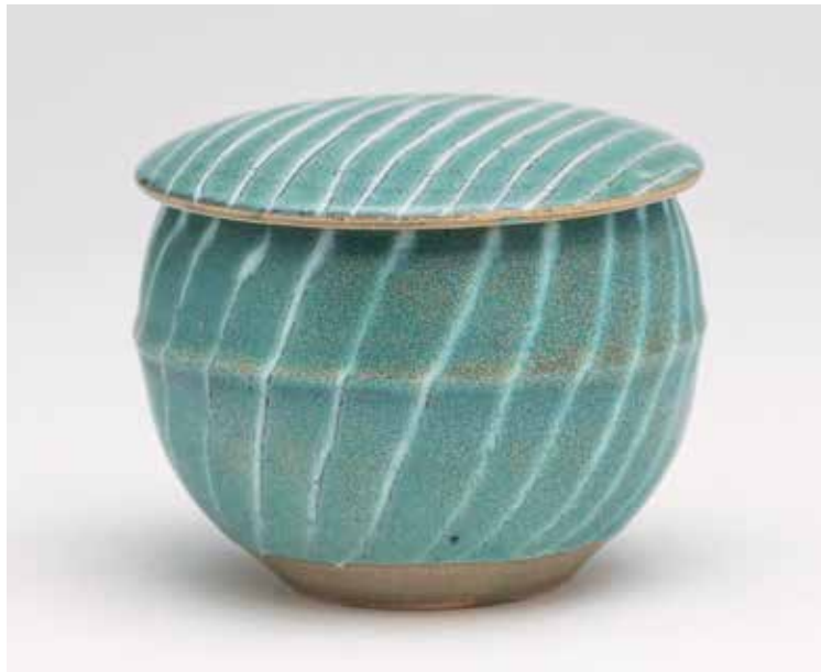
BOWL WITH A LID BLUE NUKA GLAZE 5.5 x 6.5 x 6.5" YH986