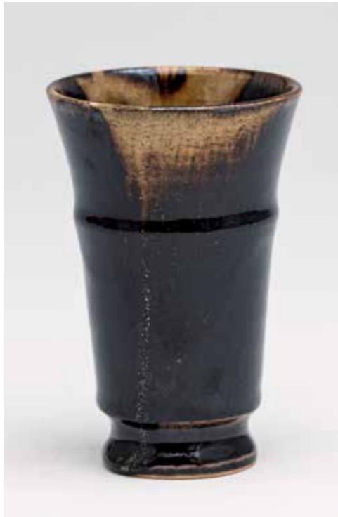
CUP BLACK GLAZE 5 x 3.25 x 3.25" YH1039