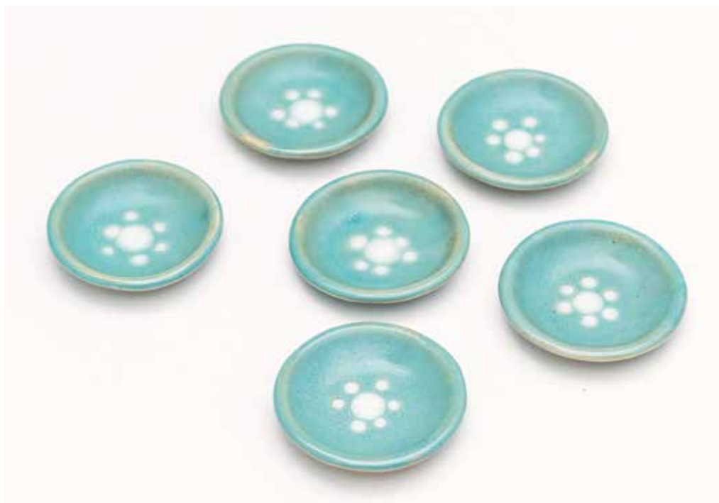
SET OF SIX MAMEZARA (VERY SMALL PLATES) BLUE NUKA GLAZE .5 x 2.5 x 2.5" EACH YH1075