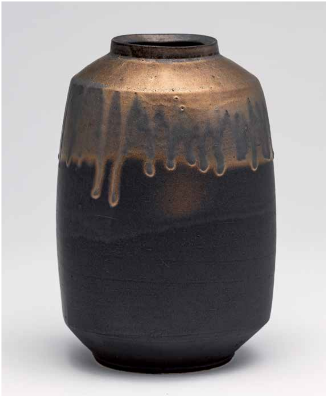
VASE COPPER GLAZE 11 x 7 x 7" YH974