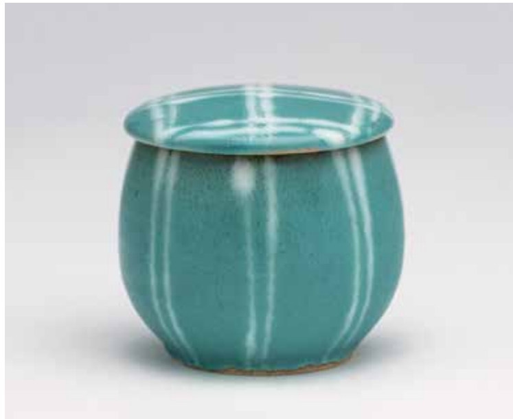
BOWL WITH A LID BLUE NUKA GLAZE 4.5 x 4.5 x 4.5" YH988