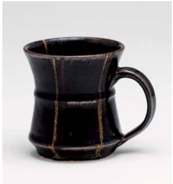
MUG BLACK GLAZE 3.5 x 5 x 4" YH1014