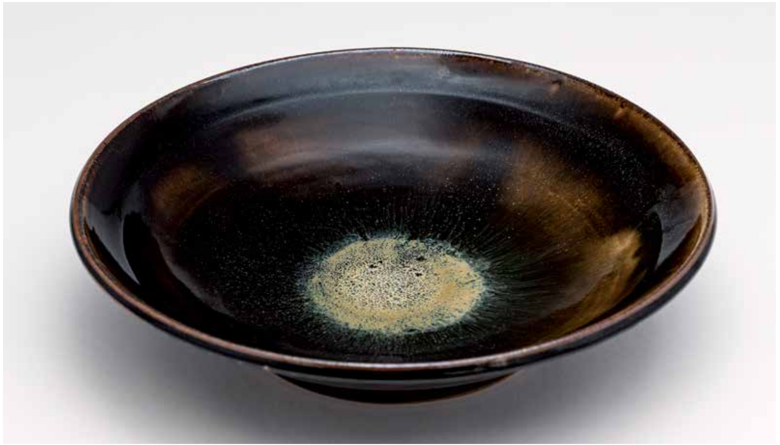
PLATE SCATTERED ASH 3.5 x 15 x 15" YH969