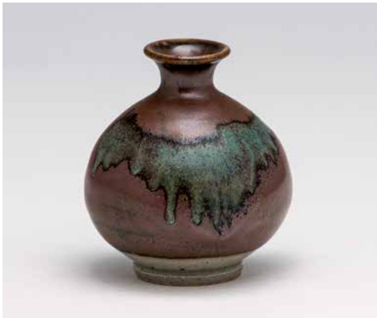
SINGLE FLOWER VASE KAKI GLAZE 4 x 3.5 x 3.5" YH993