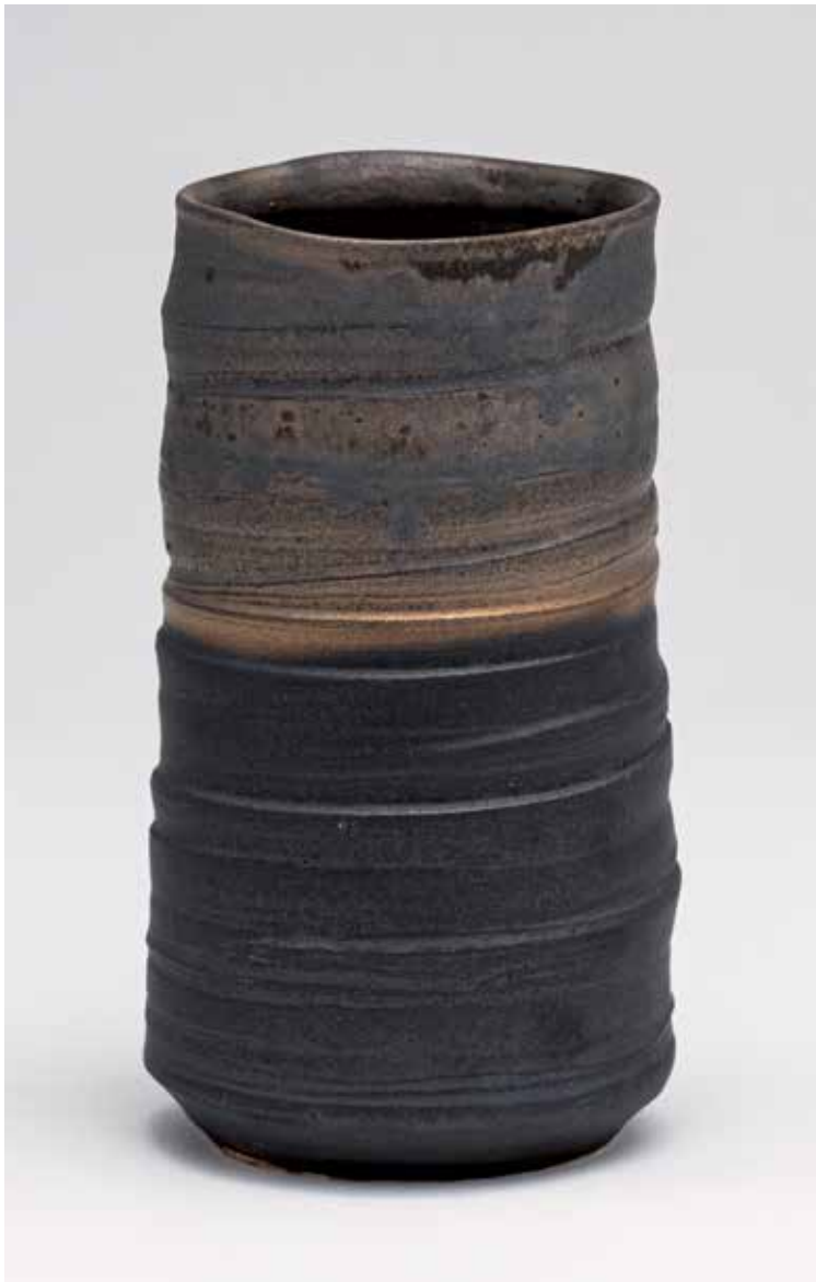
VASE COPPER GLAZE 9.25 x 4.5 x 4.5" YH981