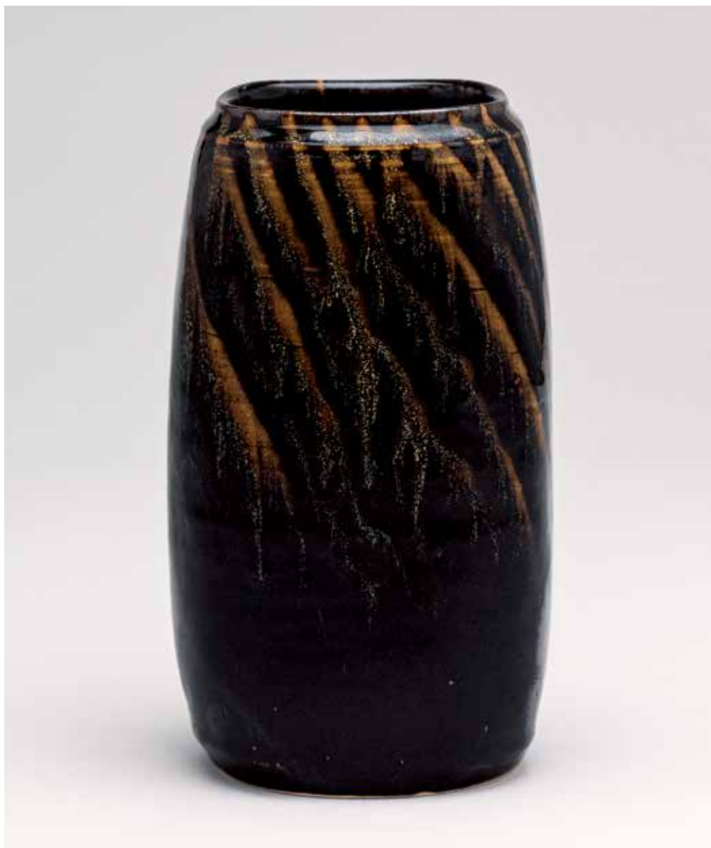
VASE BLACK GLAZE 10 x 5.5 x 5.5" YH976