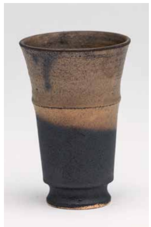
CUP COPPER GLAZE 5 x 3.5 x 3.5" YH1049