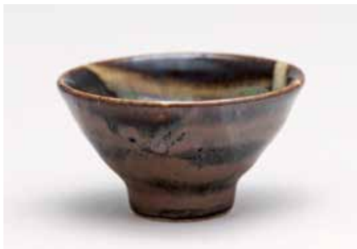
SAKE CUP KAKI GLAZE 1.75 x 3 x 3" YH1051