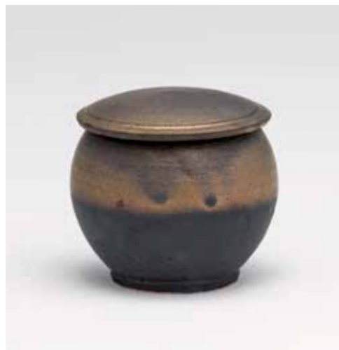
BOWL WITH A LID COPPER GLAZE 3.5 x 3.5 x 3.5" YH1003