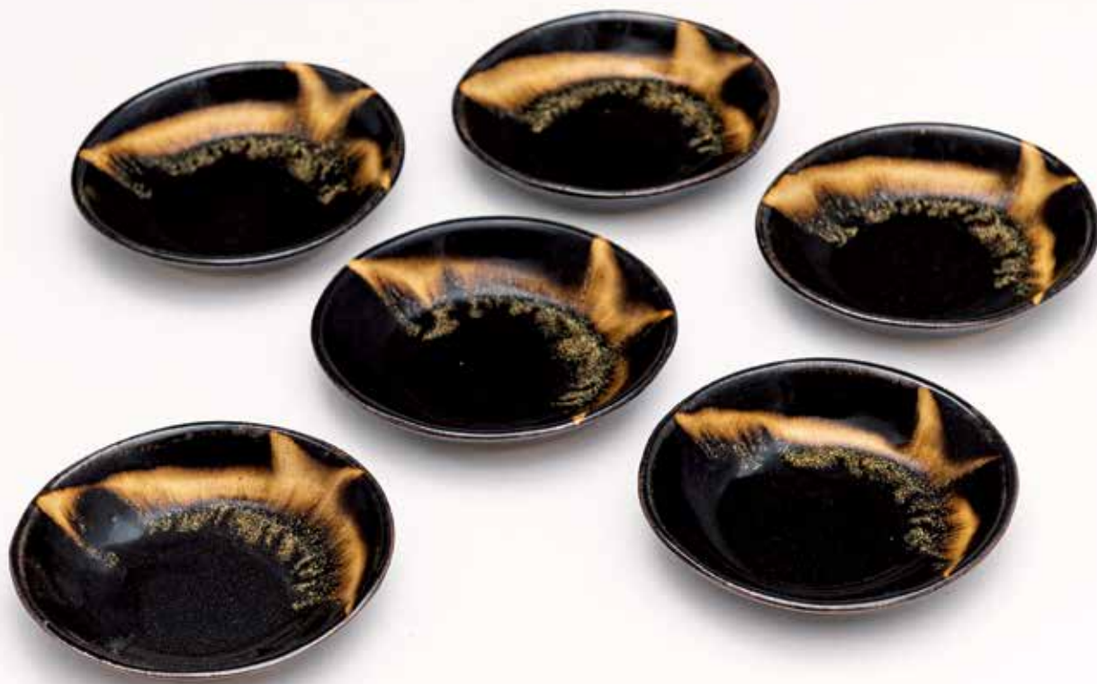
SET OF SIX OVAL PLATES BLACK GLAZE 1.25 x 6.25 x 5.5" EACH YH1000