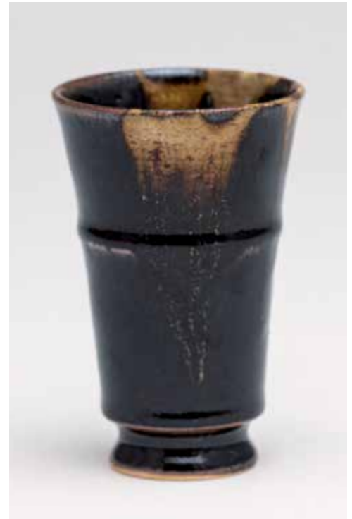
CUP BLACK GLAZE 5 x 3.25 x 3.25" YH1041