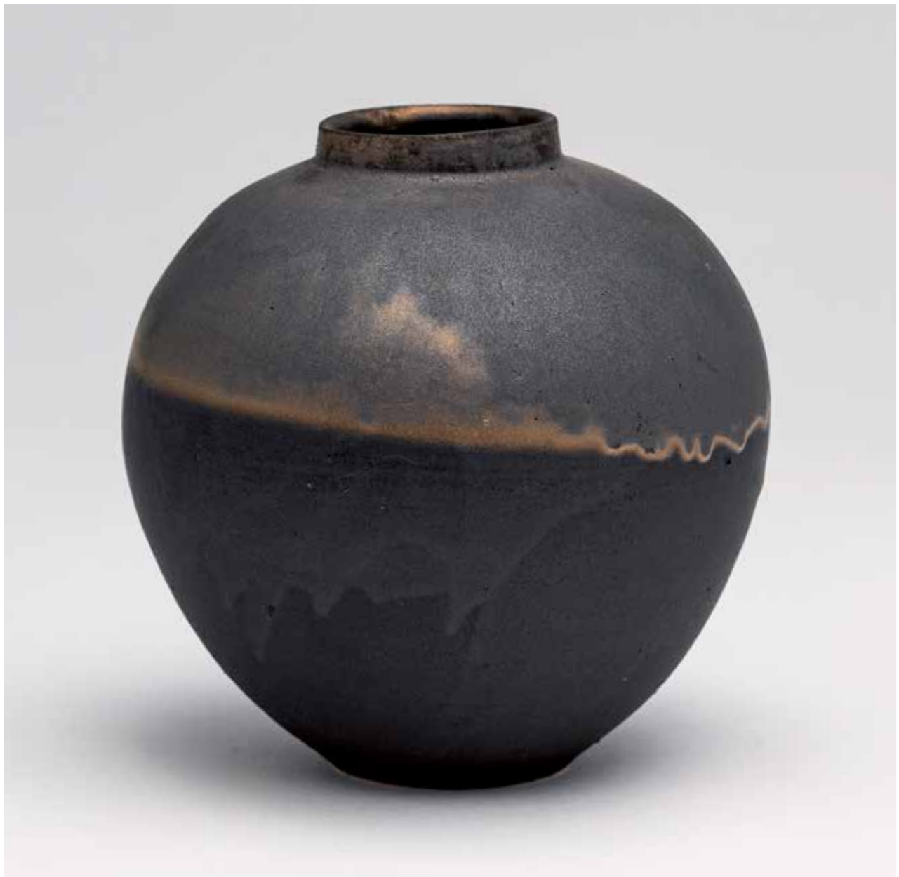
VASE COPPER GLAZE 8.5 x 8.75 x 8.75" YH978