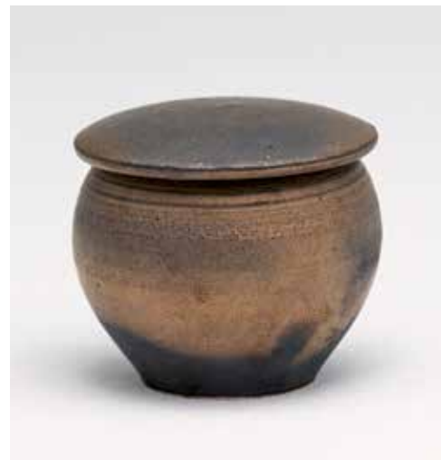
BOWL WITH A LID COPPER GLAZE 3.25 x 3.5 x 3.5" YH1001