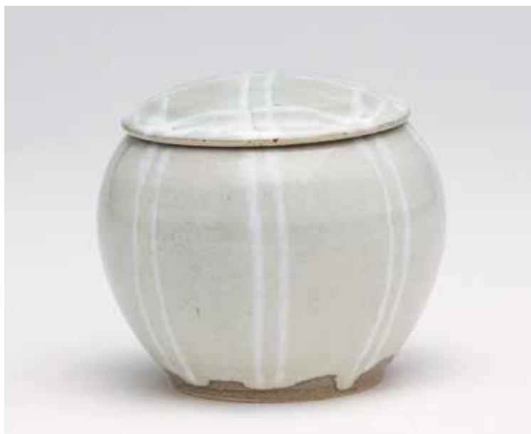
BOWL WITH A LID WHITE NUKA GLAZE 4.5 x 4.75 x 4.75" YH989