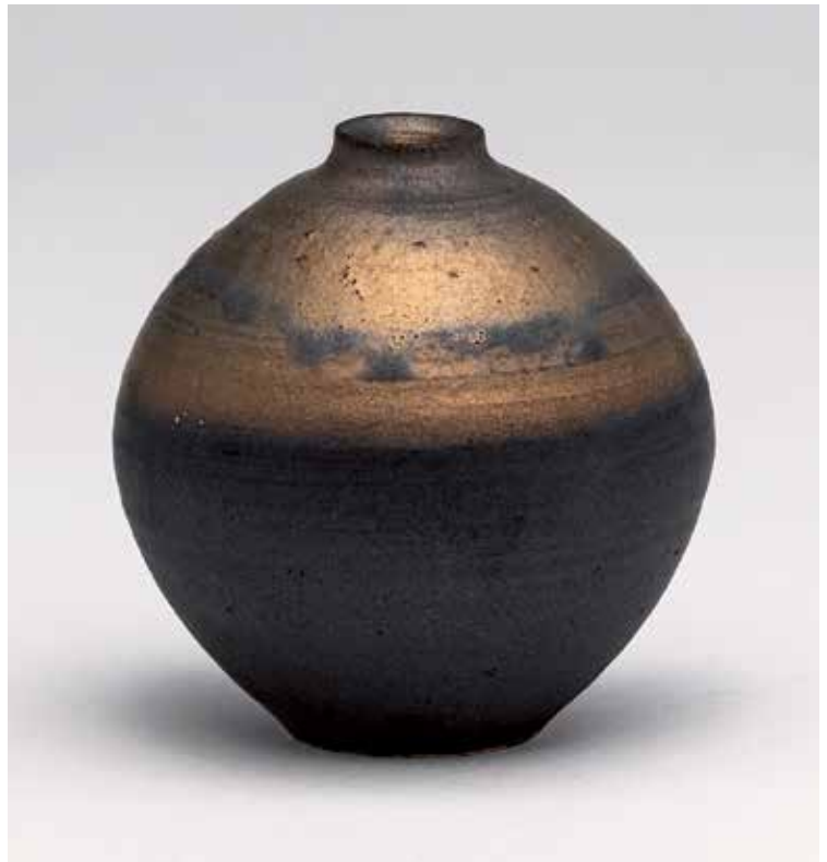
SINGLE FLOWER VASE COPPER GLAZE 4.25 x 4.25 x 4.25" YH997