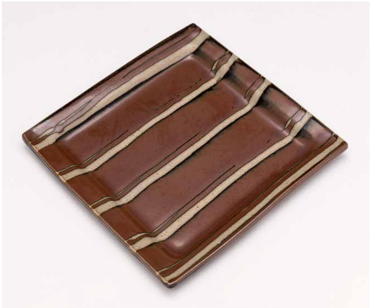
SQUARE PLATE KAKI GLAZE 1 x 9 x 9" YH1083