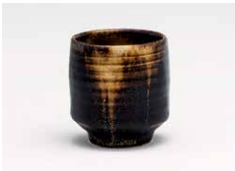
SAKE CUP BLACK GLAZE 2.75 x 2.5 x 2.5" YH1055