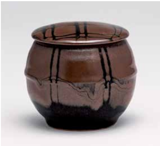
BOWL WITH A LID KAKI GLAZE 3.75 x 4.25 x 4.25" YH987