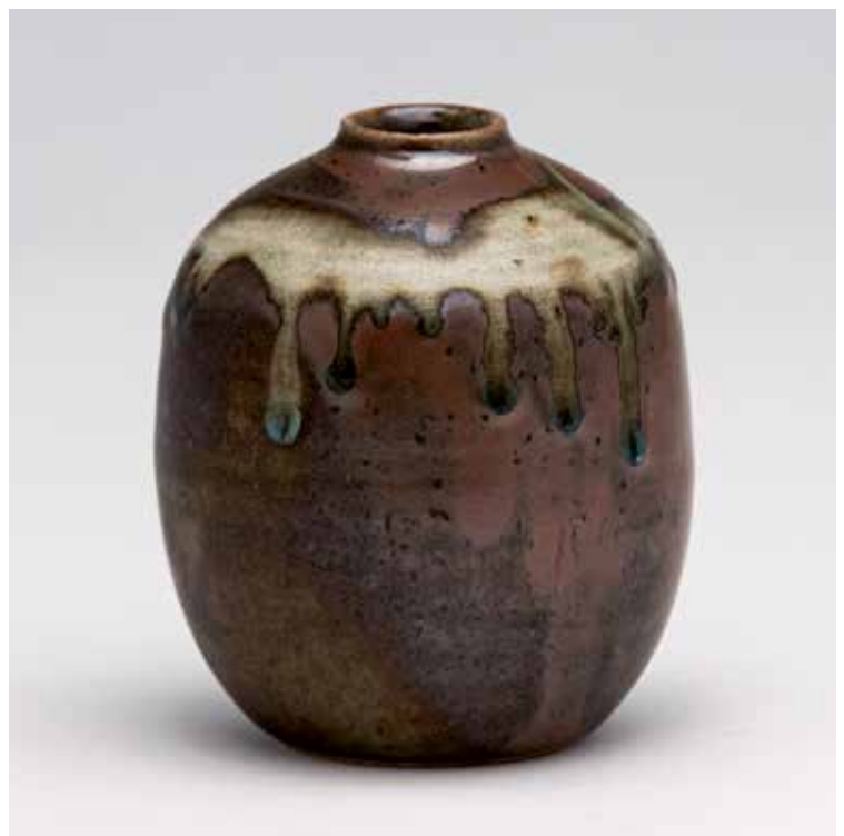
SINGLE FLOWER VASE KAKI GLAZE 4.75 x 4 x 4" YH991