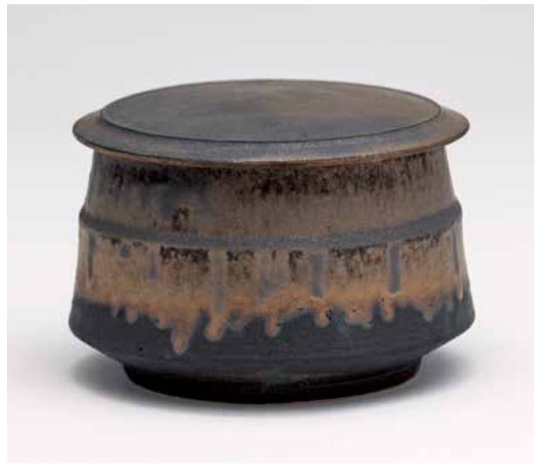
BOWL WITH A LID COPPER GLAZE 4.5 x 6.25 x 6.25" YH984