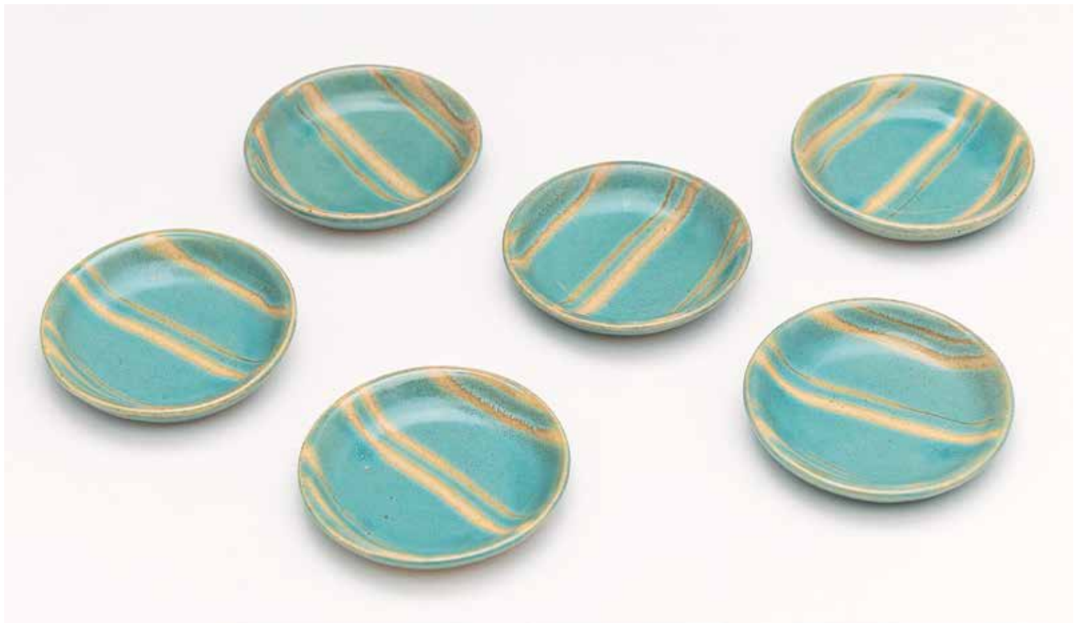
SET OF SIX SMALL PLATES BLUE NUKA GLAZE .5 x 4 x 4" EACH YH1066