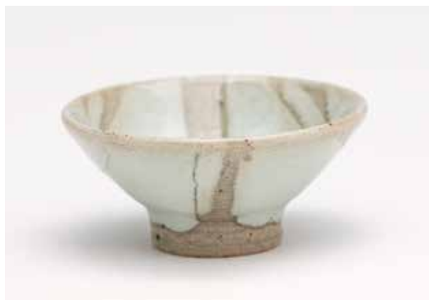
SAKE CUP WHITE NUKA GLAZE 1.5 x 3.25 x 3.25" YH1050