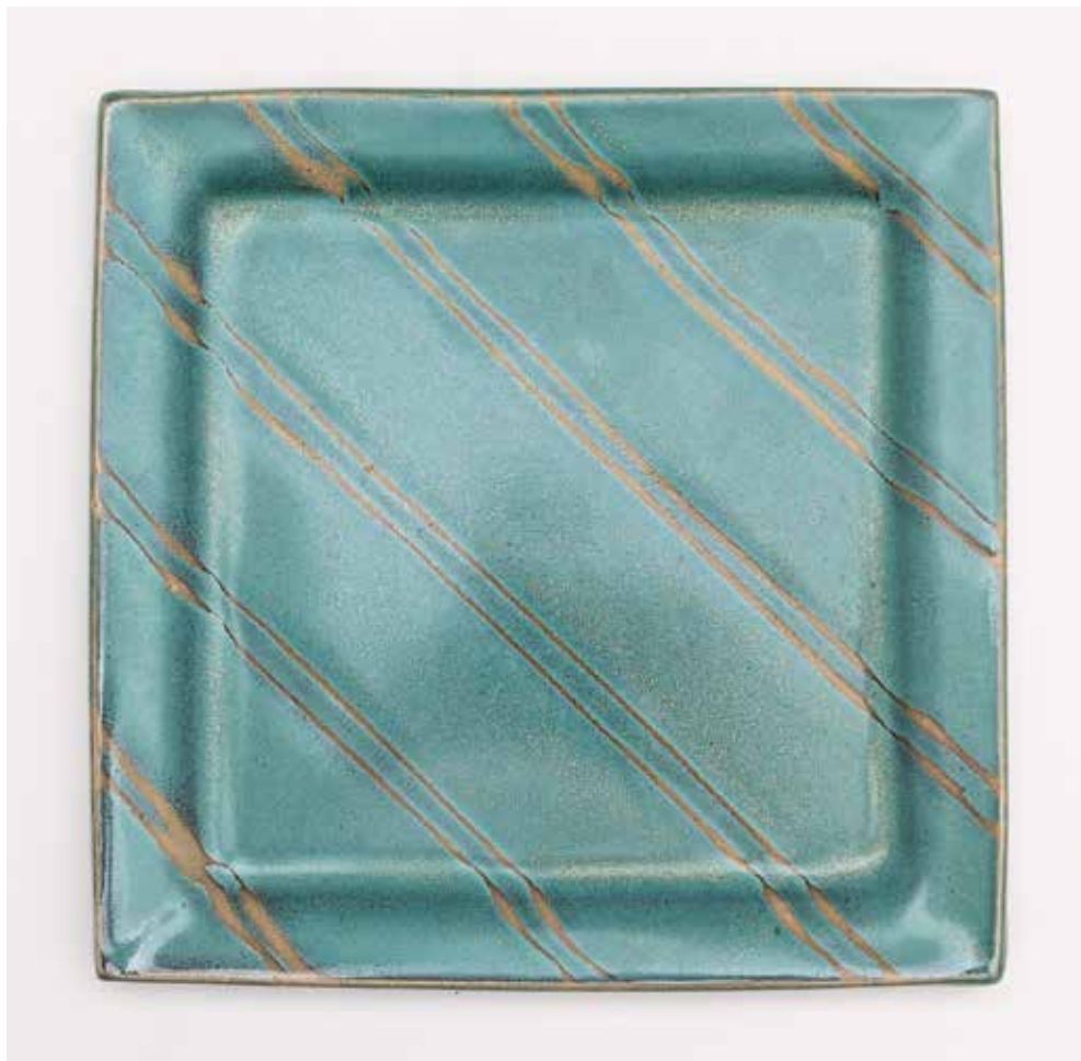
SQUARE PLATE BLUE NUKA GLAZE 1 x 9 x 9.25" YH1080