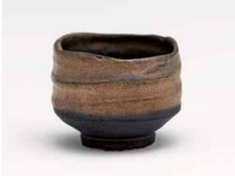
SAKE CUP COPPER GLAZE 2 x 2.5 x 2.5" YH1059