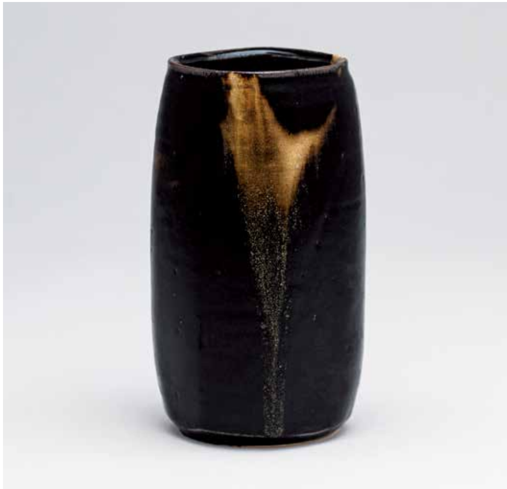
VASE BLACK GLAZE 8.75 x 4.5 x 4.5" YH982