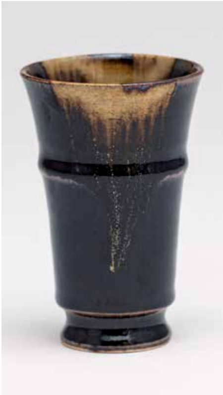
CUP BLACK GLAZE 5 x 3.25 x 3.25" YH1038