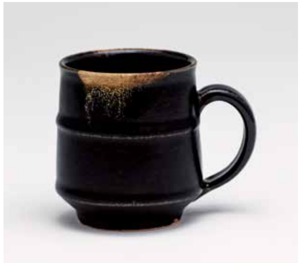
MUG BLACK GLAZE 3.75 x 4.5 x 3.25" YH1017