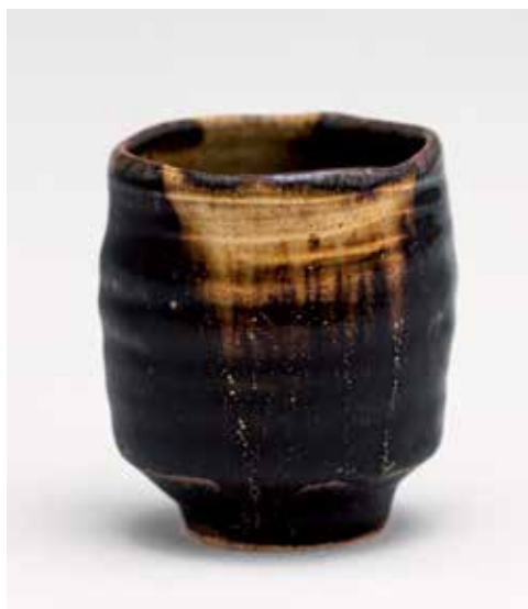
SAKE CUP BLACK GLAZE 3 x 2.5 x 2.5" YH1056