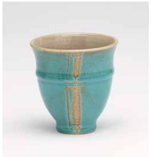
TEA BOWL BLUE NUKA GLAZE 3.5 x 3.5 x 3.5" YH1035