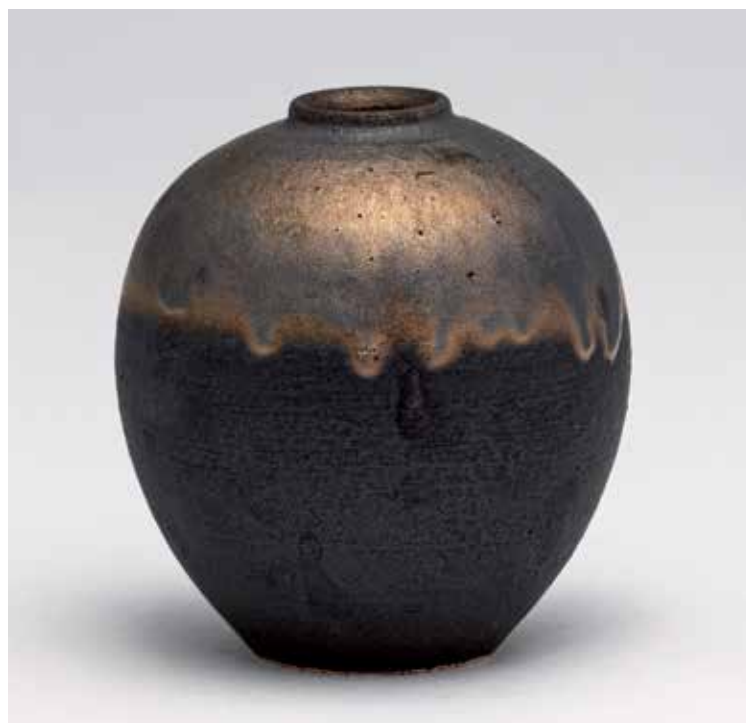
SINGLE FLOWER VASE COPPER GLAZE 4.5 x 4 x 4" YH996