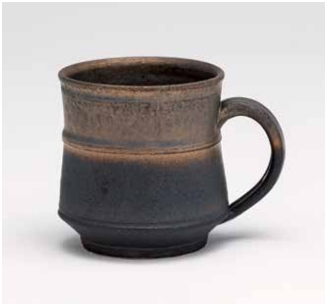
MUG COPPER GLAZE 3.5 x 4.5 x 3.5" YH1025