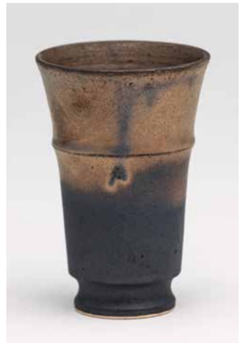
CUP COPPER GLAZE 5 x 3.5 x 3.5" YH1046