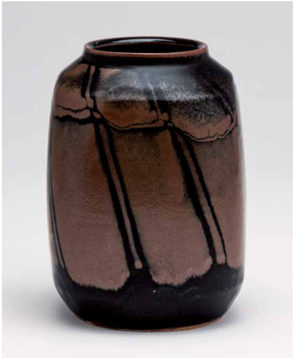
VASE KAKI GLAZE 9 x 6 x 6" YH977