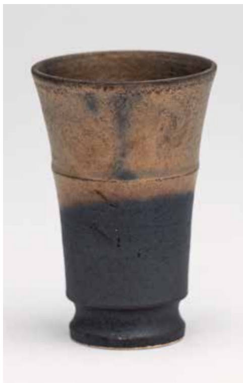
CUP COPPER GLAZE 5.25 x 3.5 x 3.5" YH1048