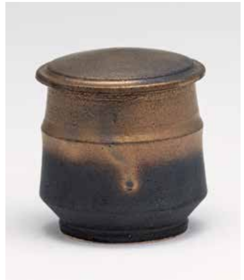
BOWL WITH A LID COPPER GLAZE 3.75 x 3.25 x 3.25" YH1002