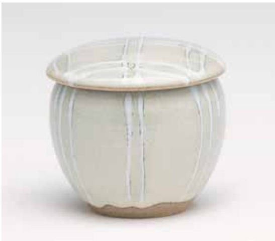
BOWL WITH A LID WHITE NUKA GLAZE 3.25 x 3.5 x 3.5" YH1004