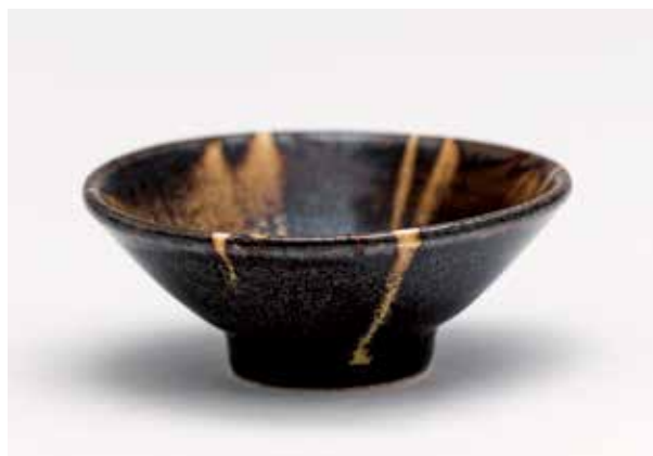
SAKE CUP BLACK GLAZE 1.25 x 3.25 x 3.25" YH1052