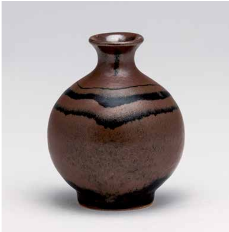
SINGLE FLOWER VASE KAKI GLAZE 4.25 x 3.5 x 3.5" YH994