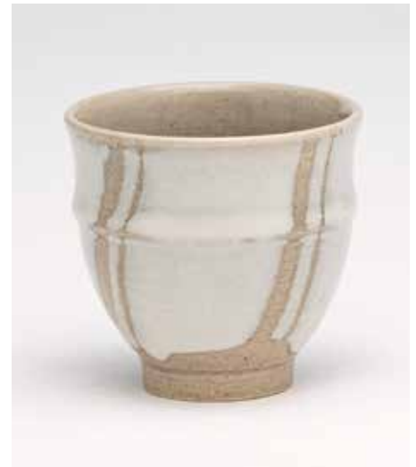
TEA BOWL WHITE NUKA GLAZE 3.25 x 3.5 x 3.5" YH1031