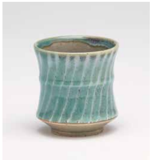
TEA BOWL BLUE NUKA GLAZE 3.25 x 3.25 x 3" YH1034