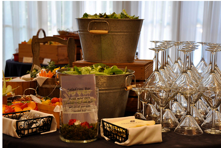
The Salad-tini Bar at the Farm to Fork dinner was a huge hit for guests.

In 2017 the Trust made a number of substantive efforts to enhance its public profile and to reach a broader audience in greater Licking County. The Trust's signature event continues to be the Farm to Fork dinner (3rd annual). An evening of wonderful conversation, exquisite local foods, and a wide variety of silent auction items entertained 110 guests. This event, in addition to being an excellent promotional opportunity for the Trust, raised nearly $14,000 in support of Trust activities.