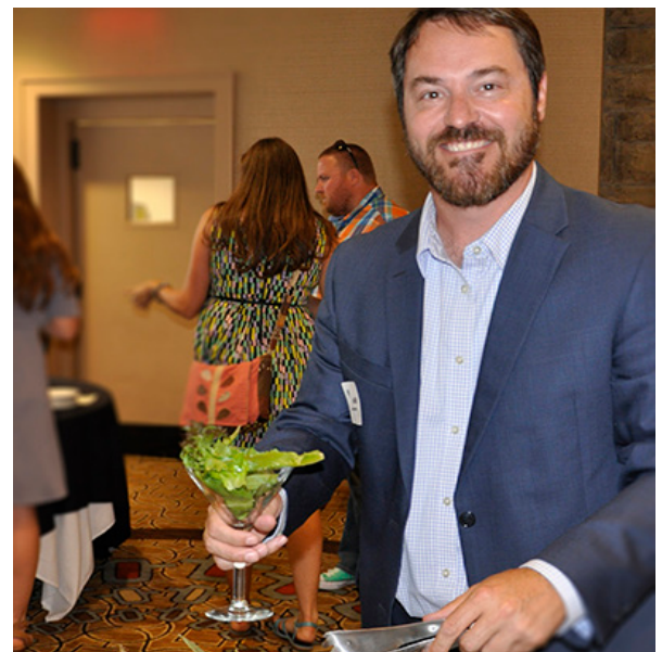
Fun at Farm to Fork!