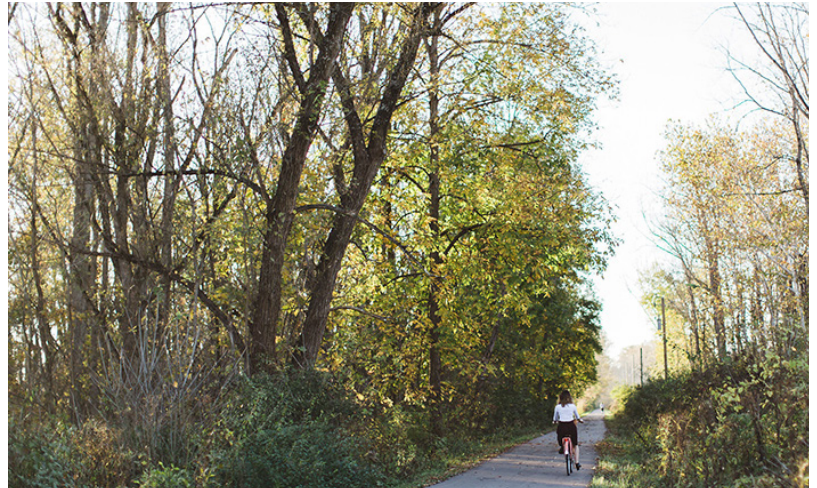
Enjoying a ride along the Hill Wetland Reserve near Bicentennial Park in Granville Township.

Best stewardship practices include being a good neighbor to those who border