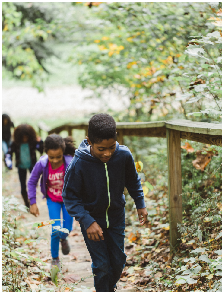
Involving young future Land Trust members at a hike at Spring Valley.

Friends of land conservation continued their enthusiastic support of the Trust's mission and activities in 2017, joining for the first time or renewing memberships, providing donations and gifts, and participating in the Trust's activities and fundraising initiatives.