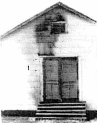
WILLIAM CHANEY CHURCH IN RULEVILLE, the site of voter registration meetings sponsored by SNCC, was damaged by fire on June 25.

Jackson, July 10 - FBI director J. Edgar Hoover told newsmen the FBI would give "no protection" to civil rights workers.