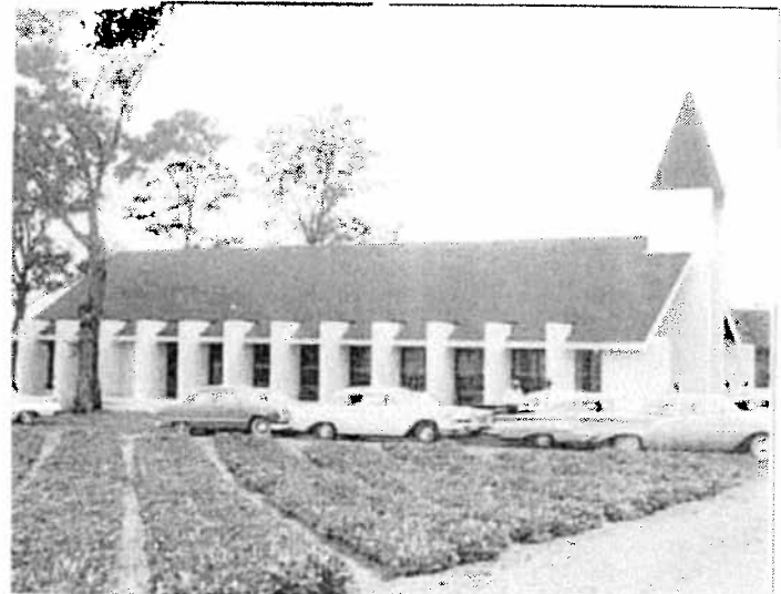
THE NEW MOUNT OLIVE BAPTIST CHURCH in Sasser, Georgia was re-dedicated two weeks ago. The church - and two others near here - were burned down by nightriders two years ago while SNCC was using them for voter registration meetings.