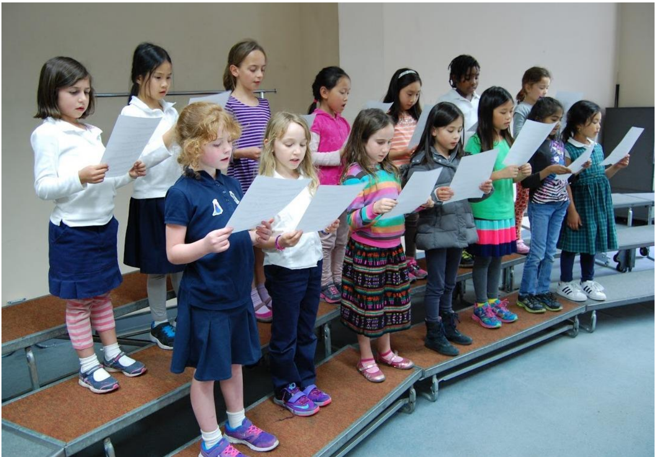
Young choristers in rehearsal during Preparatory Camp at the Kanbar Center

Since our founding in 1978, SFGC has been committed to the principle that no girl should be prevented from Chorus participation because of her family's financial circumstances. During 2015-16, SFGC awarded a total of $120,000 in financial assistance to 109 choristers. Of these, 60% received scholarships for half or more of their tuition or summer music camp fees, and 14% of all choristers received 100% financial aid.