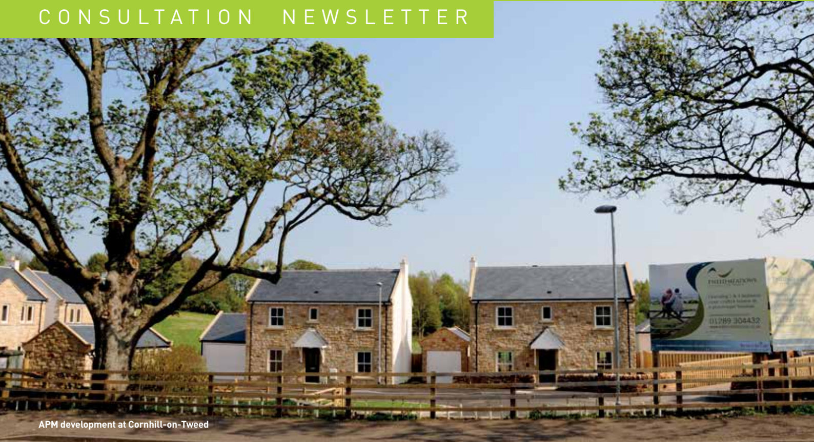
APM development at Cornhill-on-Tweed

Dear Resident, APM services Ltd is a locally based company involved in promoting land for residential development on behalf of the landowners. Previous developments include small to medium sized housing schemes in Camber, Rye; St Ives, Cornwall; Berwick, Northumberland and the Yorkshire Dales, all of which were built sensitively, utilising local materials to ensure homes in character with their surrounding natural landscape.