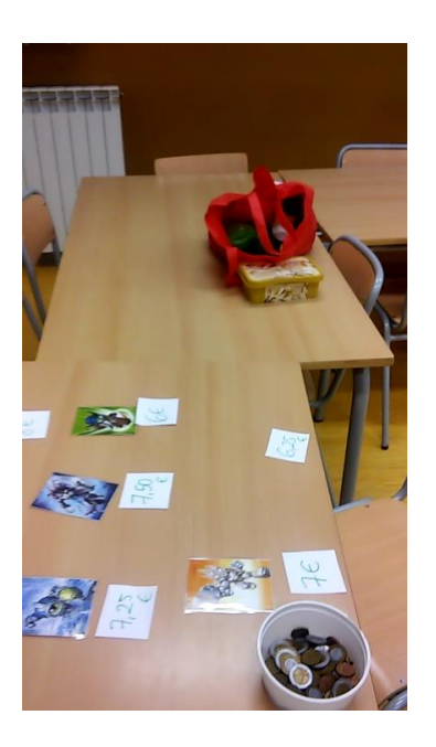
Figure 3. Skylander shop.

The third experience was related to creating experience-based activities. Diego enjoyed "Skylanders" a lot. The auxiliary teacher and I created a small shop where Diego had different kinds of Skylander characters he had to buy (see Figure 3). So, he learnt the structures Good..., Could\ I\ have... , please?, How\ much\ is\ it? and how to do maths in English by handing over money and getting the proper change back. To check if he could remember vocabulary from previous years, the Skylander characters were replaced with different kinds of food he had to buy. Diego performed outstandingly.