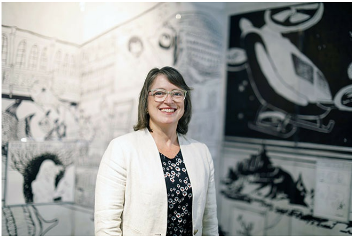
Dean, College of Arts and Letters, CSULA