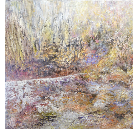
Winter Solstice , 2015, Oil on canvas, 40 x 40 in. Private collection.