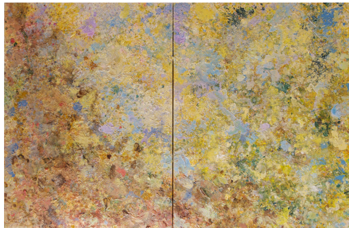
Shangri La 6 , 2017, Acrylic on canvas, 48 x 72 in.