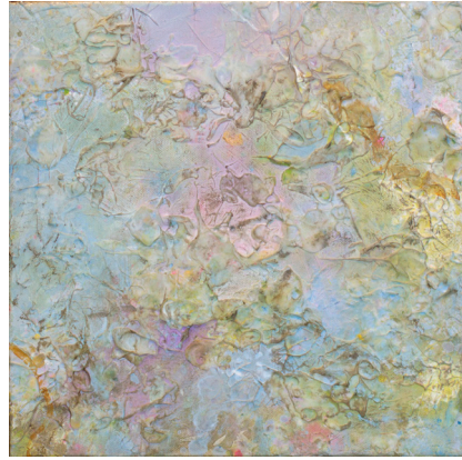
Shangri La Mosaic 5 , 2017, Acrylic on canvas, 12 x 12 in.