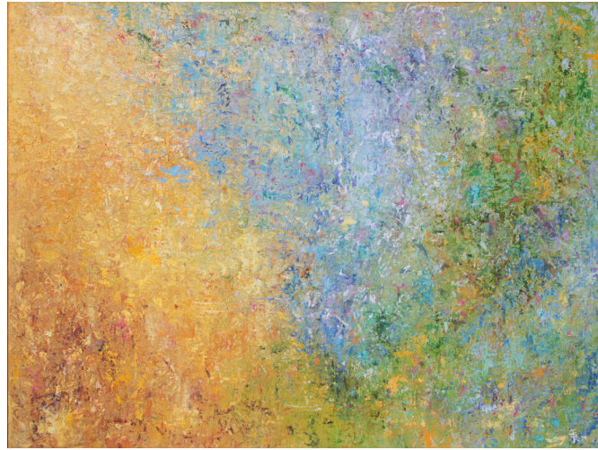
Shangri La 2 , 2014, Oil on canvas, 30 x 40 in. Private collection.