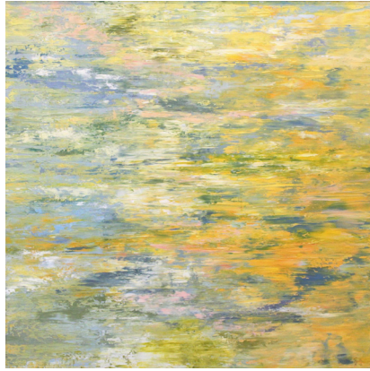
Silky Paths , 2012, Oil on canvas, 40 x 40 in.