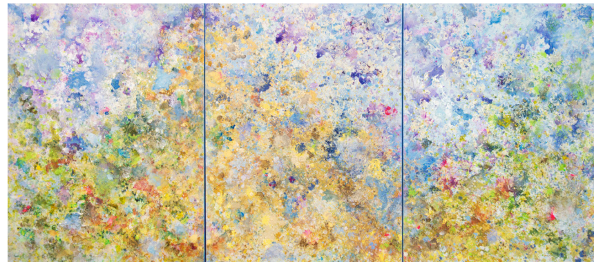
Shangri La 4 , 2017, Acrylic on canvas, 48 x 108 in.