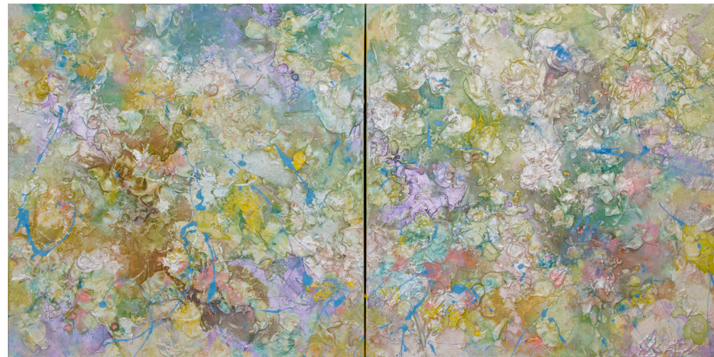
Shangri La 8 , 2018, Acrylic on canvas, 24 x 48 in.