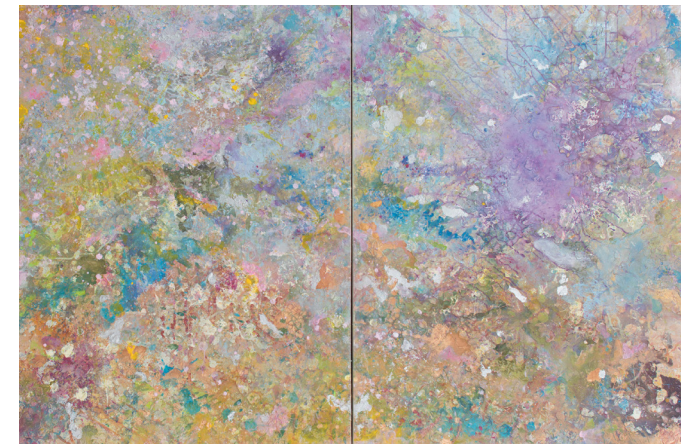
Shangri La 3 , 2017 Acrylic on canvas, 48 x 72 in. Private collection.

425 MOUNT PLEASANT AVENUE SECOND FLOOR MAMARONECK, NY 10543