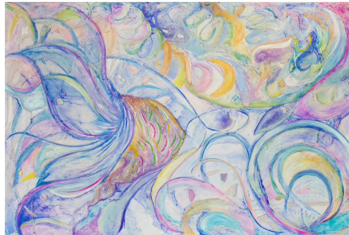
Rainbow Fish , 2018, Acrylic on canvas, 48 x 72 in (121.9 x 182.9 cm). Framed: 50 x 74 in (127.0 x 188.0 cm).