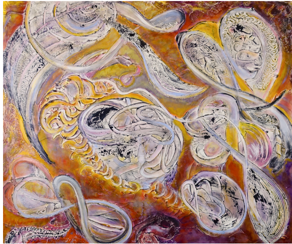
Translucence , 2019, Acrylic on canvas, 60 x 72 in (152.4 x 182.9 cm). Framed: 62 x 74 in (157.5 x 188.0 cm).