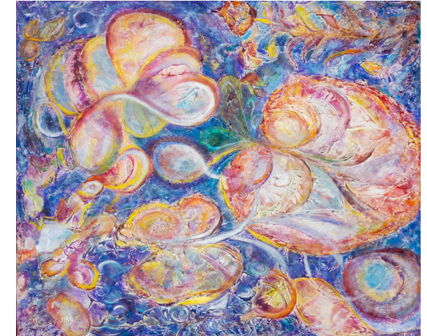
Madame Butterfly , 2019 Acrylic on canvas, 60 x 72 in (152.4 x 182.9 cm). Framed: 62 x 74 in (157.5 x 188.0 cm).