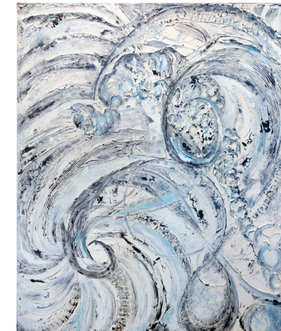
Windswept , 2019, Acrylic on canvas, 72 x 60 in (182.9 x 154.2 cm). Framed: 74 x 62 in (188.0 x 157.5 cm).