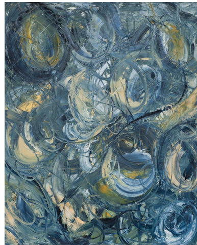
Typhoon , 2012, Oil on canvas, 30 x 24 in (76.2 x 61.0 cm). Framed: 32 x 26 in (81.3 x 66.0 cm).