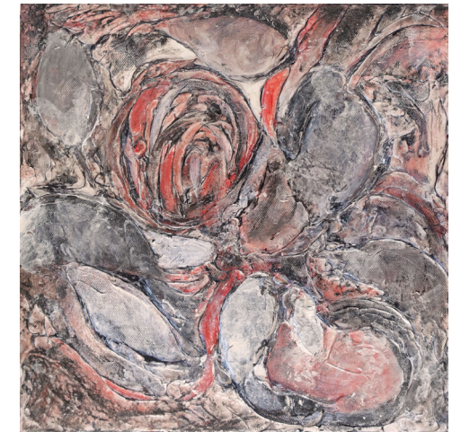
Fire Coral Red 4 , 2017, Acrylic on canvas, 12 x 12 in (30.5 x 30.5 cm). Framed: 14 x 14 in (35.6 x 35.6 cm).

425 MOUNT PLEASANT AVENUE SECOND FLOOR MAMARONECK, NY 10543