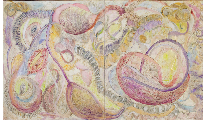
Dance of the Caterpillars , 2018, Acrylic on canvas, 72 x 120 in (182.88 x 304.8 cm). 2 panels, 72 x 60 in (182.9 x 154.2 cm) each. Framed: 74 x 62 in (188.0 x 157.5 cm).