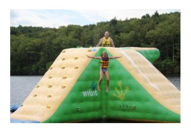
And as long as your spirit soars There are endless possibilities.....

https://www.theredhandfiles.com/communication-dream-feeling/