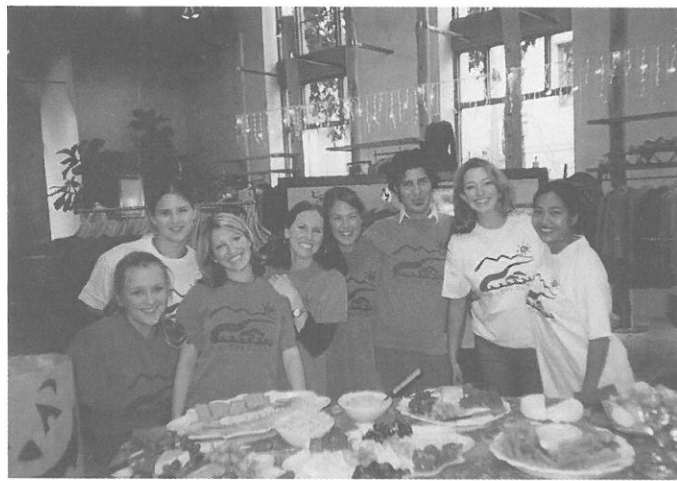
–The happy crew at Anthropologie