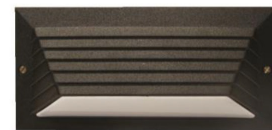
PICASSO BRICK MAILMAN