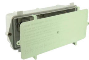
INSTALLATION PLATE (Optional)