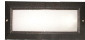
PICASSO BRICK OPAL