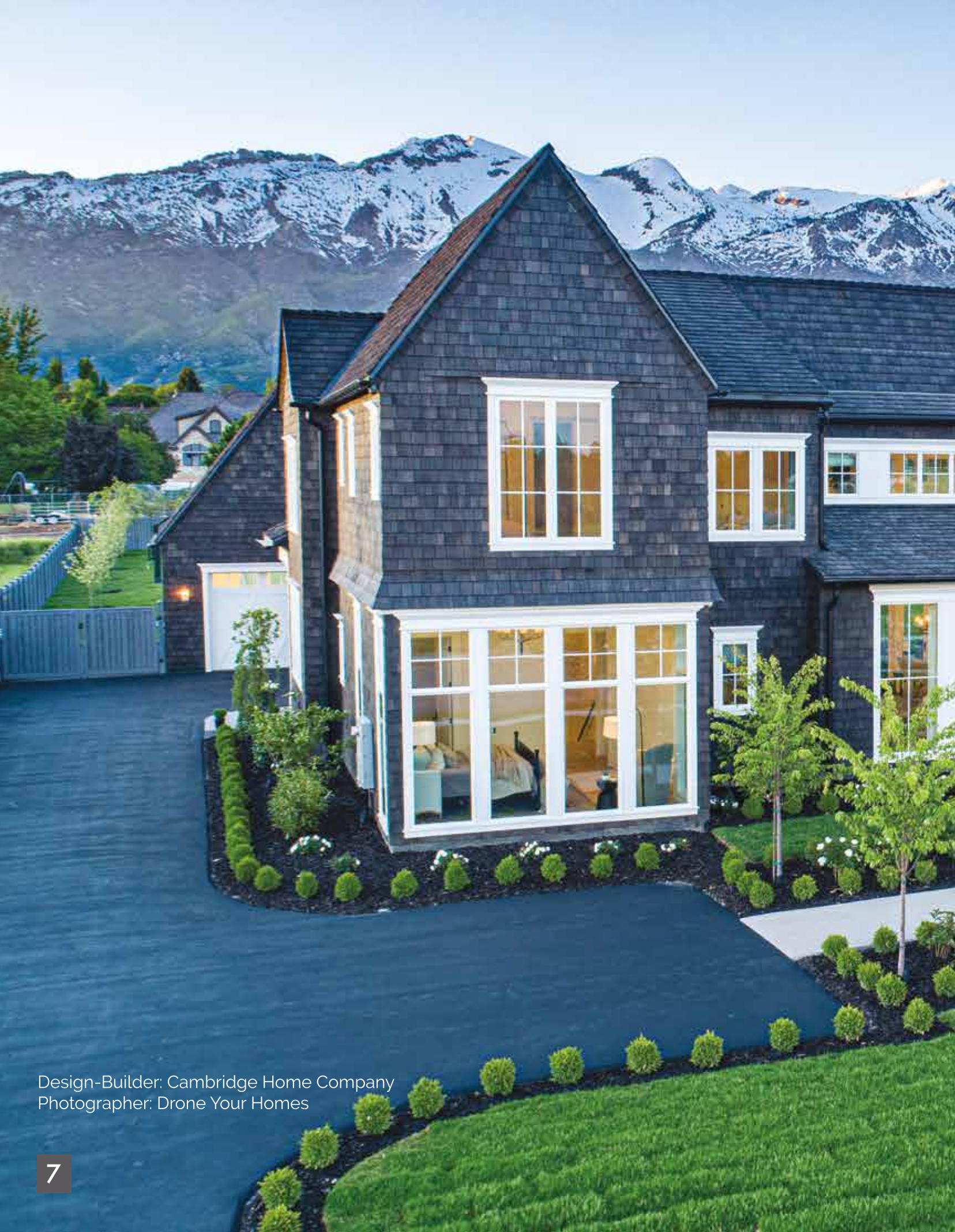
Design-Builder: Cambridge Home Company