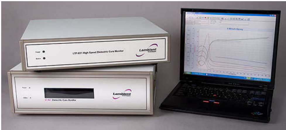
LT-451 / LTF-631 Dielectric Cure Monitors with CureView Software

Lambient Technologies' instruments, software and sensors are designed for maximum flexibility and ease of use. Together these products form an integrated system for studying composites and using the results to optimize the final product.