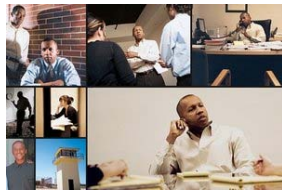
The Disgrace of Our Criminal Justice David Cole