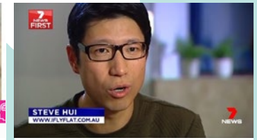
7 News Sydney