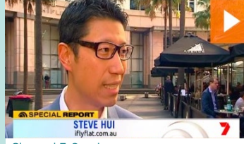
Channel 7, Sunrise