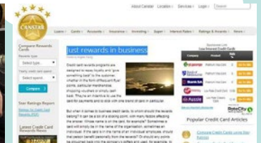
Canstar - Rewards in Business