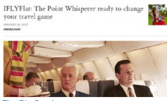
The Big Smoke