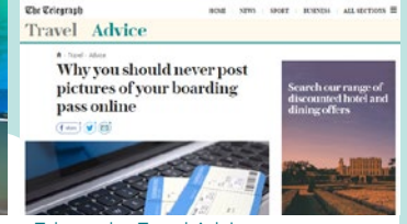
Telegraph - Travel Advice