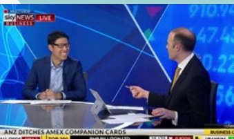
Sky News Business (Live)