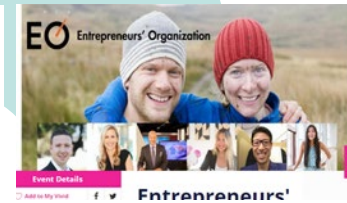
Entrepreneur's Organization Panel Speaker