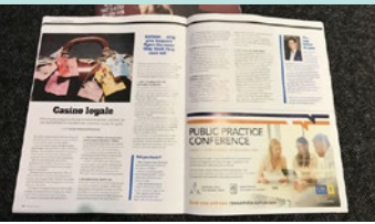
CPA In The Black