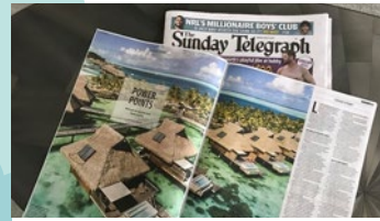
Sunday Telegraph - Escape