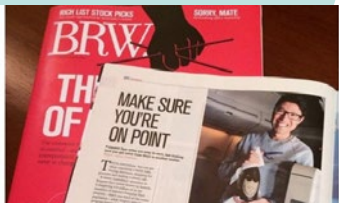
BRW "Ready for takeoff"