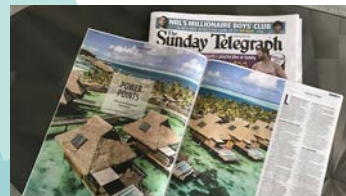
Sunday Telegraph - Escape