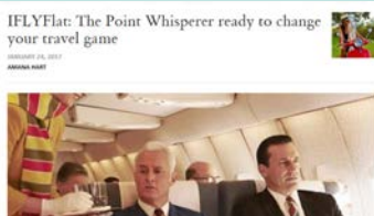
The Big Smoke