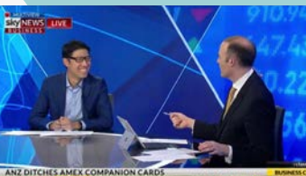
Sky News Business (Live)