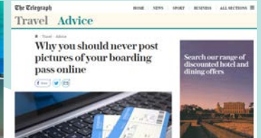
Telegraph - Travel Advice