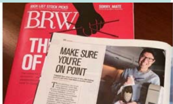
BRW "Ready for takeoff"