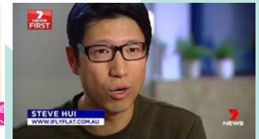
7 News Sydney