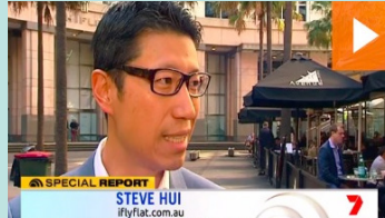
Channel 7, Sunrise