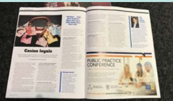
CPA In The Black