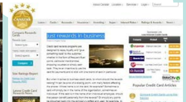
Canstar - Rewards in Business