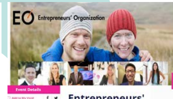
Entrepreneur's Organization Panel Speaker