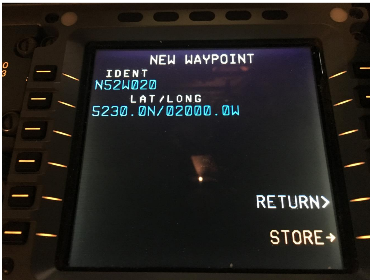
Figure 1. Example FMC Display: Full Waypoint Latitude and Longitude (13-characters) inserted into FMC

Note: Figure 1 and Figure 2 are intended to support paragraph 5.2 (Pilot training on Map and FMC Displays of ½ and Whole Degree Waypoints). The figures emphasize that for a large number of aircraft, the input of waypoints containing whole degrees of latitude and waypoints containing half-degrees of latitude will result in identical 7-character FMC and waypoint map displays.