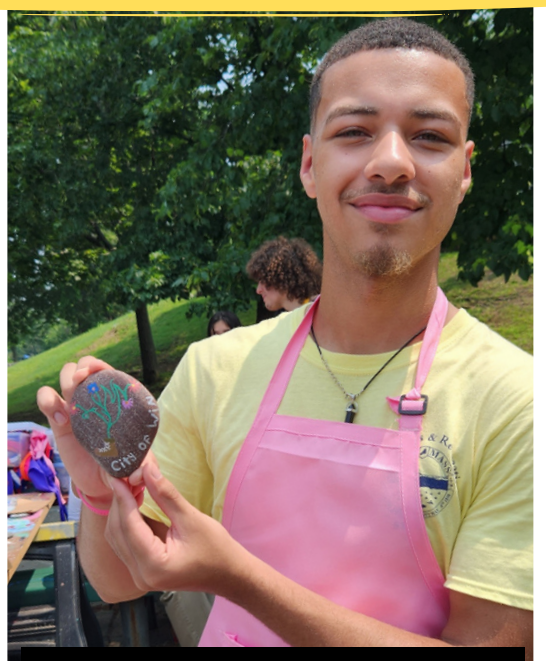
Lynn community member posing with his "City of Win" painted rock created during the "Reflections of our City" project this summer.

This summer, RAW Chiefs led a citywide collaborative art project called "Reflections of our City." The group invited Lynners to create art using mirrors, rocks, and paint to inspire positive reflections and uplift our community. Participants decorated materials using words and imagery that evoke love, compassion, kindness, and positive vibes!