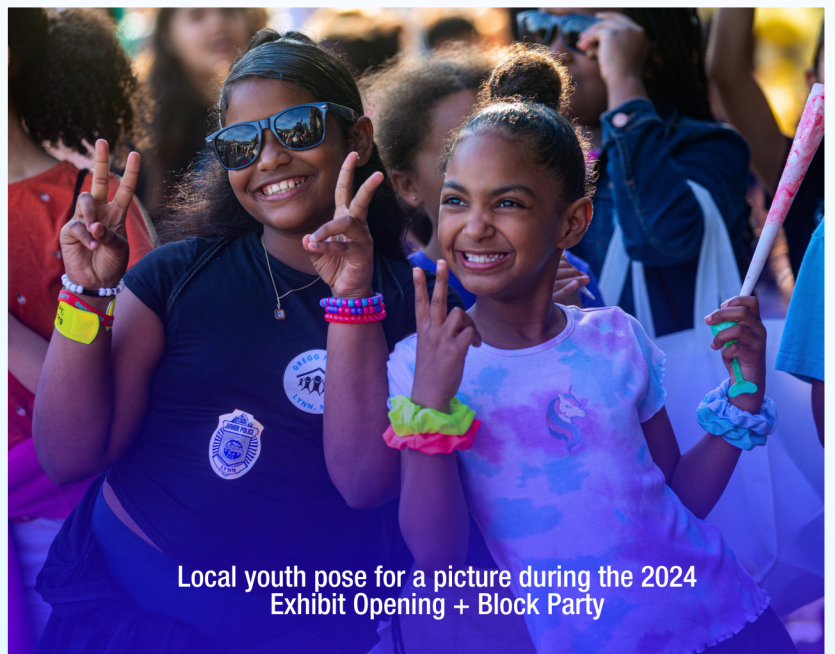
Local youth pose for a picture during the 2024 Exhibit Opening + Block Party

Summer at RAW is that magical time when our studio spaces are buzzing with our summer groups. Young people bring reinvigorated energy into the building and dive deep into their art-making with passion! The day-long one week format allows youth to foster strong connections and focus their creativity which creates a powerful sense of community at RAW.