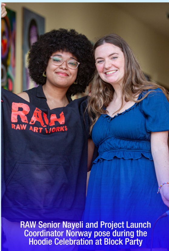
RAW Senior Nayeli and Project Launch Coordinator Norway pose during the Hoodie Celebration at Block Party

With everything RAW has slated for the months ahead, we are projected to connect with more than 900 youth throughout the community. We are wishing everyone a creative, restful, and fun summer!