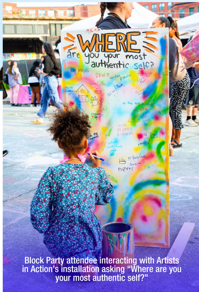
Block Party attendee interacting with Artists in Action's installation asking "Where are you your most authentic self?"

In today's world, many youth feel pressured to suppress their true selves to avoid judgment and conform to narrow societal standards. RAW is challenging this paradigm with our 2024 theme: UNFILTERED. This theme celebrates authenticity and empowers youth to proudly embrace their unique qualities, turning what might be deemed "cringe" into a badge of honor.