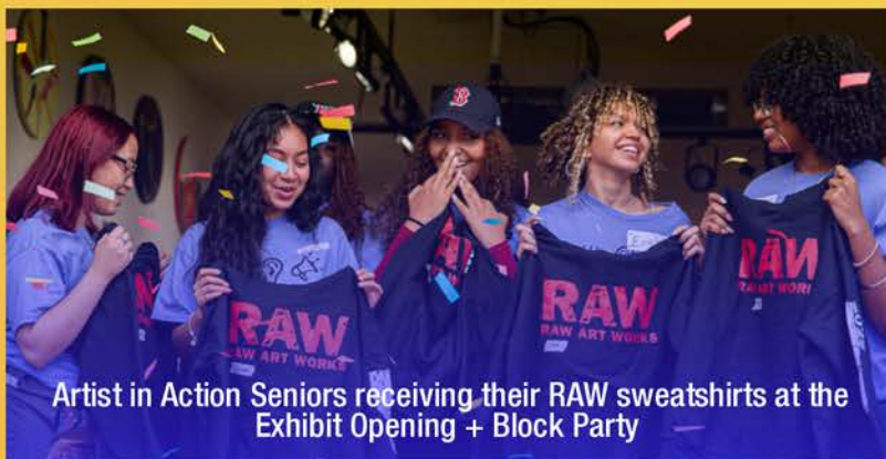
Artist in Action Seniors receiving their RAW sweatshirts at the Exhibit Opening + Block Party