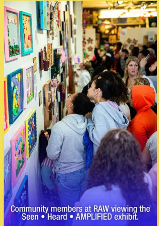
Community members at RAW viewing the Seen • Heard • AMPLIFIED exhibit.

We were also thrilled to welcome back our partners from the Lynn Education District, who added to the energy with information tables, food, and activities for families and visitors. More than just a party, this event was a celebration of community, creativity, and the unshakable power of youth voice.