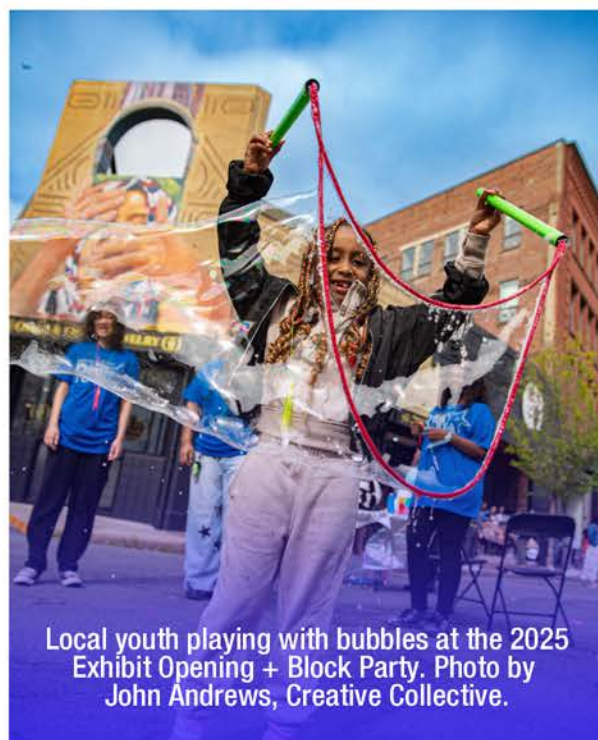
Local youth playing with bubbles at the 2025 Exhibit Opening + Block Party.

At RAW, we believe art doesn't just reflect the world, it shapes it. This show is a powerful reminder of what happens when young people use their voices and their art to lead.