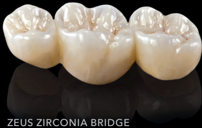
ZEUS ZIRCONIA BRIDGE