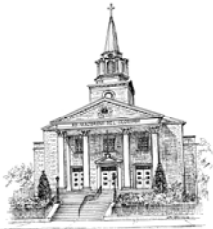
St. Bartholomew Church 4949 W. Patterson Chicago, IL 60641

www.facebook.com/stbartholomew.net Instagram: stbartholomewparish