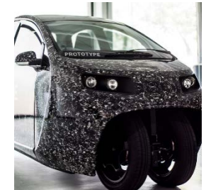
Spiri – Danish on-demand carpooling startup