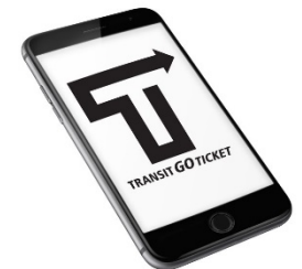
King County Metro Transit launches new app