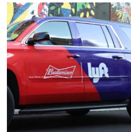
Lyft x Budweiser – rides during Thanksgiving