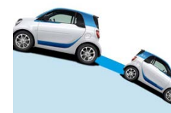
Car2go leaves Twin Cities, MN