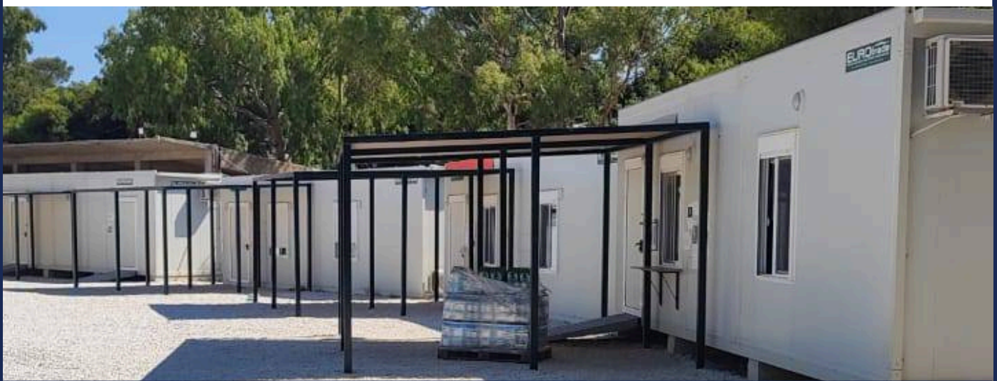
Photo: Employee containers at Corinth camp. Image shared by interview respondent. Date: June 2024.

Additional issues related to provision of health care for vulnerable groups were noted by interviewees and are covered below (from page 36).