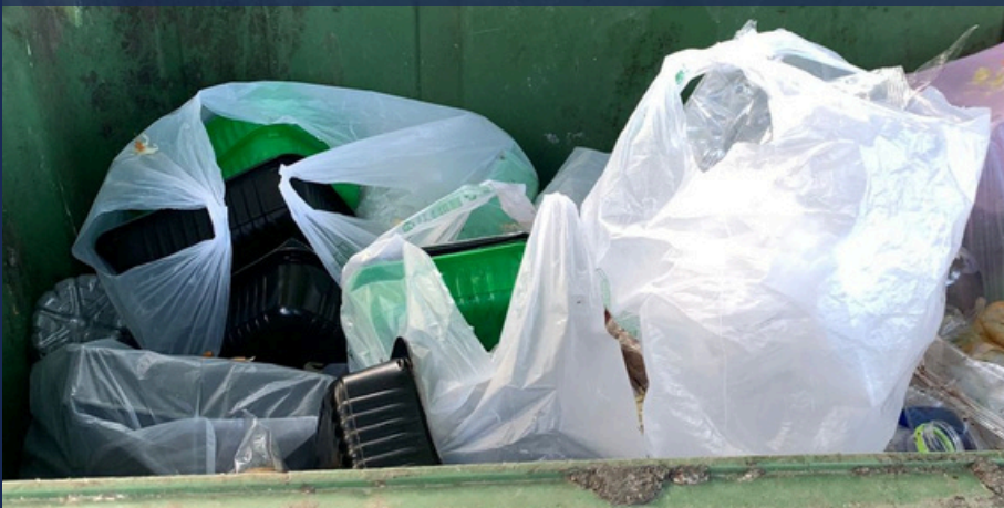
Photo right: Rotten eggs given to residents in Koutsochero camp. Date: June 2024.