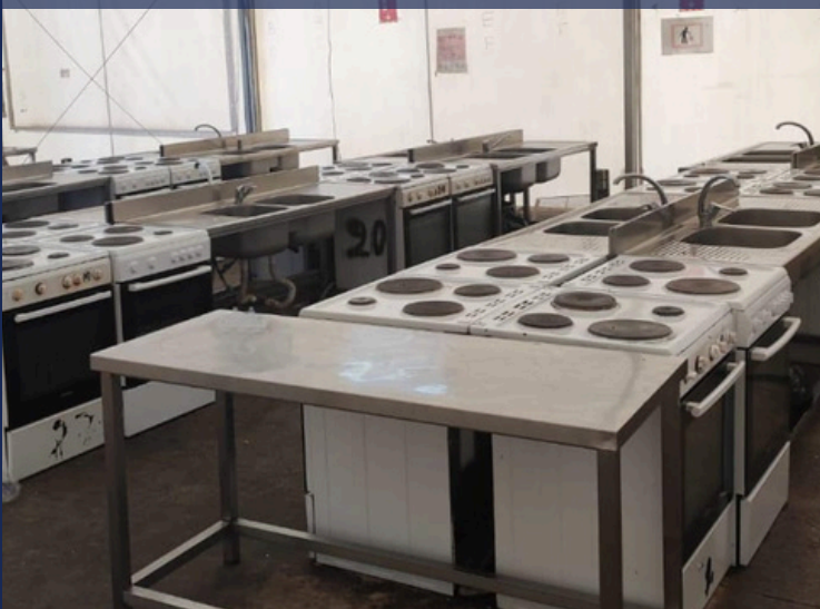
Photos: Communal cooking area in Corinth camp; back of accommodation rub halls in Corinth camp. Images shared by interview respondent. Date: June 2024.

Most interviewees in camps were provided accommodation in one or two-room prefabricated containers, while respondents living in Corinth and Oinofyta resided in rub hall tents (Corinth) and rooms within an abandoned factory building (Oinofyta), both of which have been deemed as unsuitable for long-term living 125 . In 72% of interviews across all nine camps, conditions were reported to be inadequate, due to dysfunctional appliances and poor hygiene conditions. Dysfunctional air conditioning, broken showers and lighting, bed bug and cockroach infestations, and extensive mould (see image on page 27) were the most frequently reported problems. Large holes in ceilings and floors were also reported (see image on page 28), leading to flooding