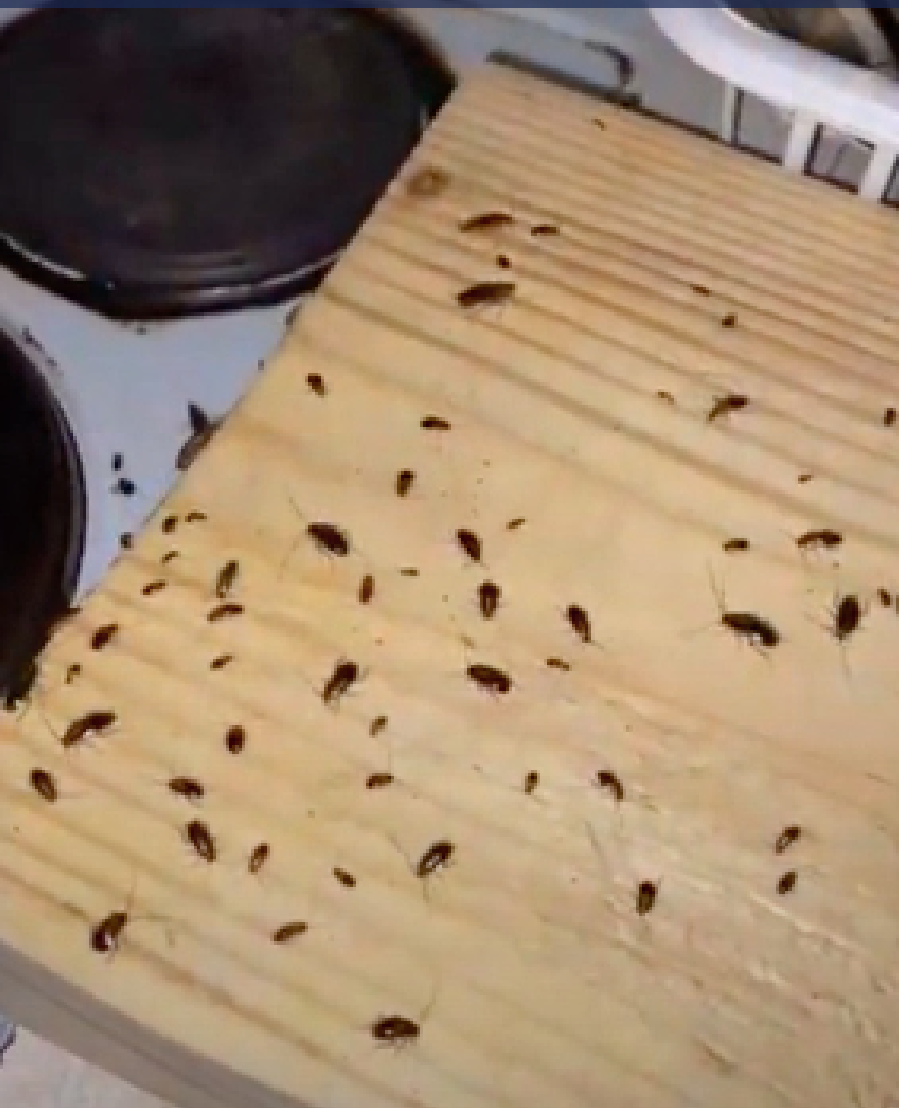
Photos: Cockroach infestation, bathroom and dilapidated door. All three depict conditions inside an accommodation container in Katsikas camp. Date: May 2024.