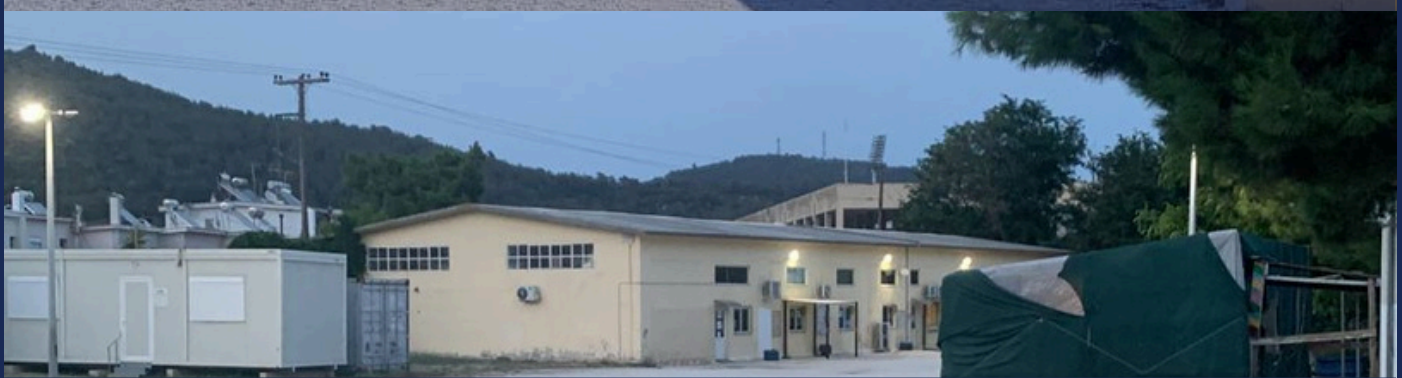
Photo: Food distribution and administration building in Kavala camp. Date: June 2024.