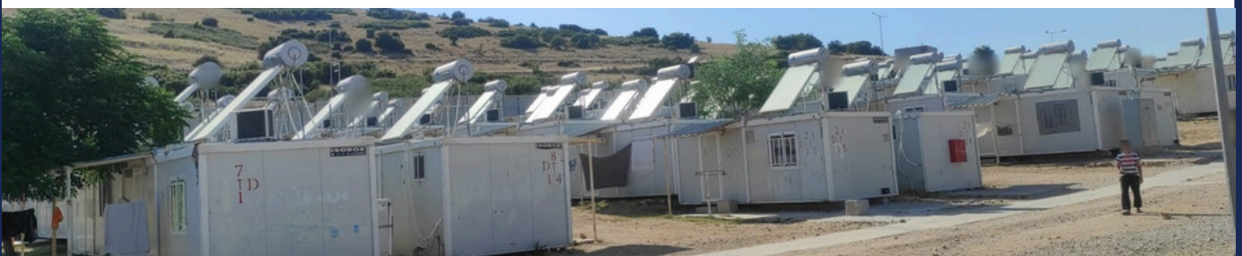
Photo: Accommodation containers in Koutsochero camp, where residents report suffering from dusty and noisy conditions due to the facility's proximity to a marble quarry.

2024 has arguably seen unprecedented disruptions in the reception system, leading to disastrous restrictions on access to material reception conditions for applicants, including people with serious vulnerabilities. The effects of the policy changes outlined above and disruptions to key services are analysed in this report (see pages 25-41).