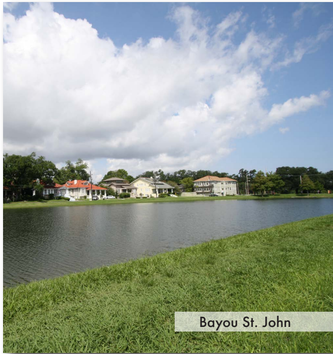
Bayou St. John