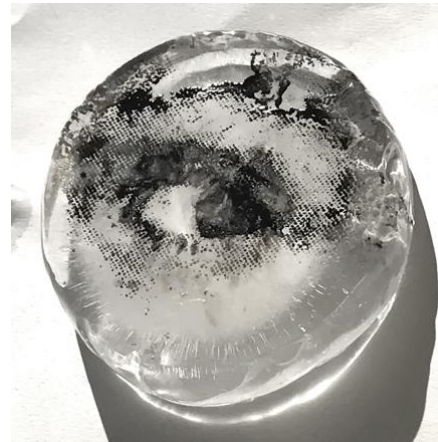
Image: (left) Derrick Adams . Shark Float , 2017. Screenprint with archival inkjet print collage. Sheet: 30 x 30 inches. Printed by Erik Hougen; published by Lower East Side Printshop, NY. Edition: 12. Courtesy of Lower East Side Printshop, Inc. Image © 2018 Derrick Adams. (right) Eszter Sziksz . Guardian , 2017. Screenprinted melting ice, digital print, and animation. Digital print sheet: 25 x 25 inches. Screenprinted ice beginning dimension: 2 1/2 inches (diameter). Printed and published by the artist. Edition: Unique. Image © 2018 Eszter Sziksz.

International Print Center New York (IPCNY) announces the fifty-seventh presentation of its New Prints Program , a biannual, juried open call for prints and print-based work created in the preceding twelve months. Titled Edging Forward , the exhibition was selected from a record 1,313 applicants , who submitted work from all 50 states as well as Europe, Asia, South America, and Africa. Countries represented in the exhibition include India, the Netherlands, South Africa, and Ukraine, among others.