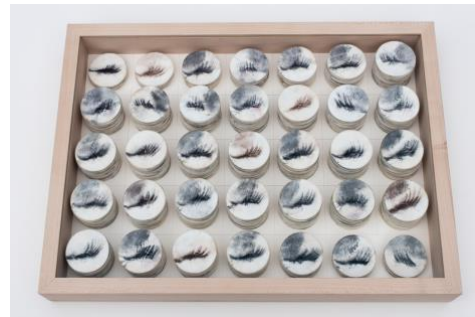
Image: (left) Neah Kelly . ThreeDee Collective: Flat Face Fish Tail (petite no. 1) , 2017. Intaglio and recycled print paper sculpture with hand-stitching and thread. 3 x 5 x 3 inches. Printed and published by the artist. Edition: Unique. Image © 2018 Neah Kelly . (right) Monica Velez . Pin-Up Project , 2017. Eyelash frottage on cotton pads and thread—365 nights, two per day, layered month by month. 4 3/16 x 19 11/16 x 2 1/4 inches. Printed and published by the artist. Edition: Unique. Image © 2018 Monica Velez .