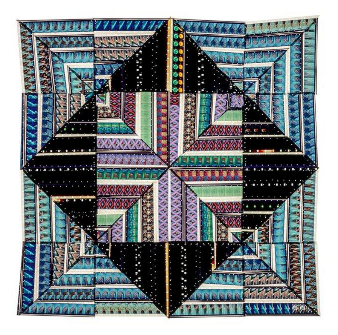
Figure 5: Sabrina Gschwandtner, Hands at Work (for Pat Ferrero) , 2017. 16 mm film, polyester thread, 14 7/8 x 14 7/8 x 3 in.

Through the techniques that she uses, Gschwandtner inserts her work within this feminist critique of film labour, as she writes "for me, what related my work more to 'craft critique' and to feminist traditions was that the labor of the work was being done by me, with needle and thread or yarn – these things that signify what has historically been labelled 'women's work,' just like film editing has been."<sup>45</sup> While reproducing a form of gendered labour with her own body in the fabrication of film quilts, Gschwandtner transcends the reproductive aspect of editing and sewing by calling