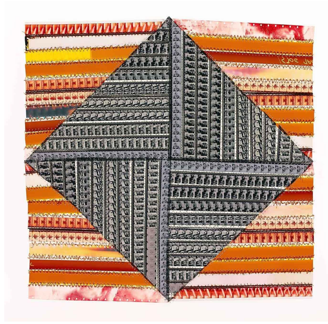
Figure 4: Sabrina Gschwandtner, Elizabeth Keckley Diamond , 2014. 16 mm film, polyester thread, lithography ink, 15 7/8 x 15 13/16 x 3 1/16 in.

those who claimed ownership over them, frequently with highly creative techniques and styles, and it is through her craft as a seamstress that Keckley gained recognition and her eventual freedom. Unlike her other quilts from the series Hands at Work, Elizabeth Keckley Diamond works in a quasi-monochromatic manner, setting up a stark contrast between the warm coloured background made of film leaders and the cool-toned diamond shape depicting the quilt-maker. This striking contrast and the structure assemble a powerful portrait of Keckley through an allegory of her craft. With her film quilt, Gschwandtner pays homage to a key figure of American history and art.