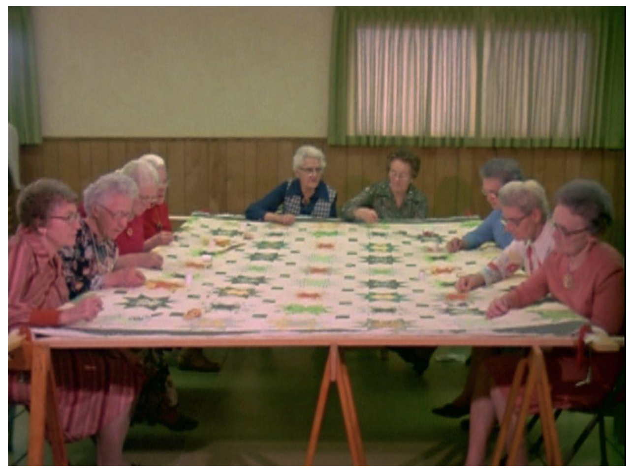
Figure 2: Pat Ferrero, Quilts in Women's Lives, 1981. 16 mm, 28 mins, documentary. New Day Films.

Pat Ferrero's film Quilts in Women's Lives (1980) follows this commitment to providing a platform to women's crafts by giving a voice to a series of quilters in the form of oral histories. Ferrero films each quilter in frontal shots, without offering an overarching voice to organise their individual experiences. Mirroring the structure of the quilts themselves, interviews are juxtaposed without any apparent order, leaving it to the viewers to form conclusions or "patterns" about the film's message. As Anne R. Kaplan notes, "the choice of the quilters (a black, an immigrant, unmarried sisters, an artist, a schoolteacher, early middle aged and elderly women, and so forth) makes the point that the art of quilting belongs to a great variety of women at different stages of life, who derive different kinds of gratification from it." The film seems to argue that orality is embedded within the fabric and structure of the quilts, as they become mirrors to the socio-economic